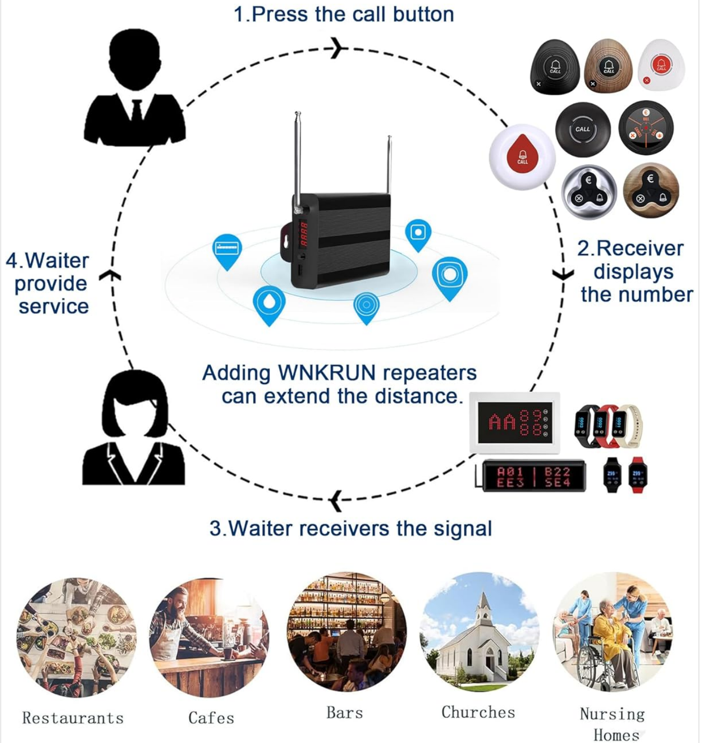
Figure 3.1: Workflow of the WNKRUN system: Guest presses call button, receiver displays number, waiter receives signal, waiter provides service.

Restaurants, cafes, hotels, bars, hospitals, nursing homes, clinics, churches, banks, etc.