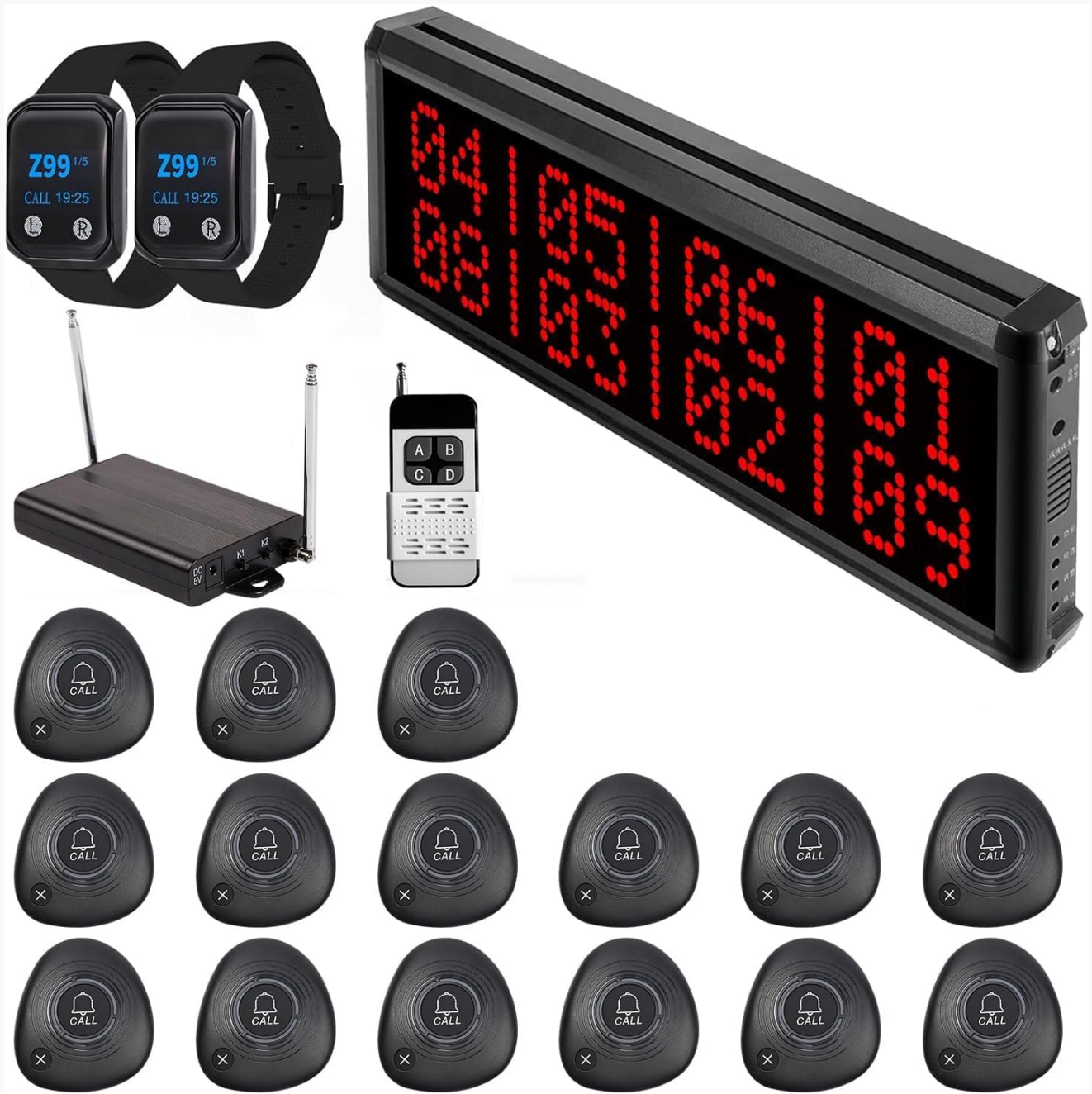
Figure 1.1: Overview of the WNKRUN Wireless Calling System components, including the display, call buttons, watch pagers, signal amplifier, and remote control.