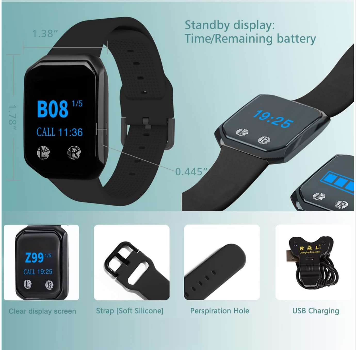
Figure 2.3: Close-up of the CS-200E watch pager, showing its clear display screen, silicone strap, perspiration hole, and USB charging port.