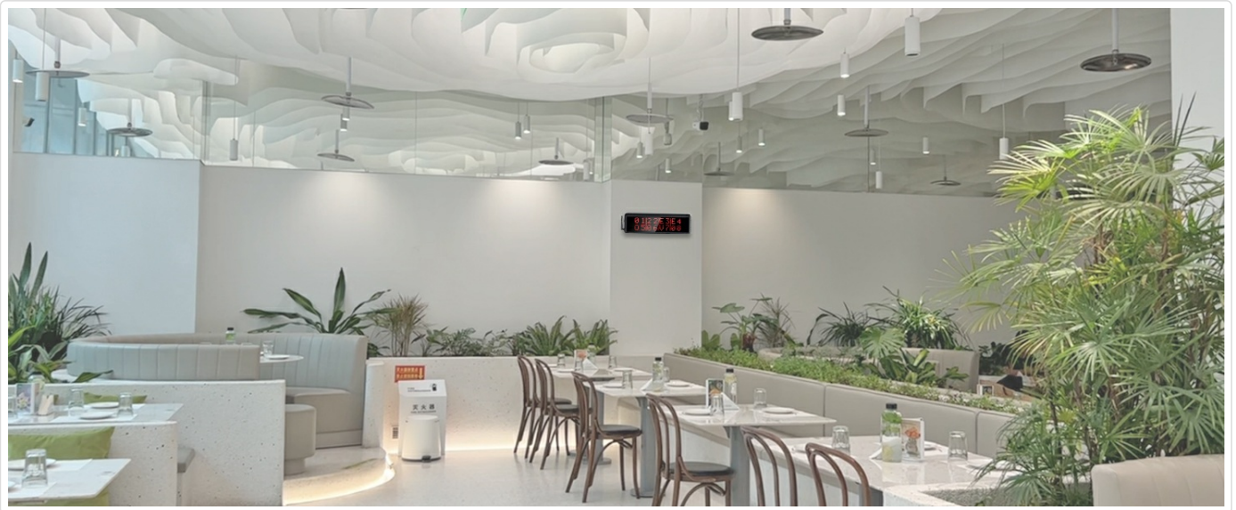
Figure 2.1: The CS-400D display unit, showing its dimensions (16.93" x 4.64" x 1.18") and the remote control. It supports single, four, or eight group display modes.