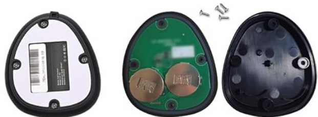
Figure 4.1: Step-by-step guide for replacing the batteries in the CS-M2 call button.