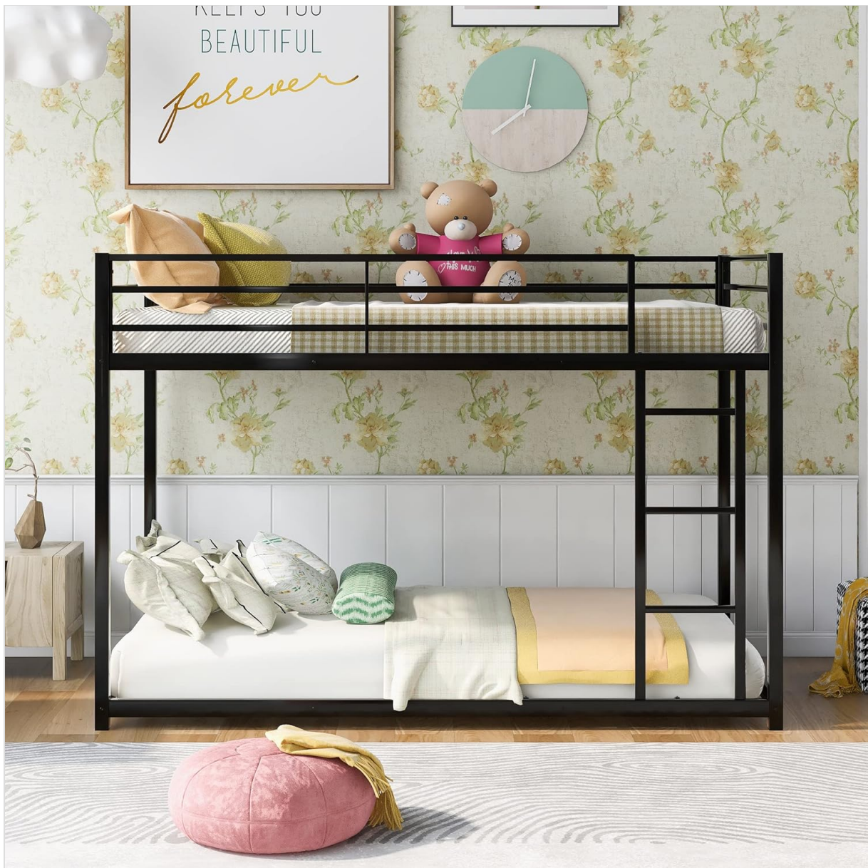
Image: The Bellemave Twin Over Twin Metal Bunk Bed in a bedroom, illustrating its low bunk design and overall appearance.