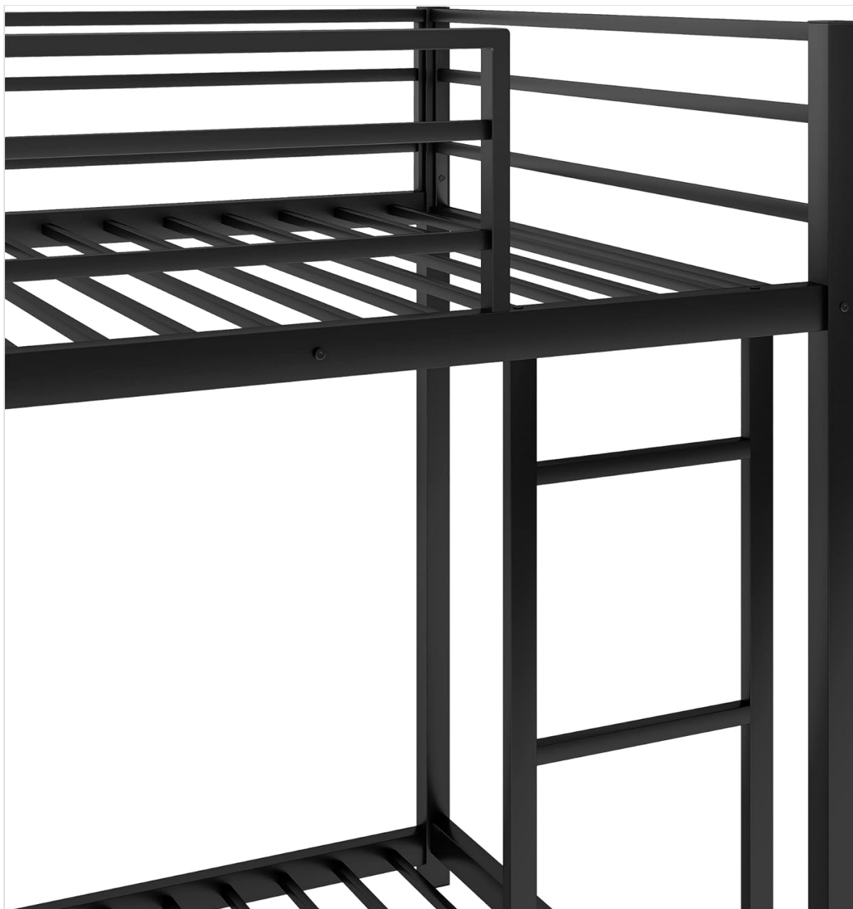
Image: Close-up of the bunk bed's ladder and frame, highlighting the sturdy metal construction and secure guardrails.