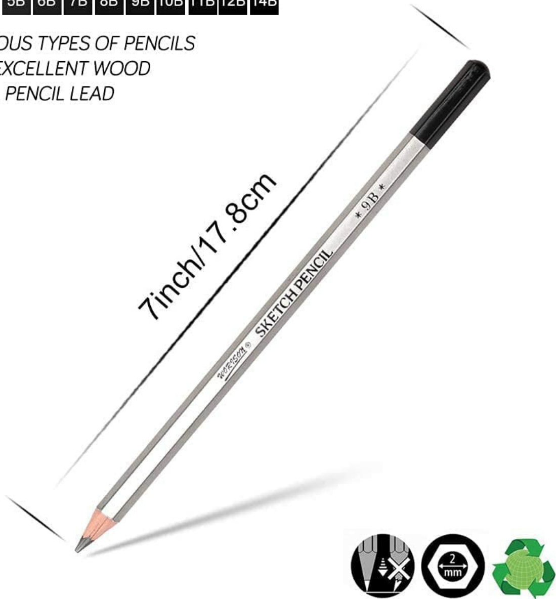
Figure 2: Illustration of pencil grades and a single pencil's dimensions (7 inches / 17.8 cm).