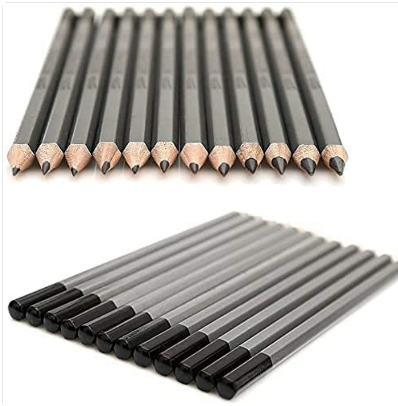
Figure 3: Close-up of sharpened pencil tips, ready for use.