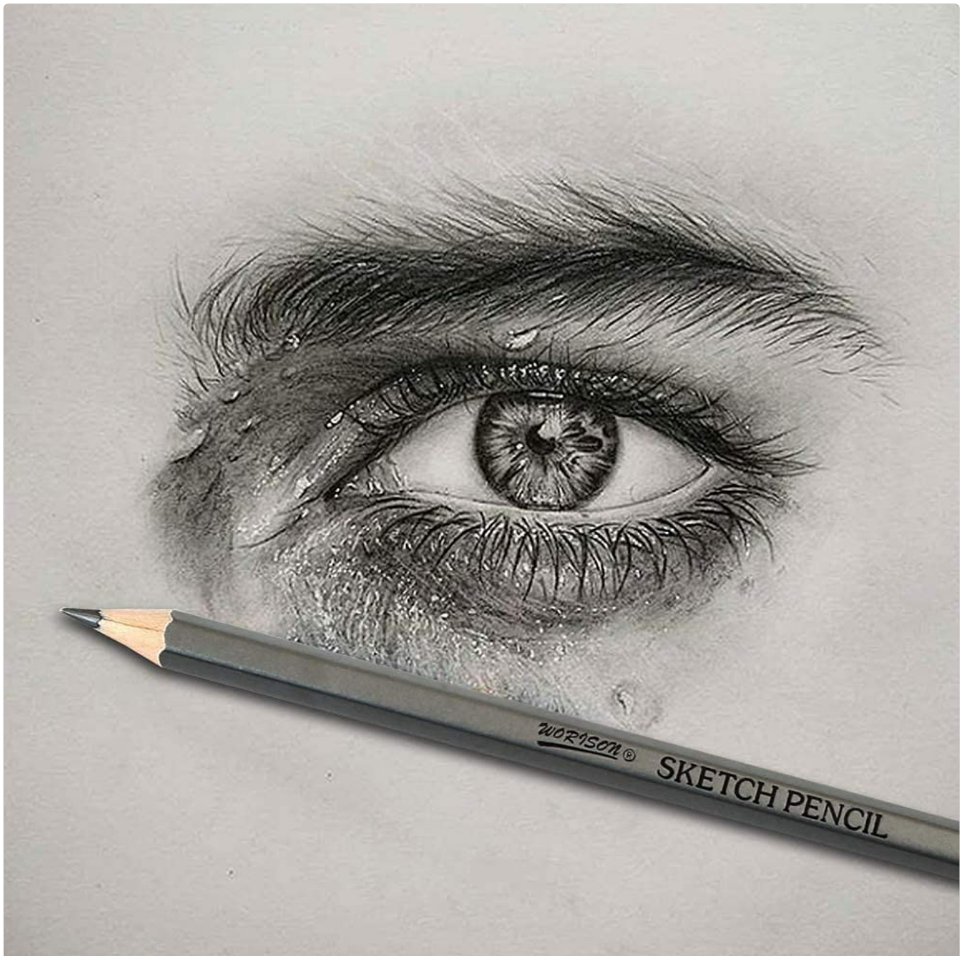
Figure 6: A detailed graphite drawing of an eye, showcasing fine lines and shading achievable with the pencils.