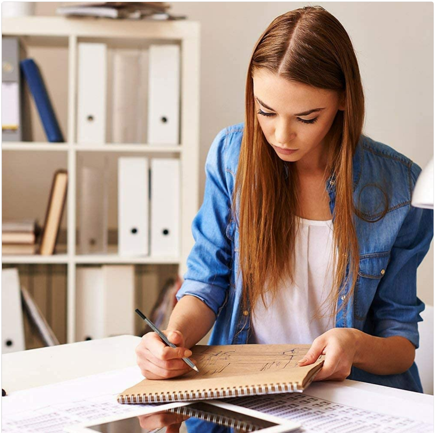
Figure 4: An artist using a Levin pencil for sketching in a notebook.