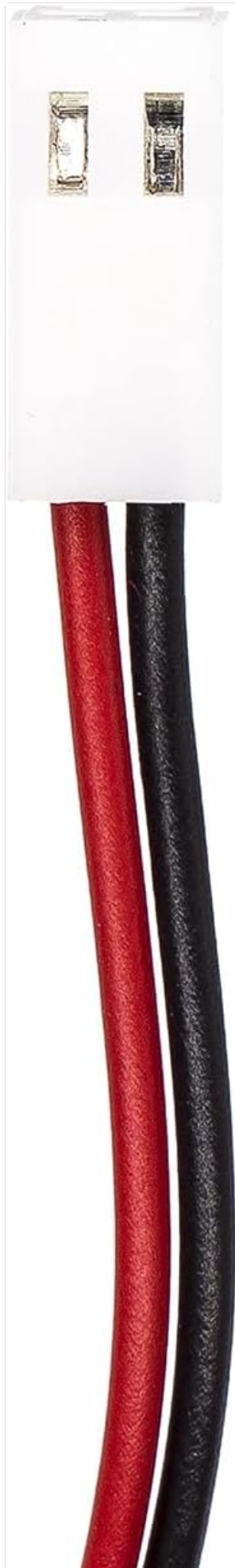
Image 4.2: A detailed view of the white connector on the battery, which plugs into the device.