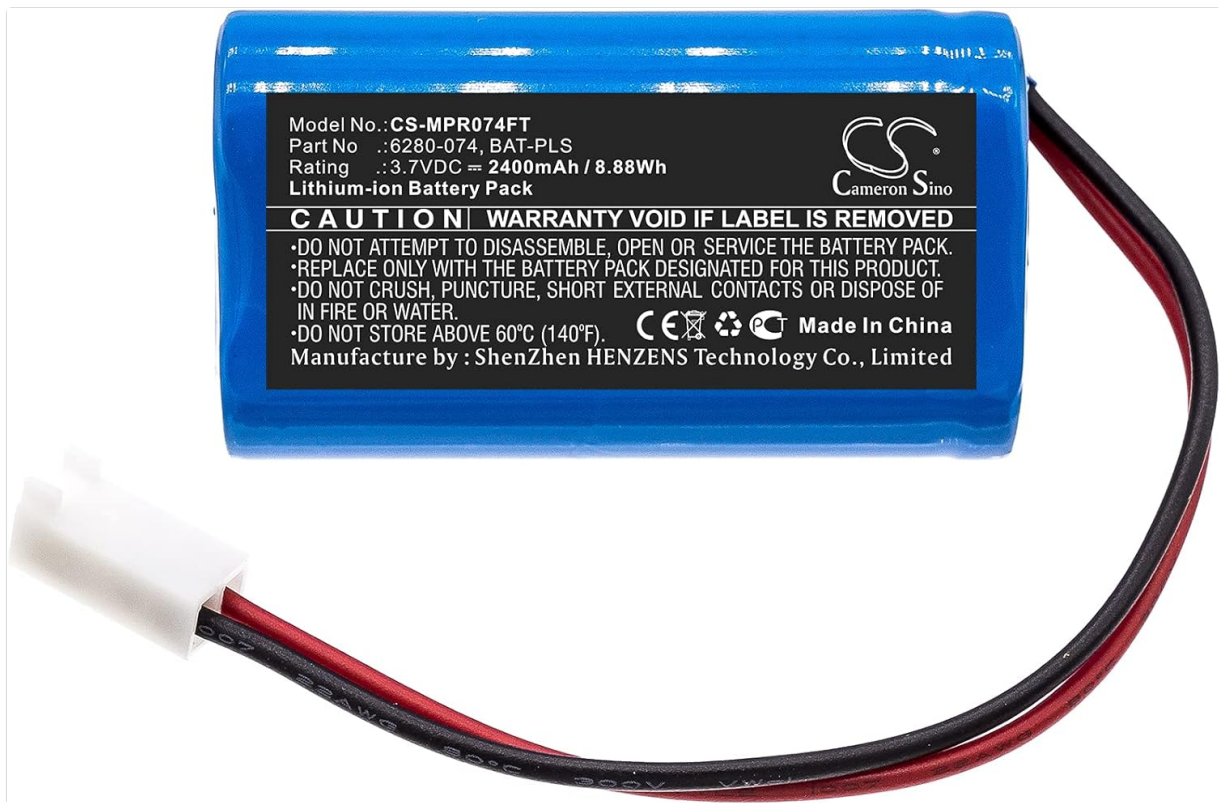
Image 2.1: The BCXY replacement battery showing its label with model number, specifications, and critical safety warnings.