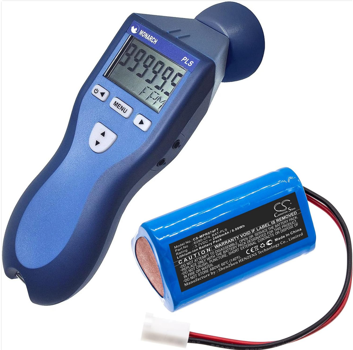
Image 5.1: The BCXY replacement battery shown alongside the Monarch Pocket LED Stroboscope, illustrating its intended use.

This BCXY replacement battery is designed to power your Monarch Pocket LED Stroboscope. Once installed, the battery functions automatically to provide power to the device. Refer to your Monarch Pocket LED Stroboscope's original instruction manual for specific operating procedures of the stroboscope itself.