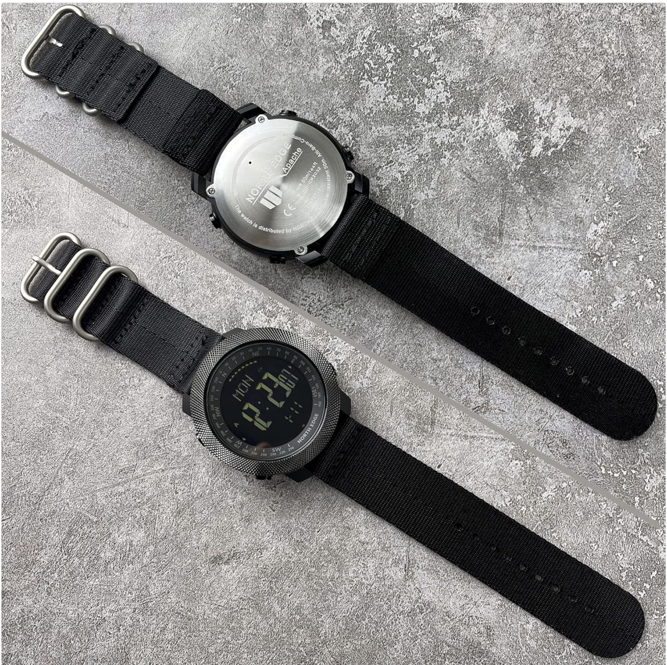
Figure 7: Views of the watch showing the durable nylon strap and stainless steel back.