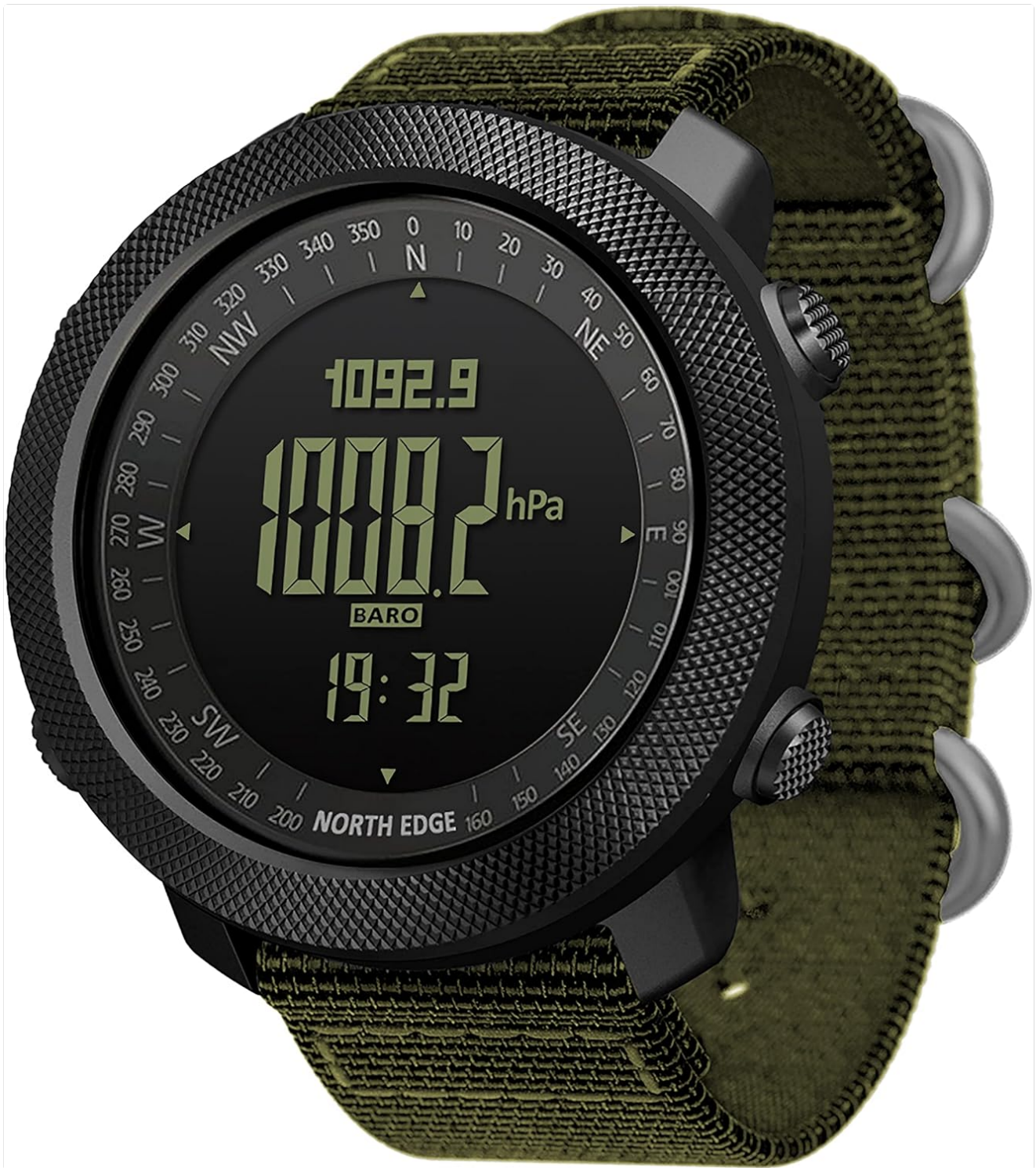
Figure 1: Front view of the NORTH EDGE Apache Tactical Sports Watch.