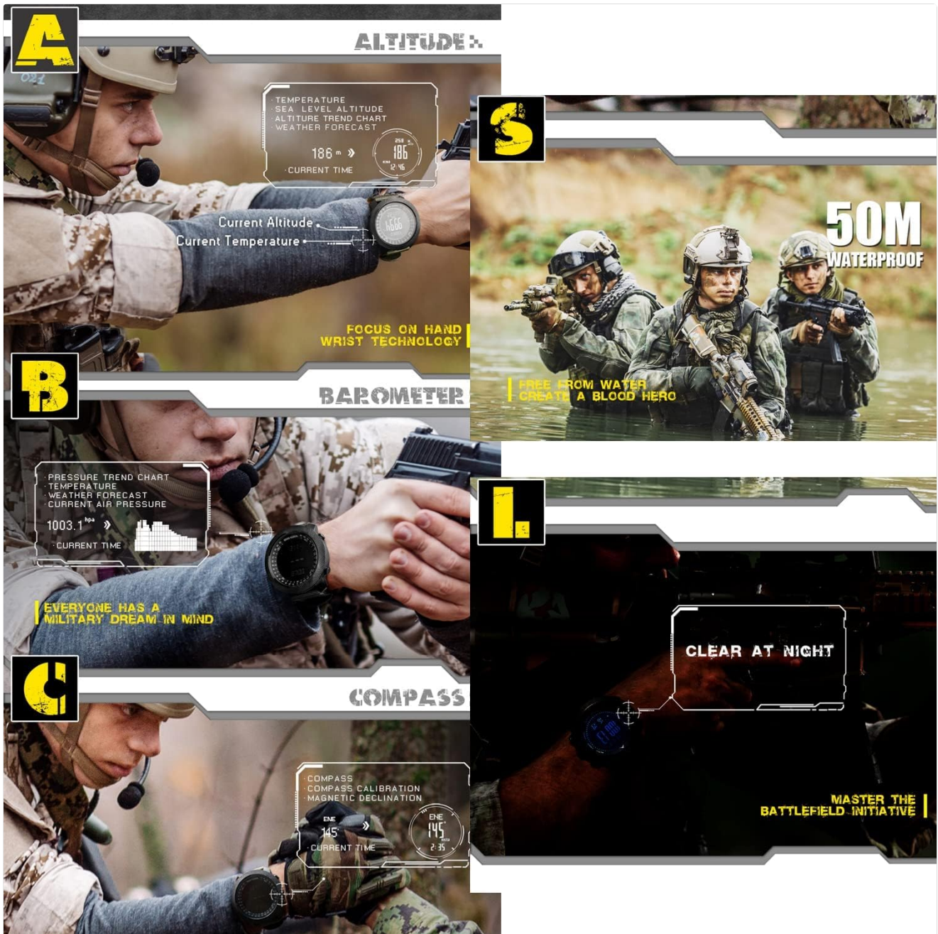
Figure 5: Visual representation of Altimeter, Barometer, and Compass functions.