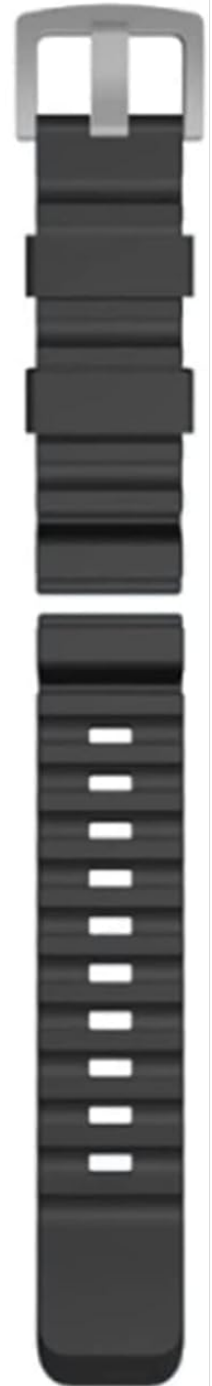
Figure 3: The watch includes an extra silicone band for interchangeability.