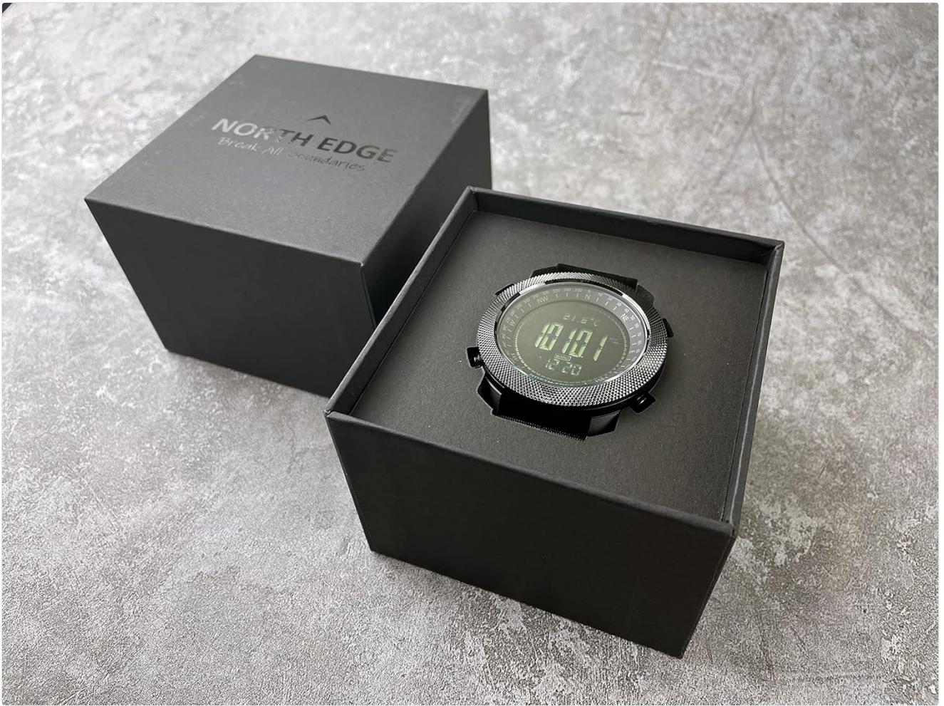
Figure 2: The NORTH EDGE Apache watch packaged in its gift box.