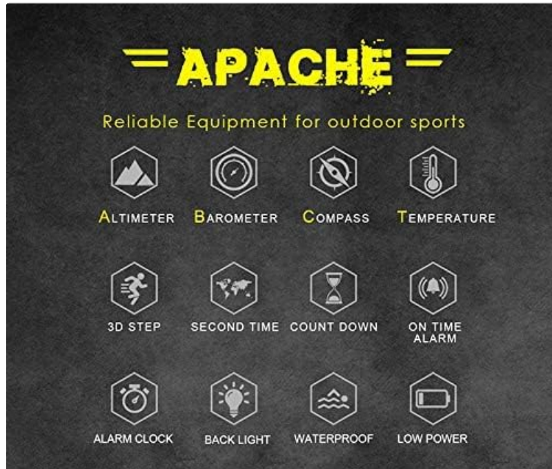
Figure 4: Overview of key functions available on the Apache watch.

The NORTH EDGE Apache watch features multiple modes and functions. Navigate between modes using the designated buttons (refer to watch diagram for button layout, typically on the sides of the watch case).