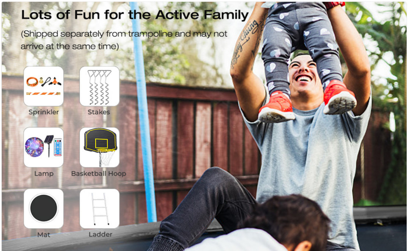
Image: A family enjoying the trampoline, with visual cues for the included accessories.