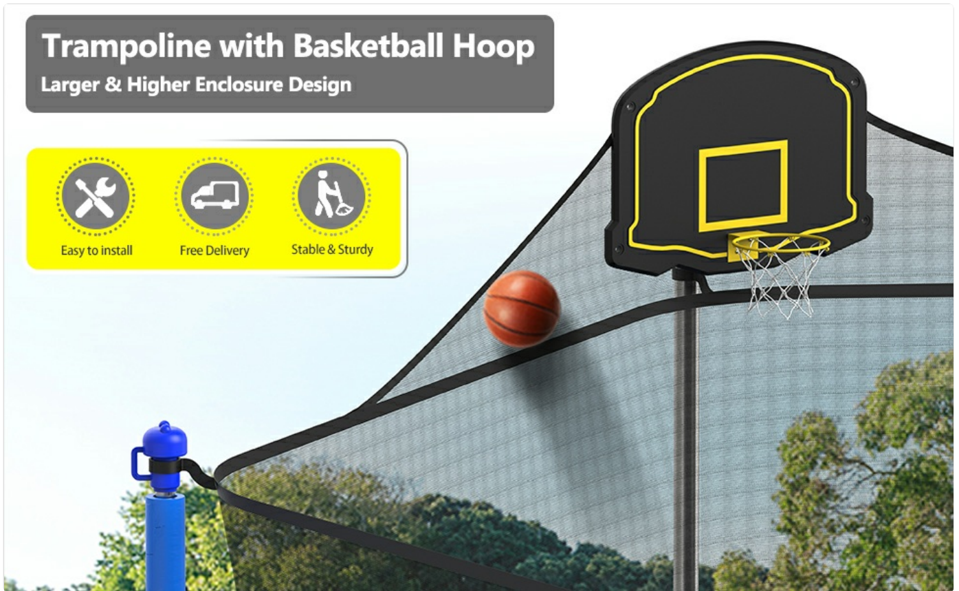
Image: The trampoline featuring the basketball hoop and sprinkler, demonstrating accessory integration.