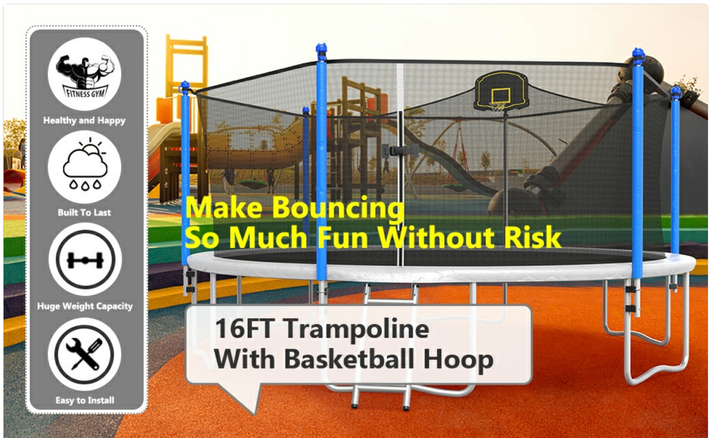
Image: The Lyromix 16FT Trampoline with its safety enclosure and basketball hoop, emphasizing safe and enjoyable bouncing.