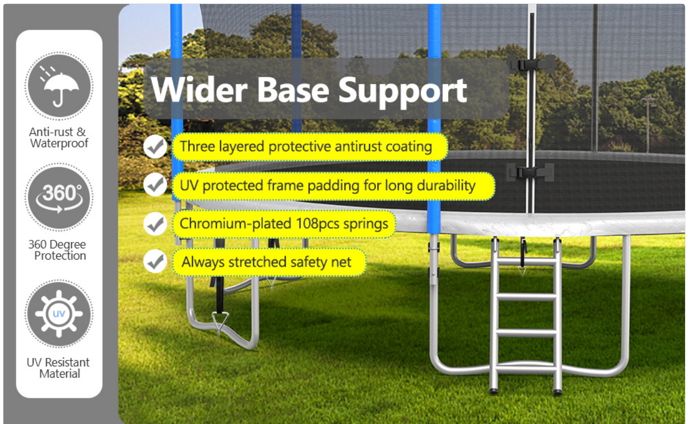
Image: Detail of the trampoline's wider base support and protective features, including anti-rust coating and UV-protected padding.