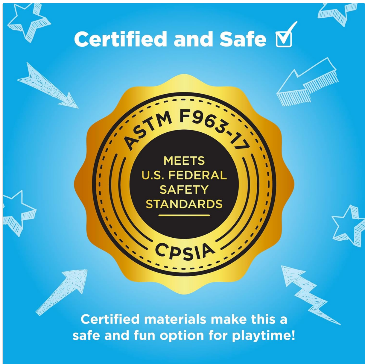
Image: A gold seal confirming the product meets U.S. Federal Safety Standards, ASTM F963-17, and CPSIA certifications.