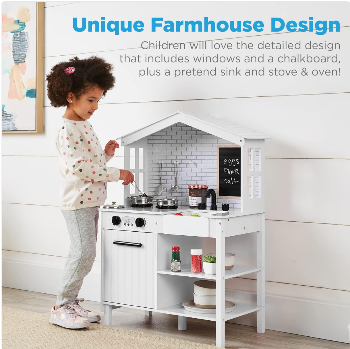
Image: A child interacting with the assembled play kitchen, demonstrating its unique farmhouse design with windows and a chalkboard.

Children will love the detailed design that includes windows and a chalkboard, plus a pretend sink and stove & oven!