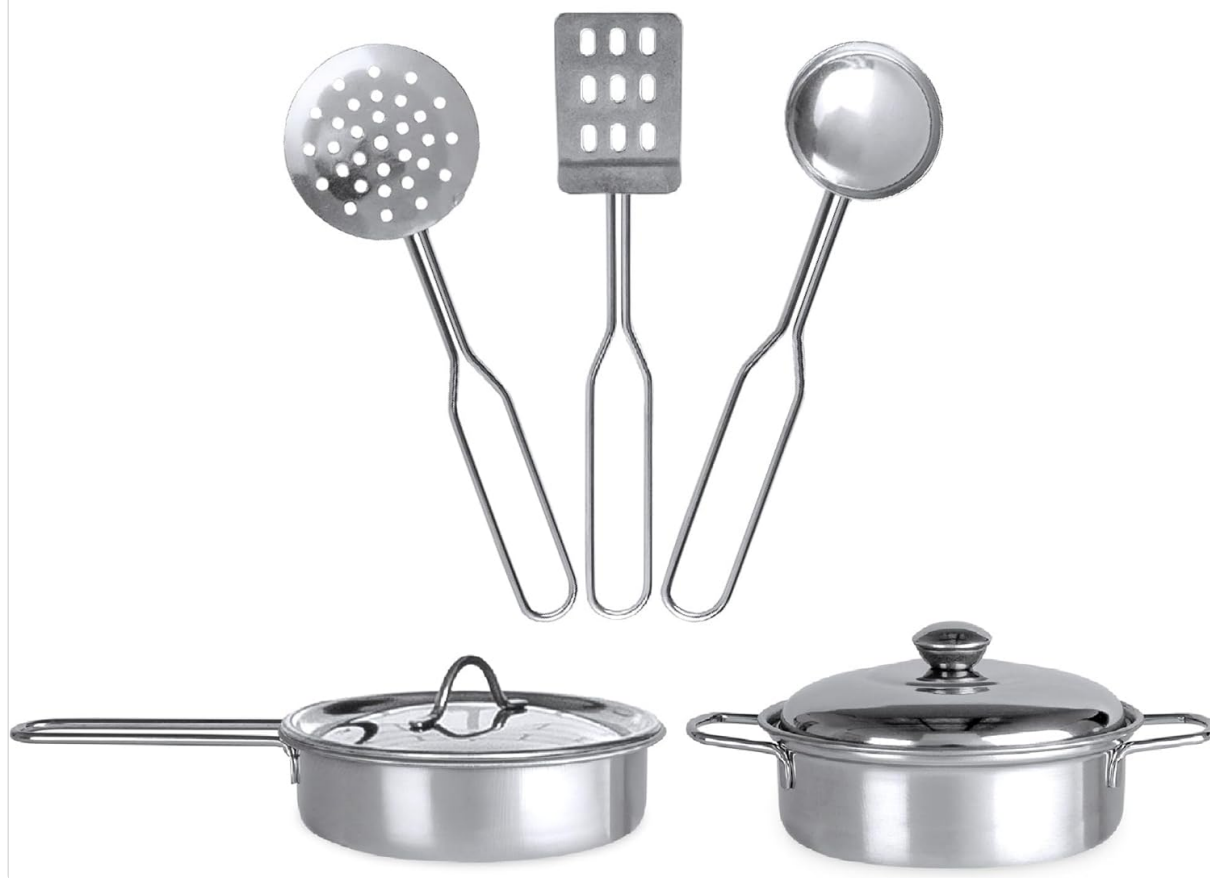
Image: The five included accessories: a slotted spoon, a spatula, a ladle, a pot with a lid, and a pan with a lid.