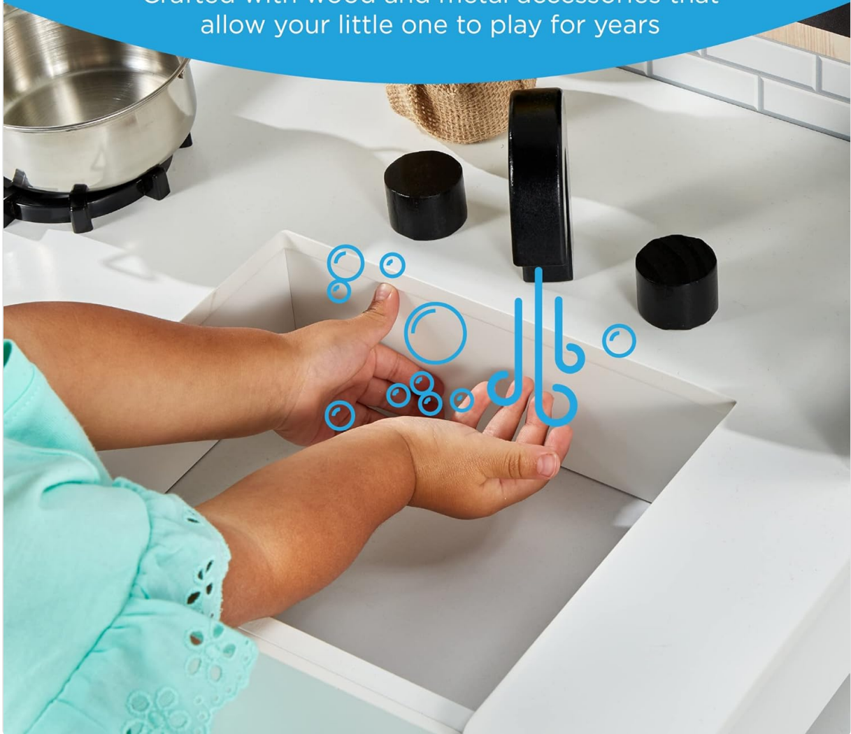
Image: A close-up view of a child's hands interacting with the pretend sink and faucet, illustrating the durable build of the play kitchen.

Crafted with wood and metal accessories that allow your little one to play for years