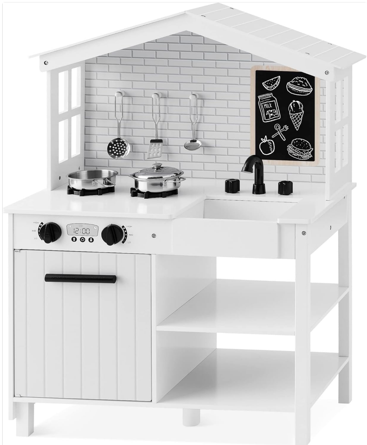
Image: Front view of the Best Choice Products Farmhouse Play Kitchen Toy, showcasing its white finish, stovetop, sink, oven, and chalkboard.