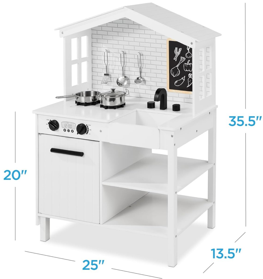
Image: A diagram illustrating the overall dimensions of the play kitchen for reference.