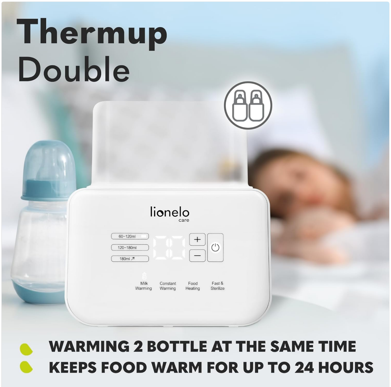
Image: The bottle warmer shown warming two bottles simultaneously, demonstrating its dual capacity and efficiency for parents of twins or for warming multiple items.