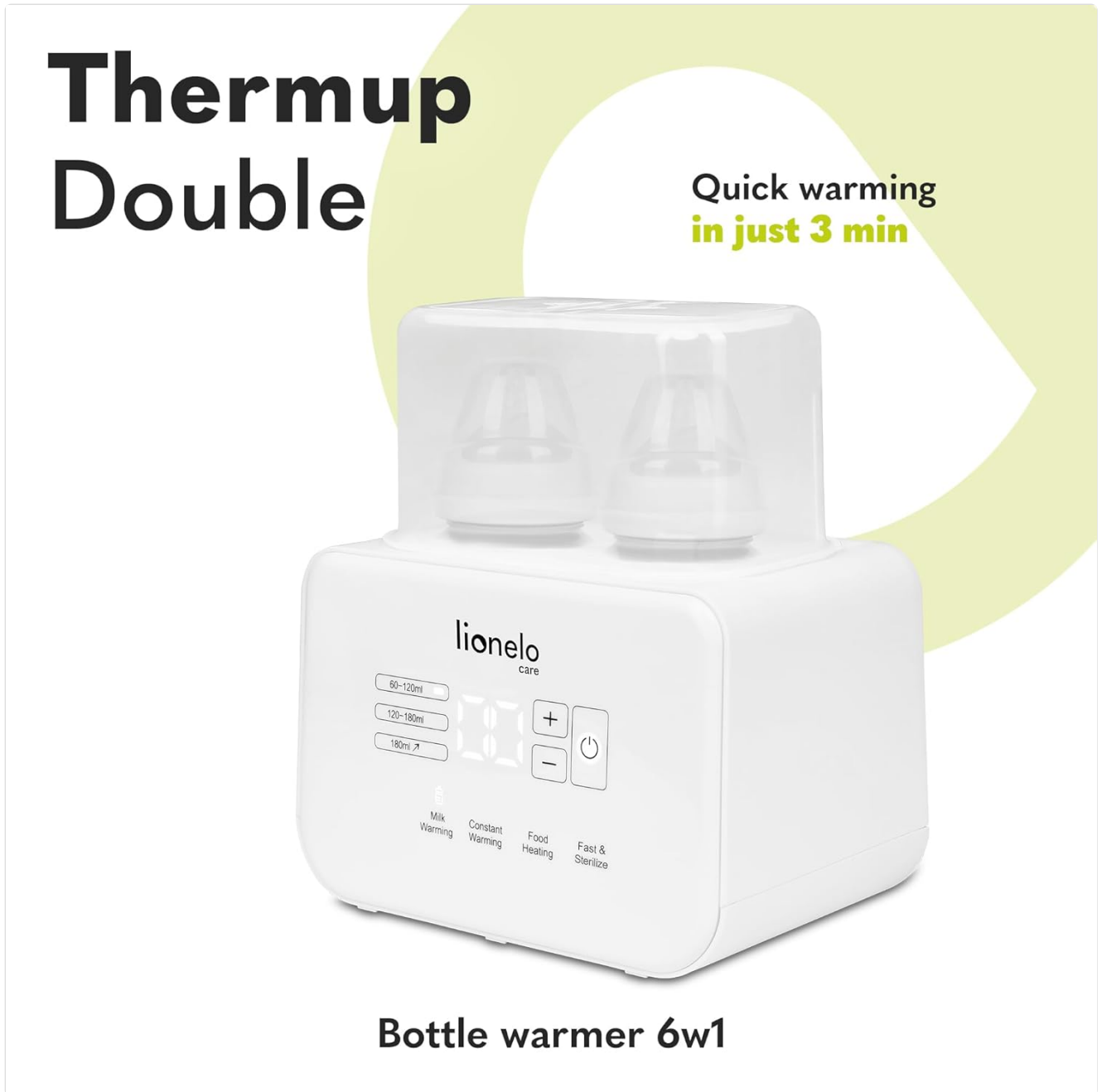
Image: The bottle warmer highlighting its quick warming capability, stating it can warm in just 3 minutes, which is beneficial for urgent feeding needs.