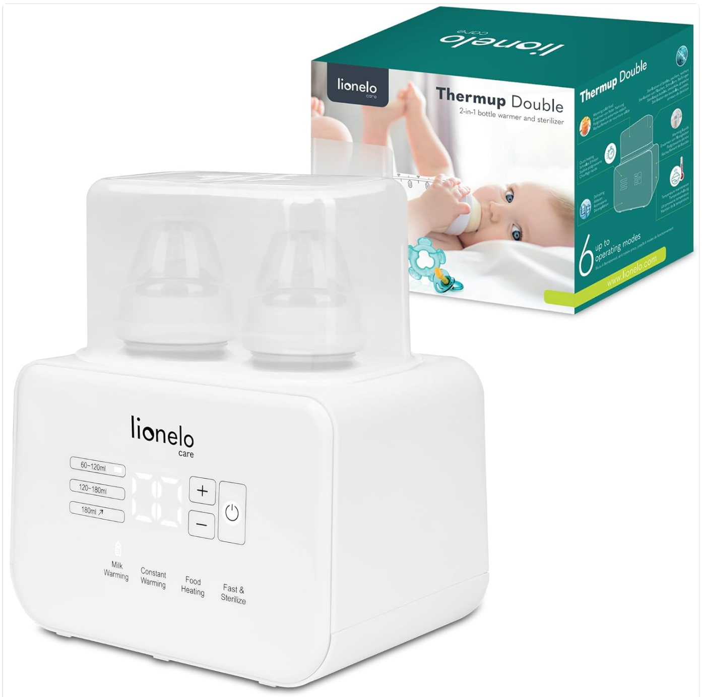
Image: The Lionelo Thermup Double Bottle Warmer shown with its product packaging, highlighting its compact design and dual bottle capacity.