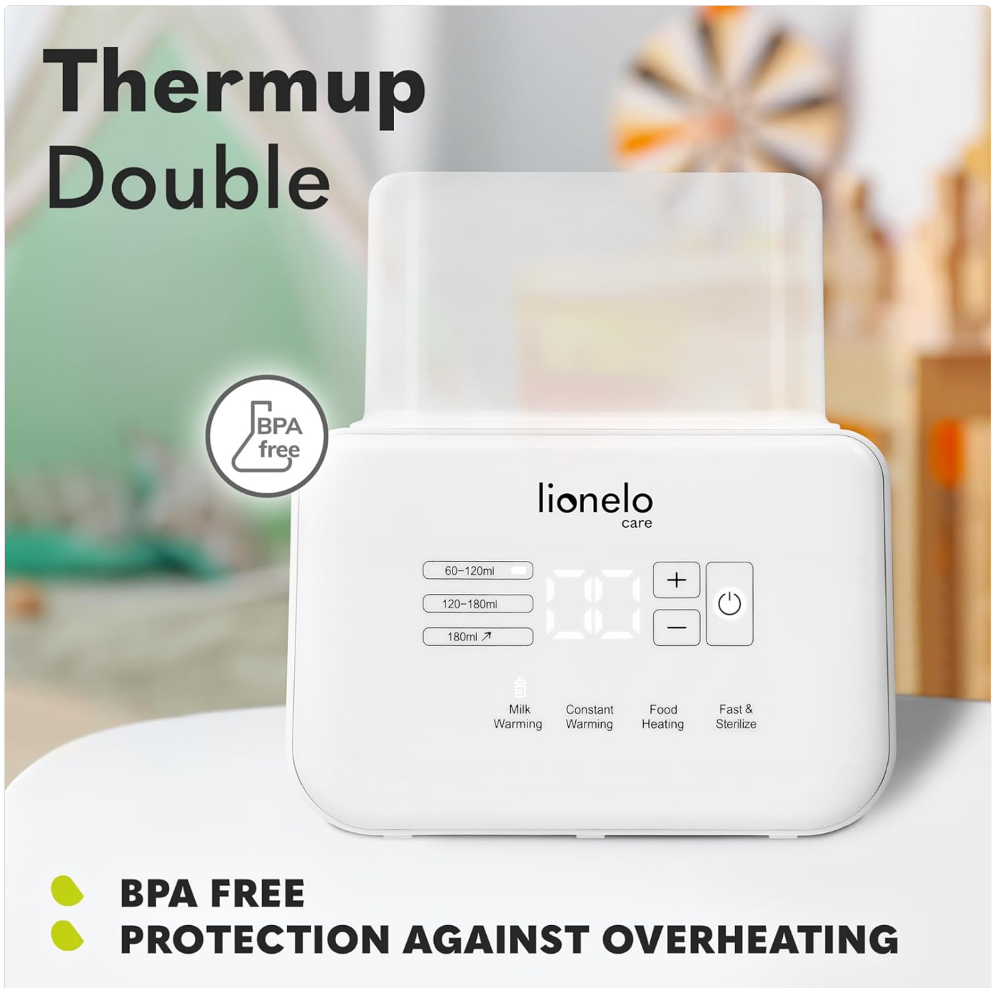
Image: Close-up of the Lionelo Thermup Double Bottle Warmer, showing the "BPA free" symbol, indicating the use of safe materials.