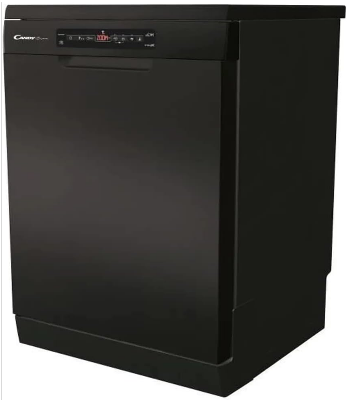
Image: Angled view of the Candy CF 3E3DFB Brava Freestanding Dishwasher, showing its side profile and compact design suitable for various kitchen layouts.