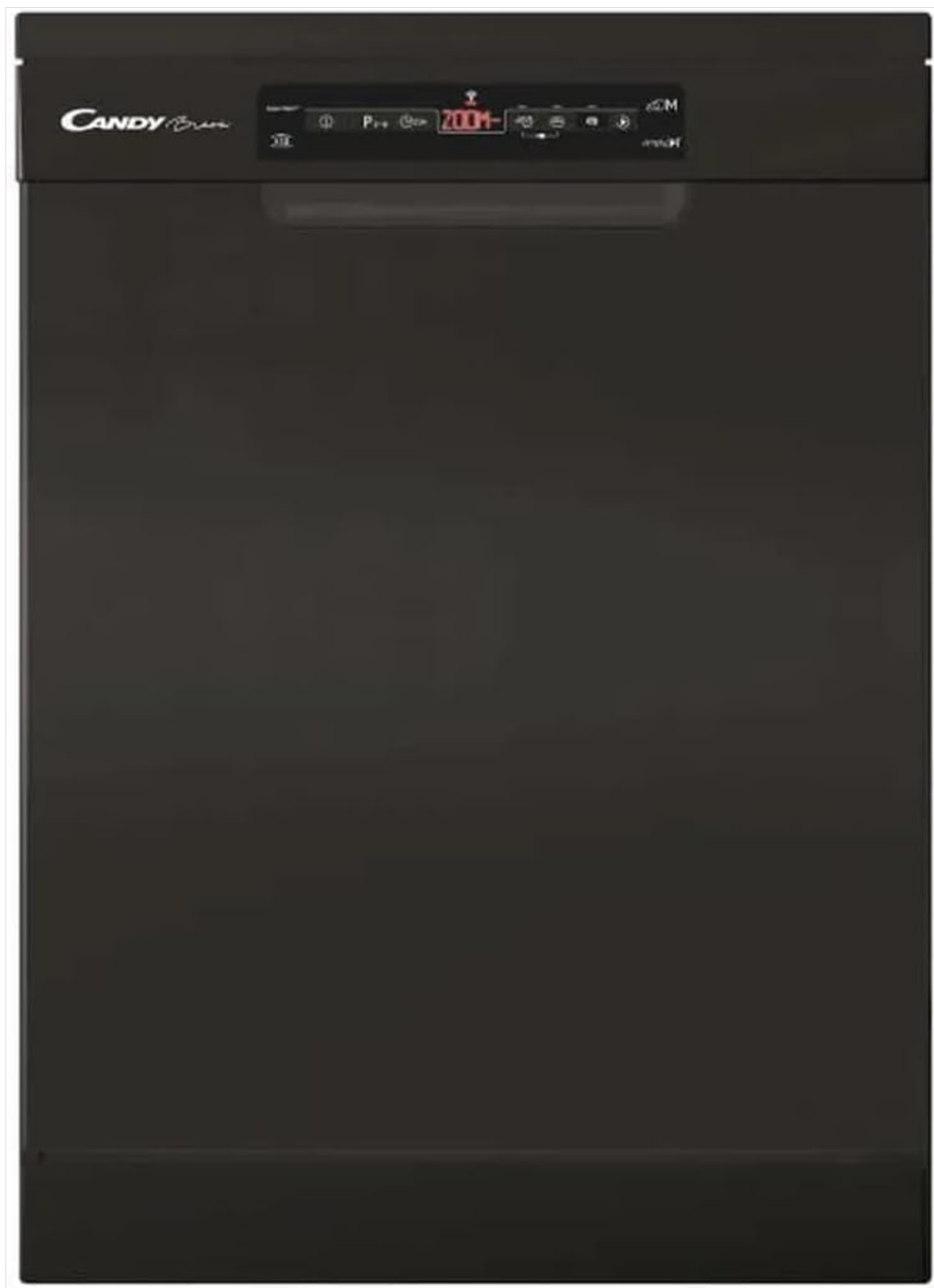
Image: Front view of the Candy CF 3E3DFB Brava Freestanding Dishwasher, showcasing its sleek black design and control panel.