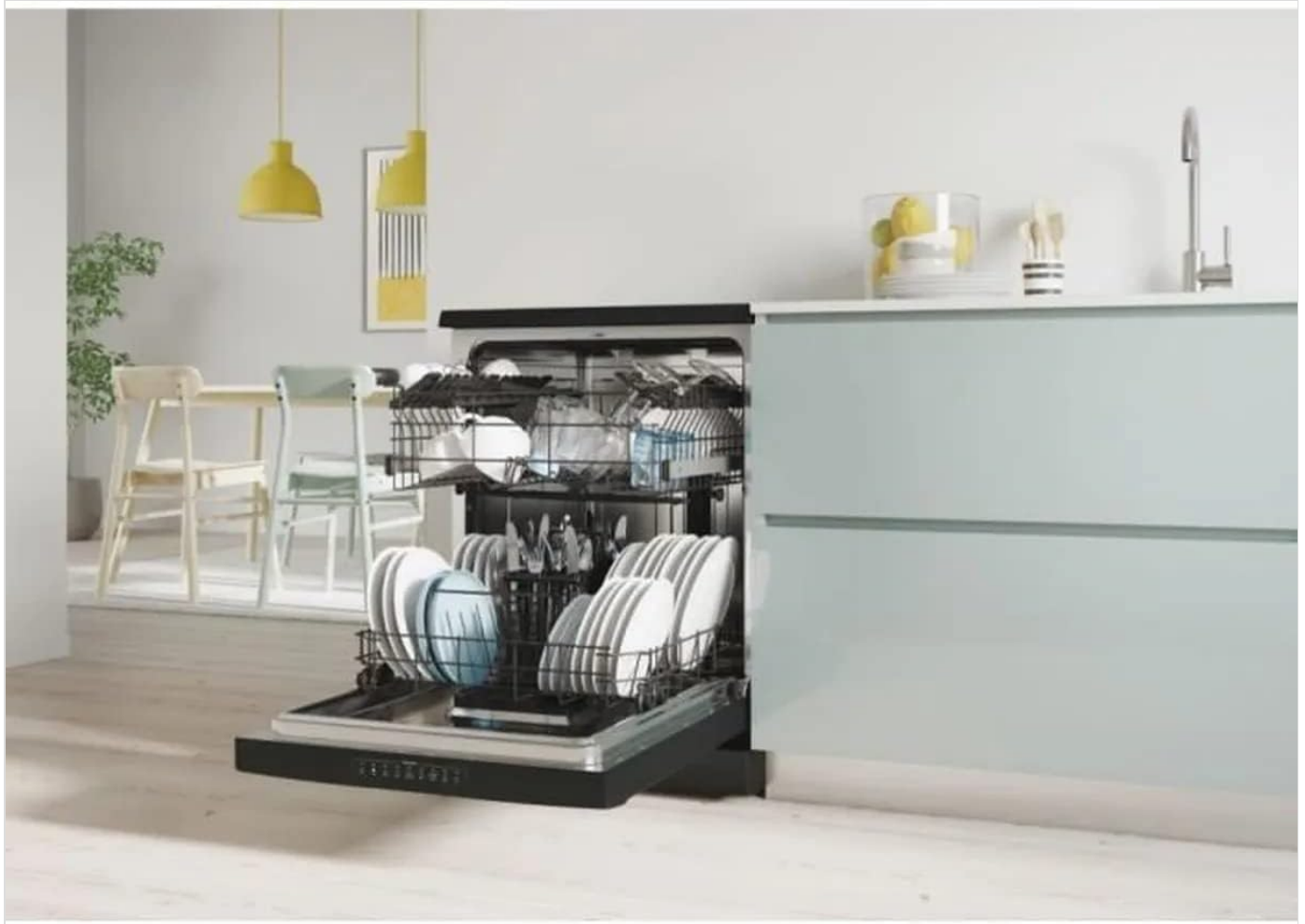
Image: The Candy CF 3E3DFB Brava Dishwasher integrated into a modern kitchen environment, demonstrating its freestanding placement next to kitchen cabinets.