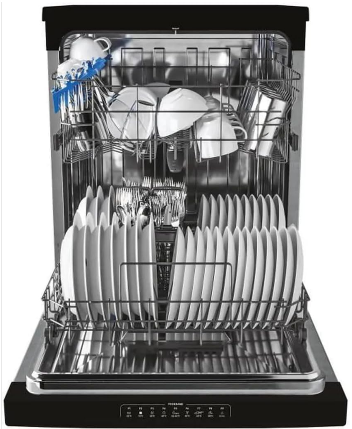
Image: Interior view of the Candy CF 3E3DFB Brava Dishwasher, showing the upper and lower racks fully loaded with plates, bowls, cups, and cutlery, demonstrating optimal loading capacity.