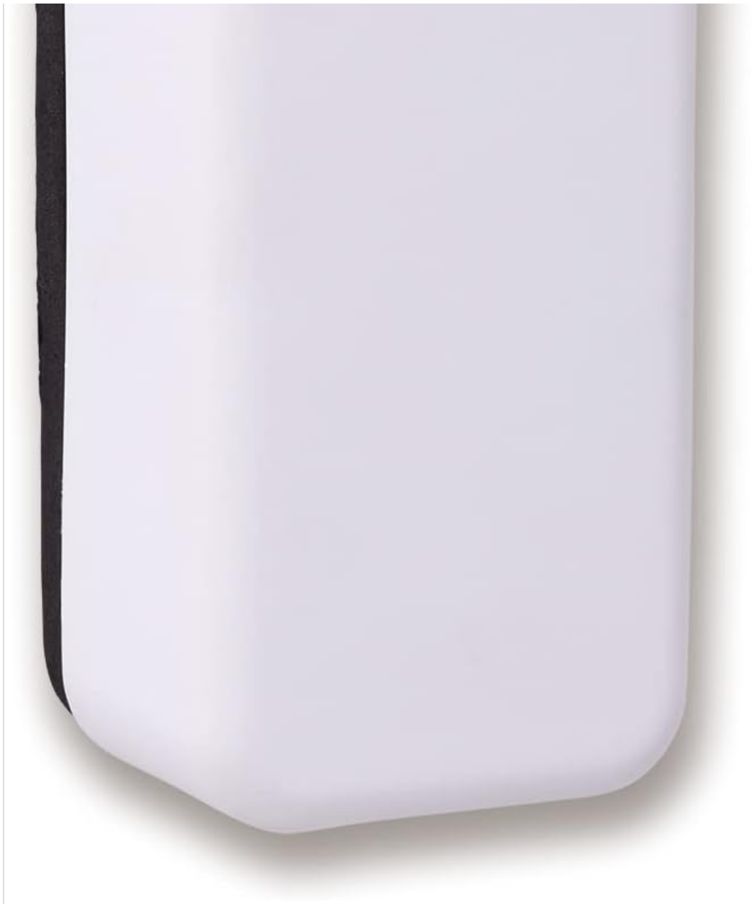
Figure 1: The Asmix WCE01 Dry Erase Eraser with Cleaner, showing its compact design with the integrated cleaner pump.