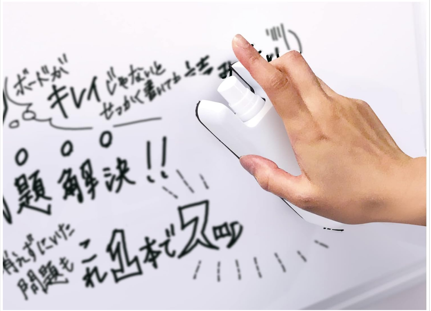
Figure 2: Erasing whiteboard markings with the Asmix WCE01. The integrated design allows for single-handed operation.