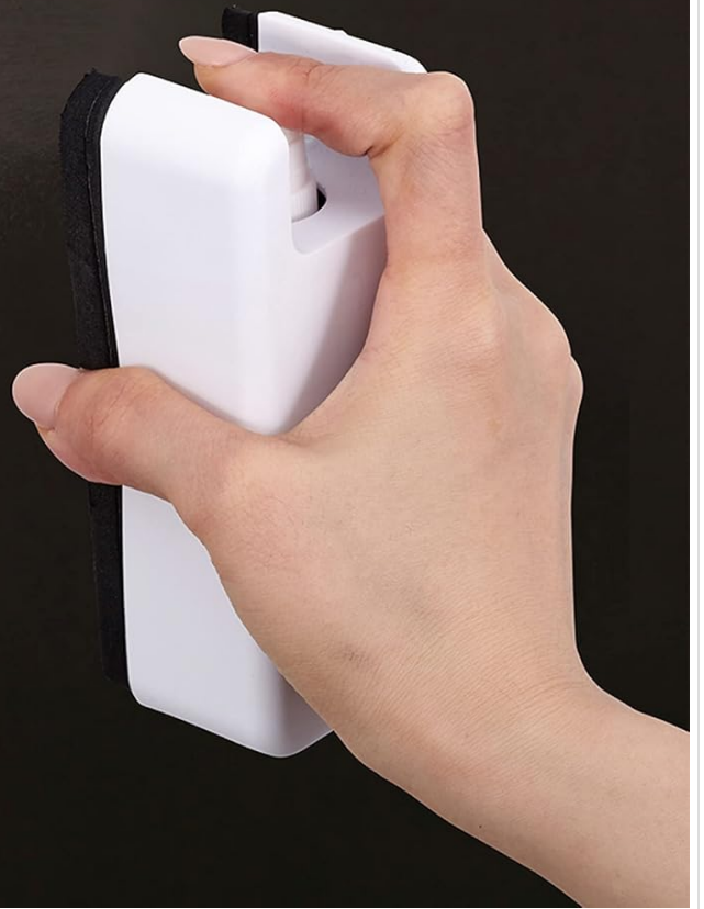
Figure 3: Applying the fine mist cleaner from the Asmix WCE01. This dedicated cleaner helps remove stubborn dirt and ghosting from whiteboards.