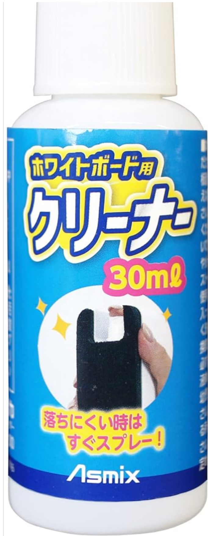
Figure 6: The Asmix WCE02 Cleaner Refill Bottle, available separately for continued use of your WCE01 eraser.