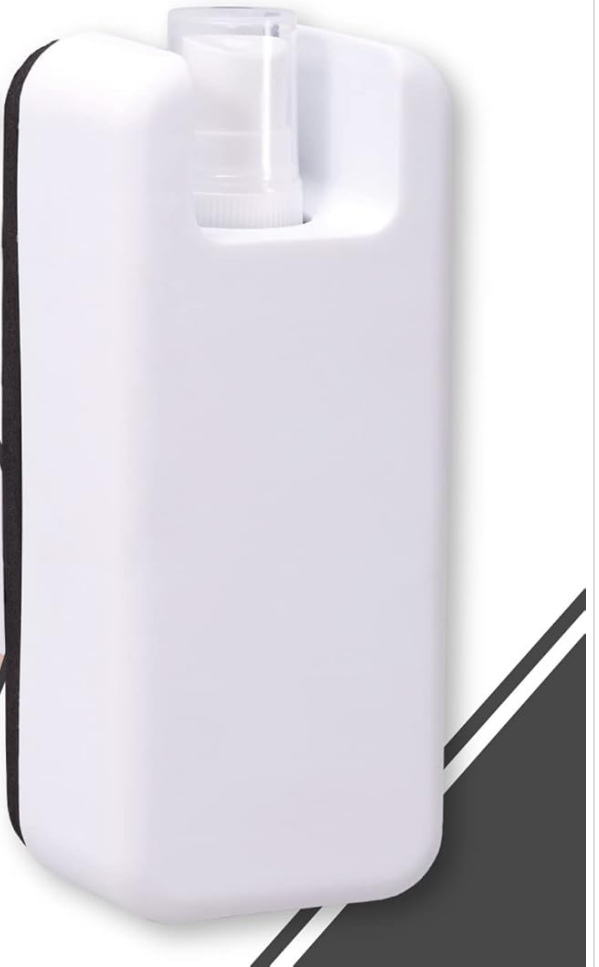
Figure 7: The Asmix WCE01 is designed to solve common whiteboard issues such as difficult-to-erase text and accumulated dirt.