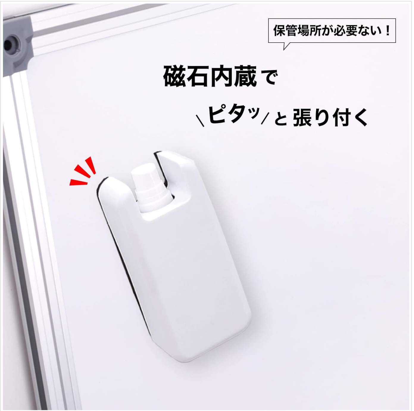
Figure 4: The Asmix WCE01 magnetically adheres to a whiteboard, providing convenient storage and easy access.