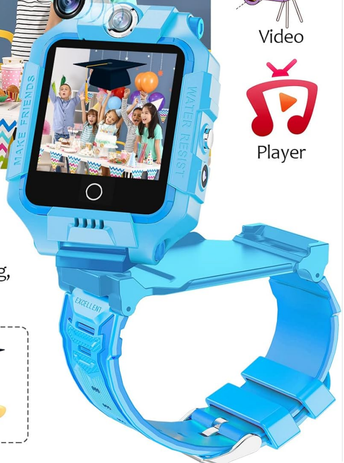
Image: The smartwatch showcasing its dual HD cameras and options for magic camera effects.