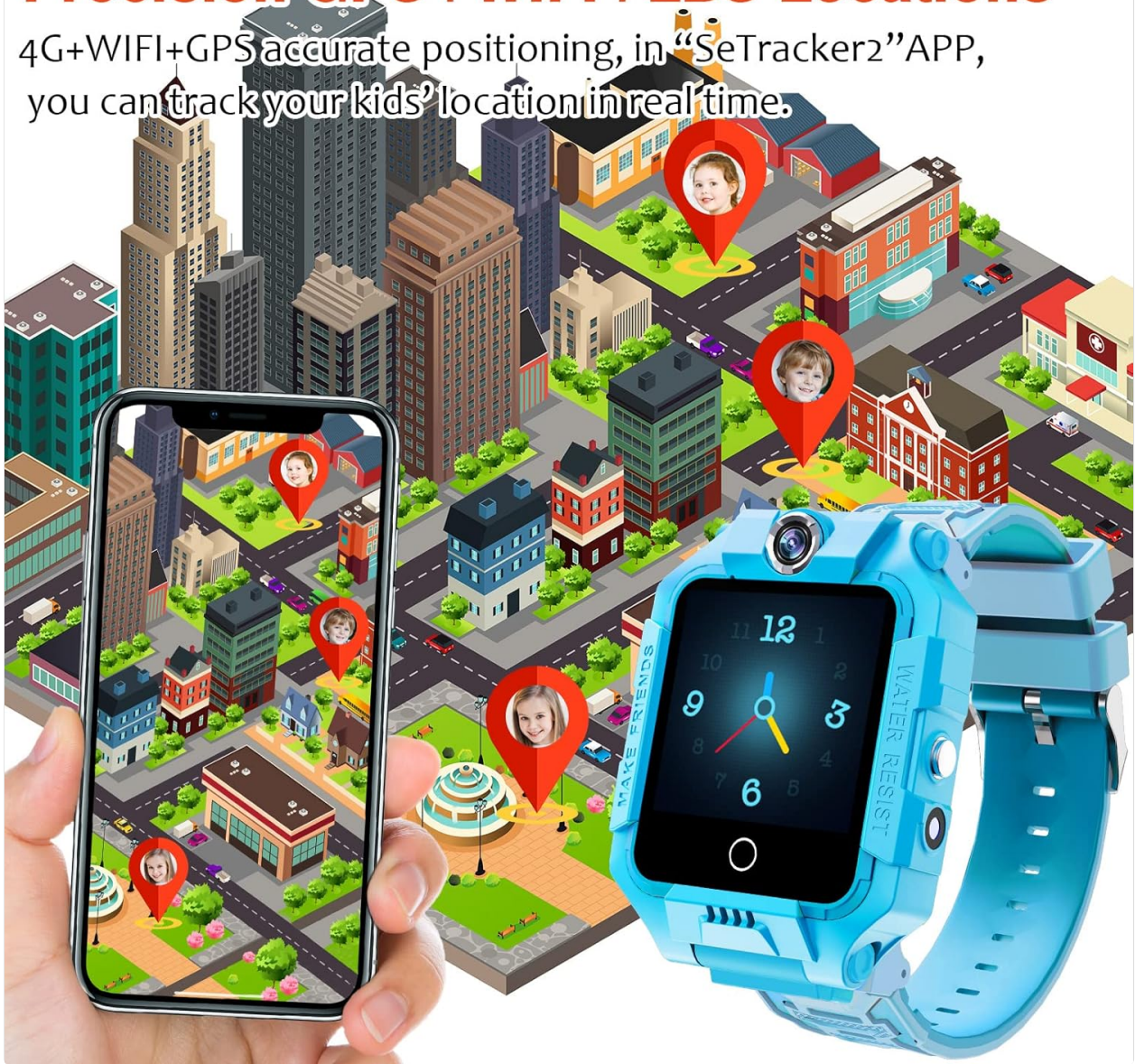
Image: The OKYUK 4G GPS Smartwatch with its charging cable and additional straps.

4G+WIFI+GPS accurate positioning, in “SeTracker2” APP, you can track your kids’ location in real time.