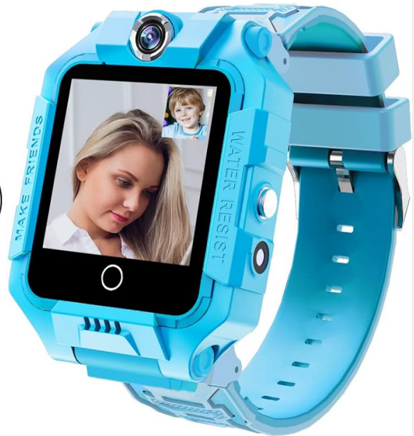
Image: Visual representation of two-way calls, voice chat, and video calls on the smartwatch and a connected smartphone.