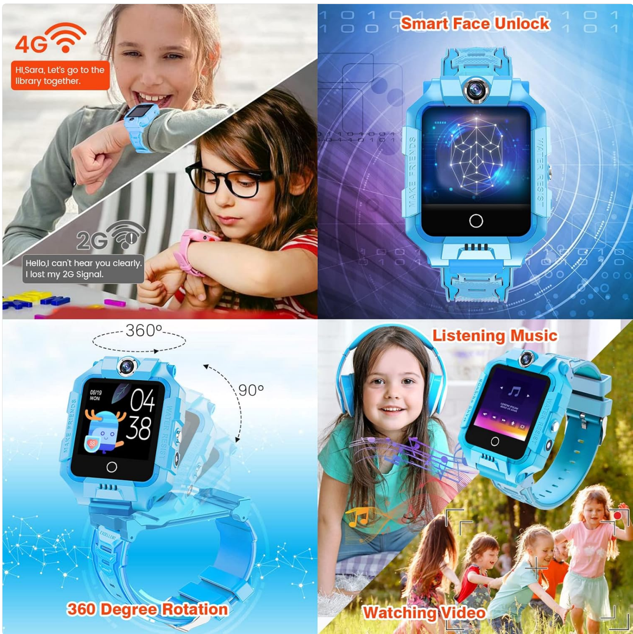
Image: Collage showing the smartwatch's face unlock, 360-degree rotating screen, music playback, and video viewing capabilities.