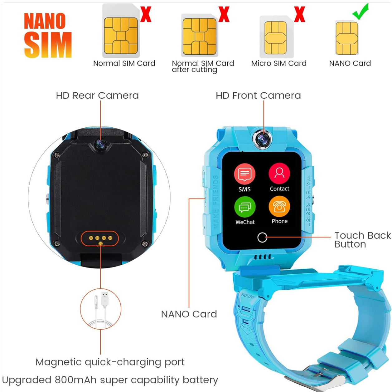
Image: Illustration of compatible Nano SIM card and the watch's rear view with the magnetic charging port.