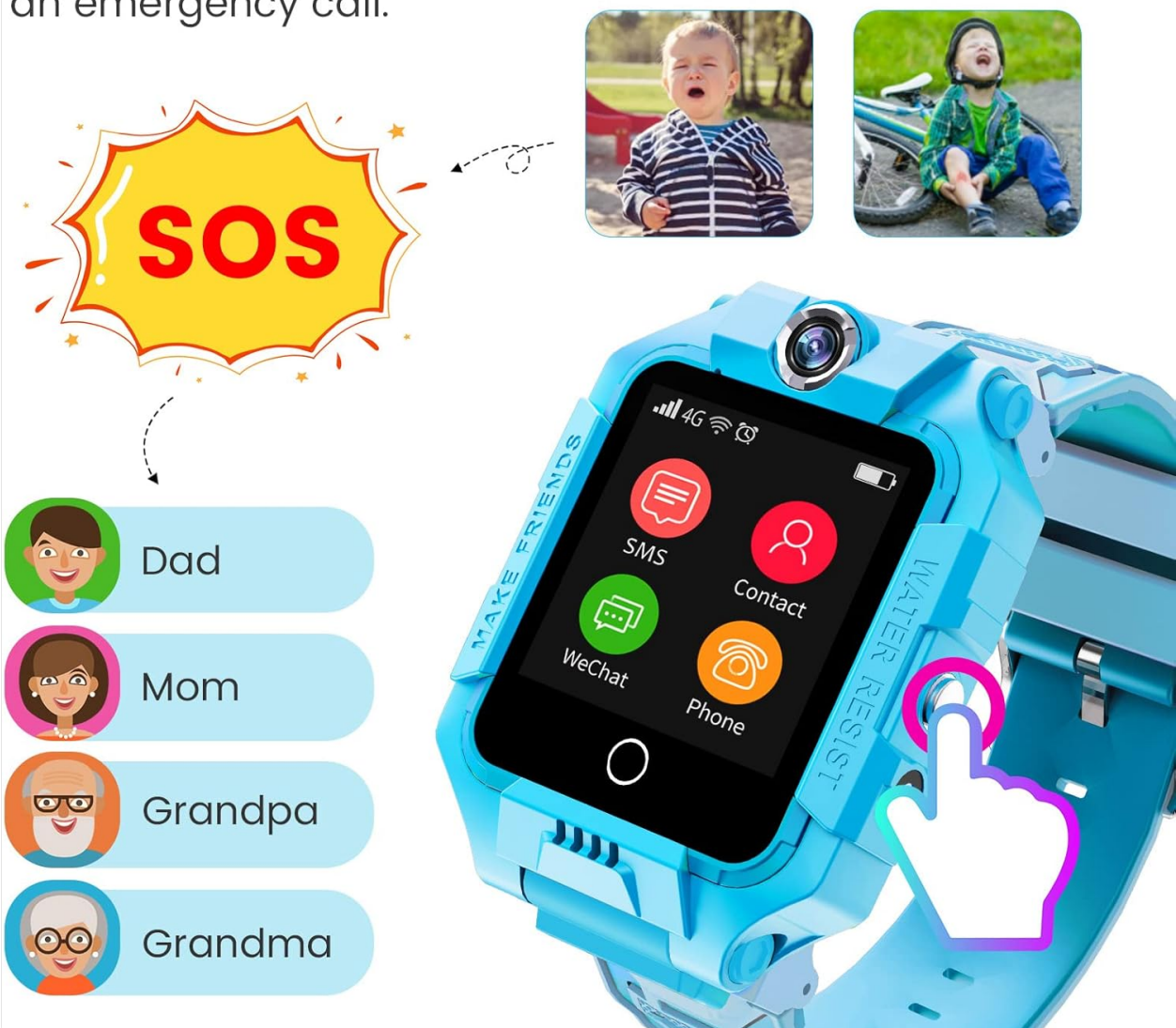
Image: The smartwatch interface highlighting the SOS function and a list of emergency contacts.

Long press the SOS button 3 seconds to make an emergency call.