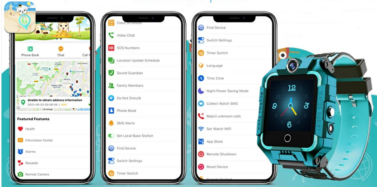
Image: Screenshots demonstrating the SeTracker2 app interface for managing the smartwatch.

Download "SeTracker2" to your phone through the app store or the QR code in the manual, and you can control your child's watch on the phone