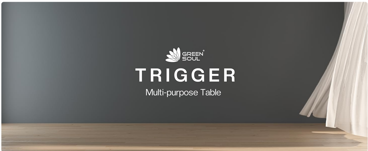
Image: The Green Soul Trigger Multi-Purpose Table, showcasing its sleek design and spacious carbon fiber textured desktop.

The Green Soul Trigger Height Adjustable Standing Desk is designed to provide an ergonomic and versatile workspace. This desk features motorized height adjustment, allowing seamless transitions between sitting and standing positions. It includes integrated accessories for convenience and is built with durable materials for long-lasting performance.