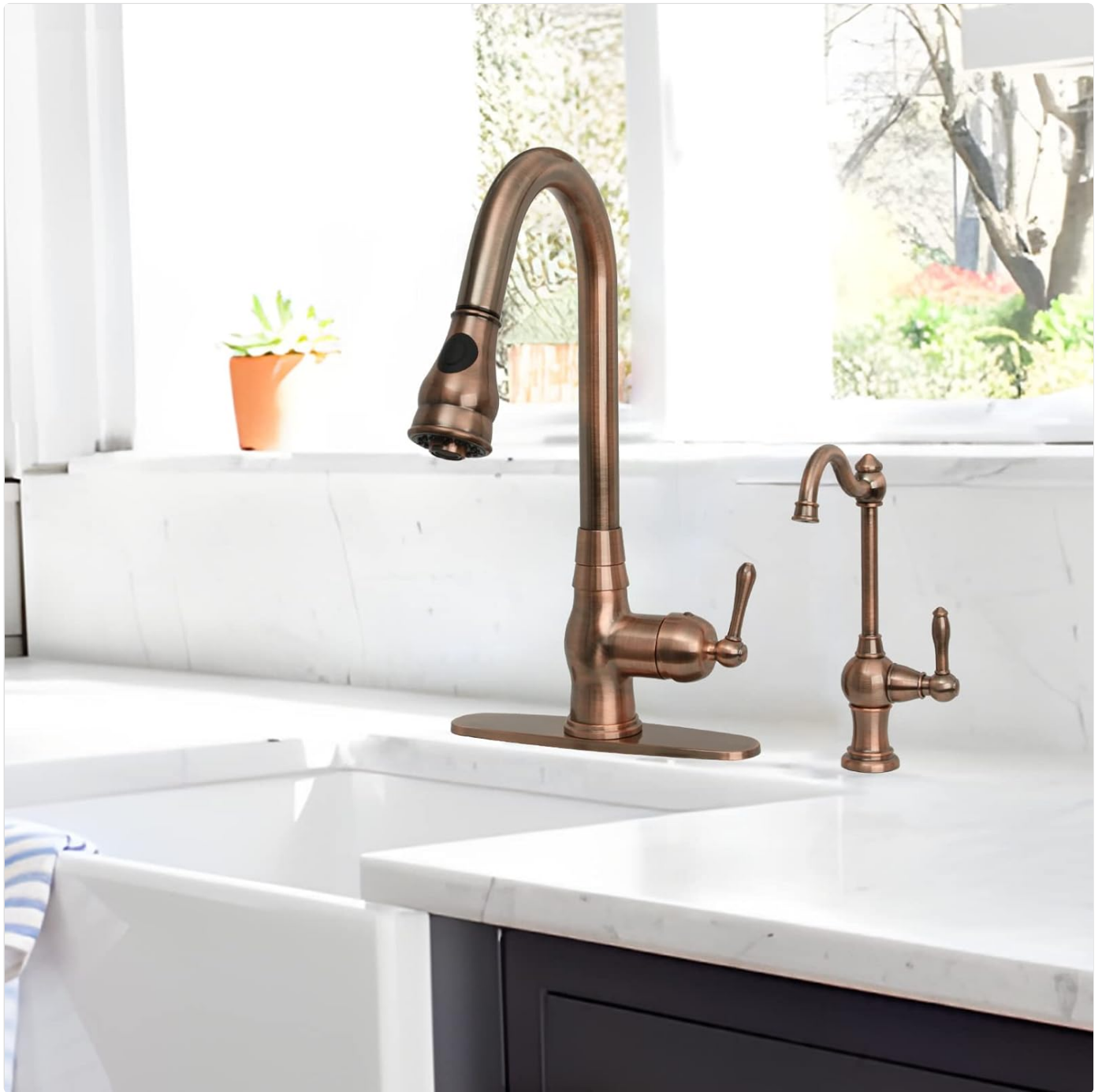
Image: Akicon One-Handle Drinking Water Filter Faucet in Antique Copper finish, shown on a kitchen countertop.