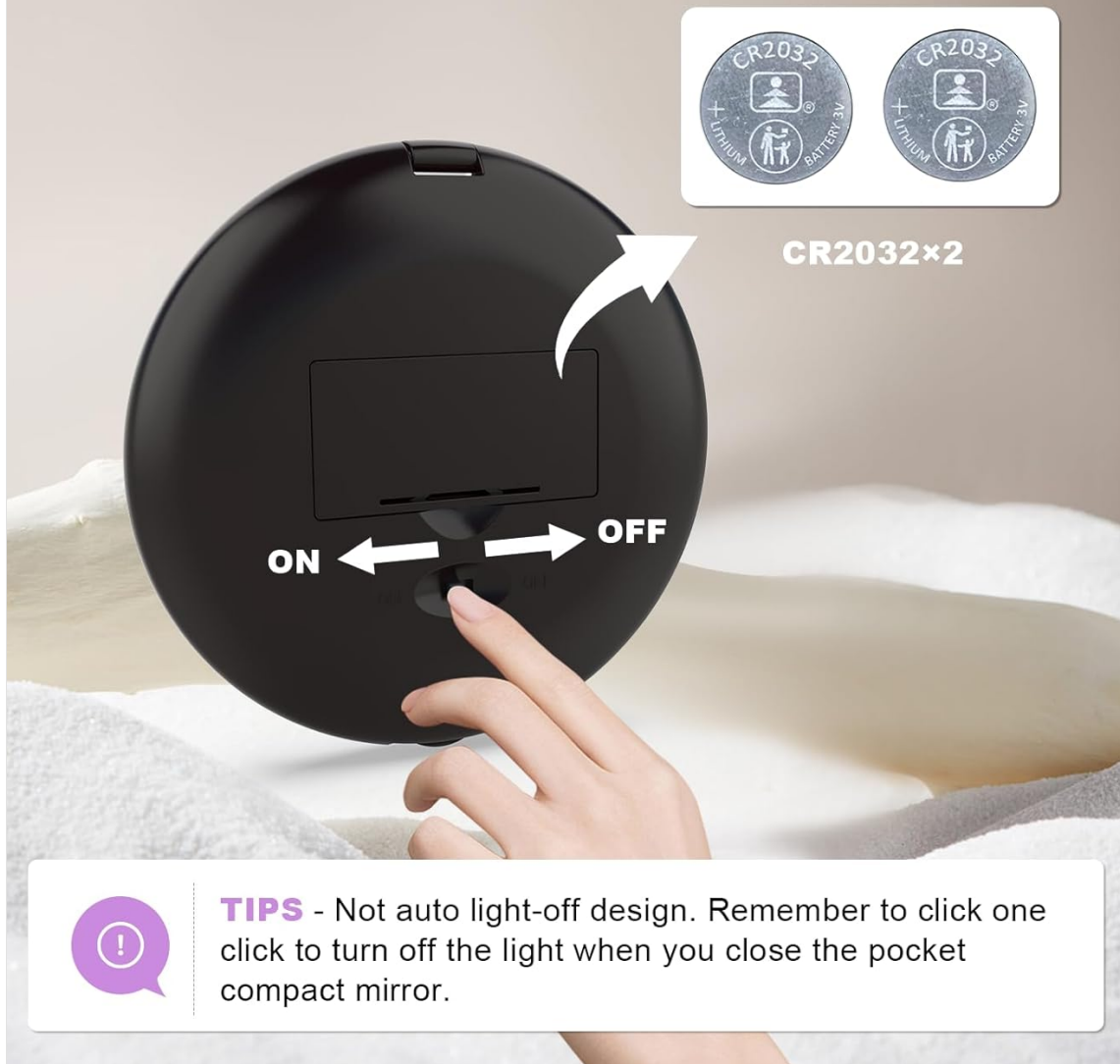
Image 6: The rear of the mirror, illustrating the location of the ON/OFF switch for the LED light.

Your browser does not support the video tag.