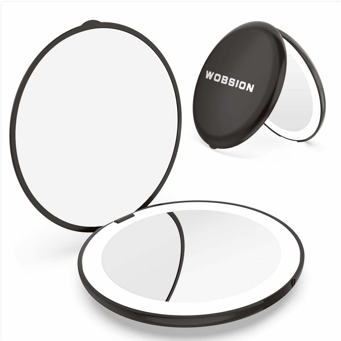
Image 1: The WOBSION Travel Compact Mirror in its closed, portable state.