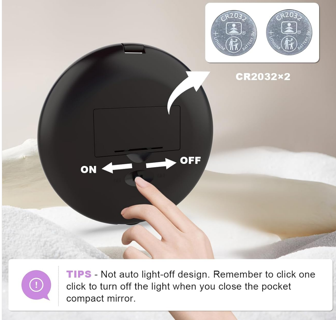
Image 3: The rear view of the mirror, highlighting the battery compartment for CR2032 batteries and the power switch.