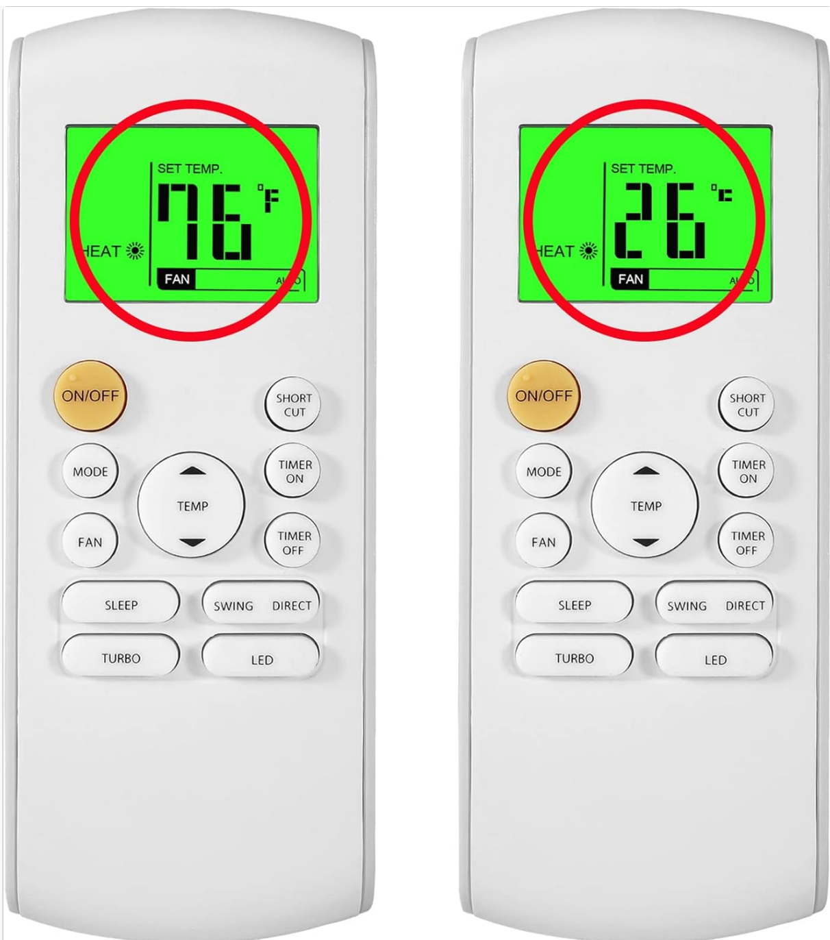
Image: Two remote controls side-by-side, one displaying 76°F and the other 26°C, demonstrating the temperature unit conversion.