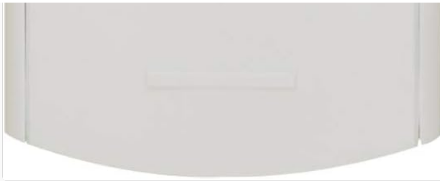
Image: Rear view of the remote control with the battery compartment closed after battery installation.