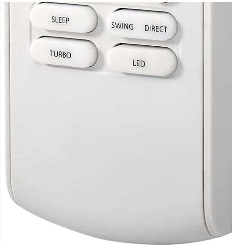
Image: Front view of the remote control, displaying all buttons and the LCD screen.