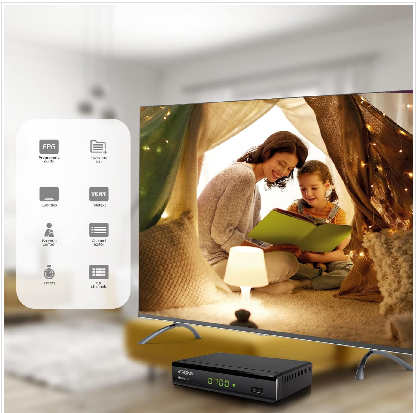
Figure 6.1: Visual representation of the Strong SRT 8119's features, including Electronic Program Guide (EPG), favorite lists, subtitles, teletext, parental control, channel editor, timers, and 700 channel capacity.