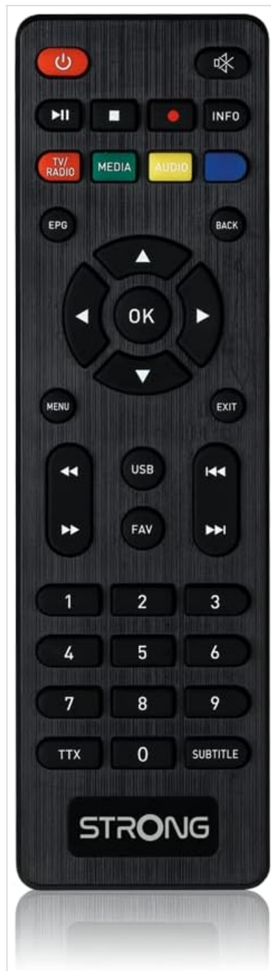
Figure 4.3: The remote control for the Strong SRT 8119 decoder, showing various buttons for power, channel navigation, volume, menu access, EPG, media playback, and numeric input.

The remote control allows full operation of the decoder. Familiarize yourself with the button layout for easy navigation.