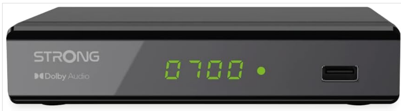
Figure 4.1: Front view of the Strong SRT 8119 decoder, featuring the display, Strong logo, Dolby Audio branding, and a USB port on the right.