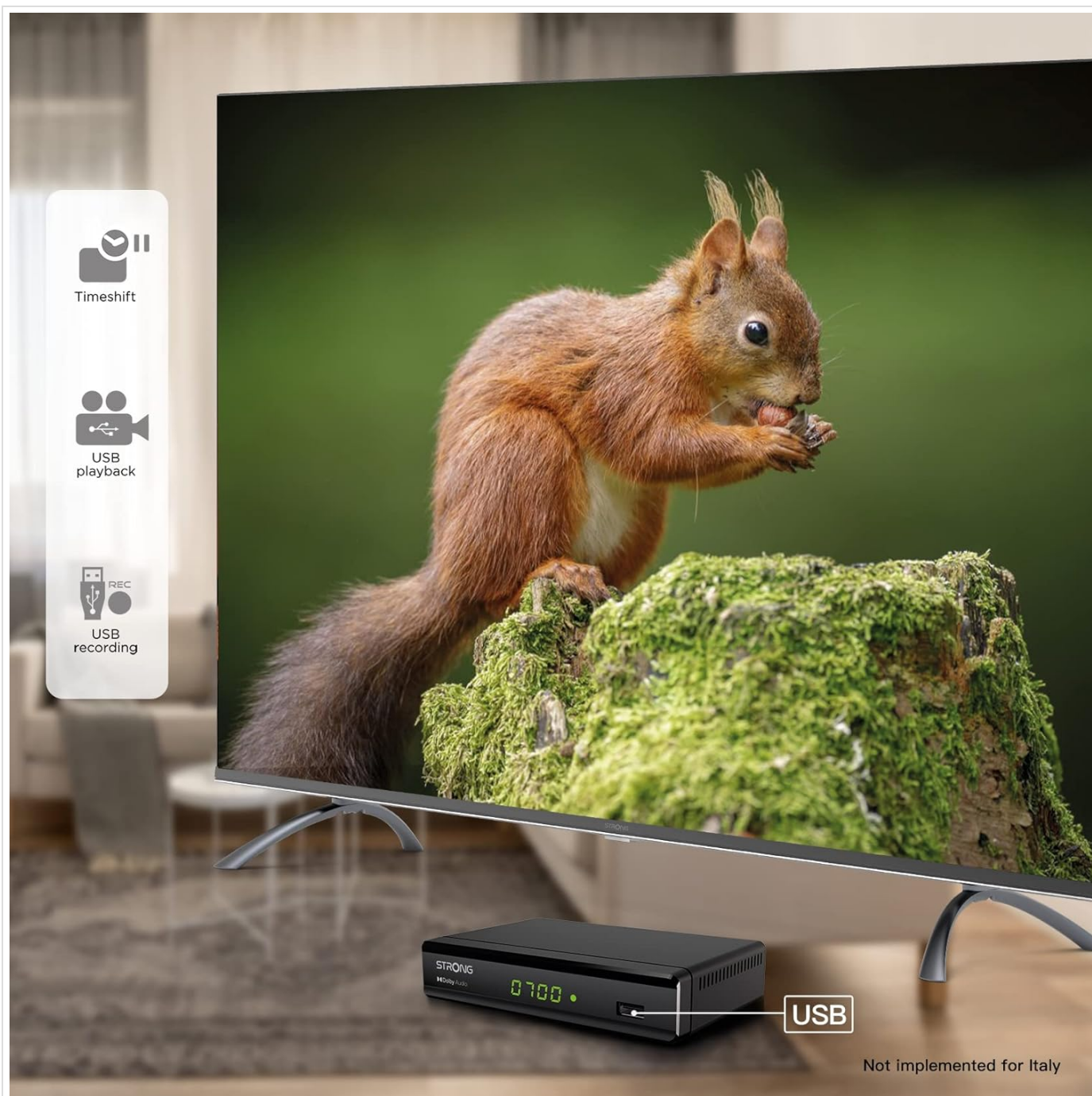
Figure 6.2: The Strong SRT 8119 decoder shown in a living room setting, highlighting its USB playback and recording capabilities. A note indicates that recording is not implemented for Italy.