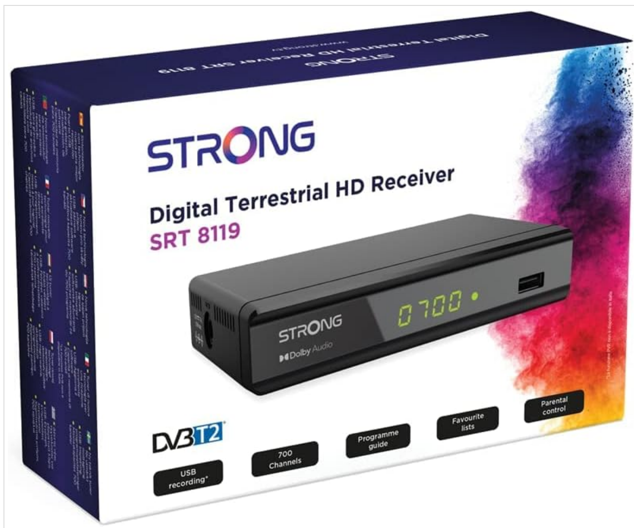
Figure 3.1: Packaging of the Strong SRT 8119 decoder, showing the product box with branding and key features listed.