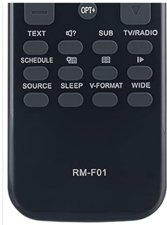
Image: Front view of the VINABTY RM-F01 remote control, displaying all control buttons.