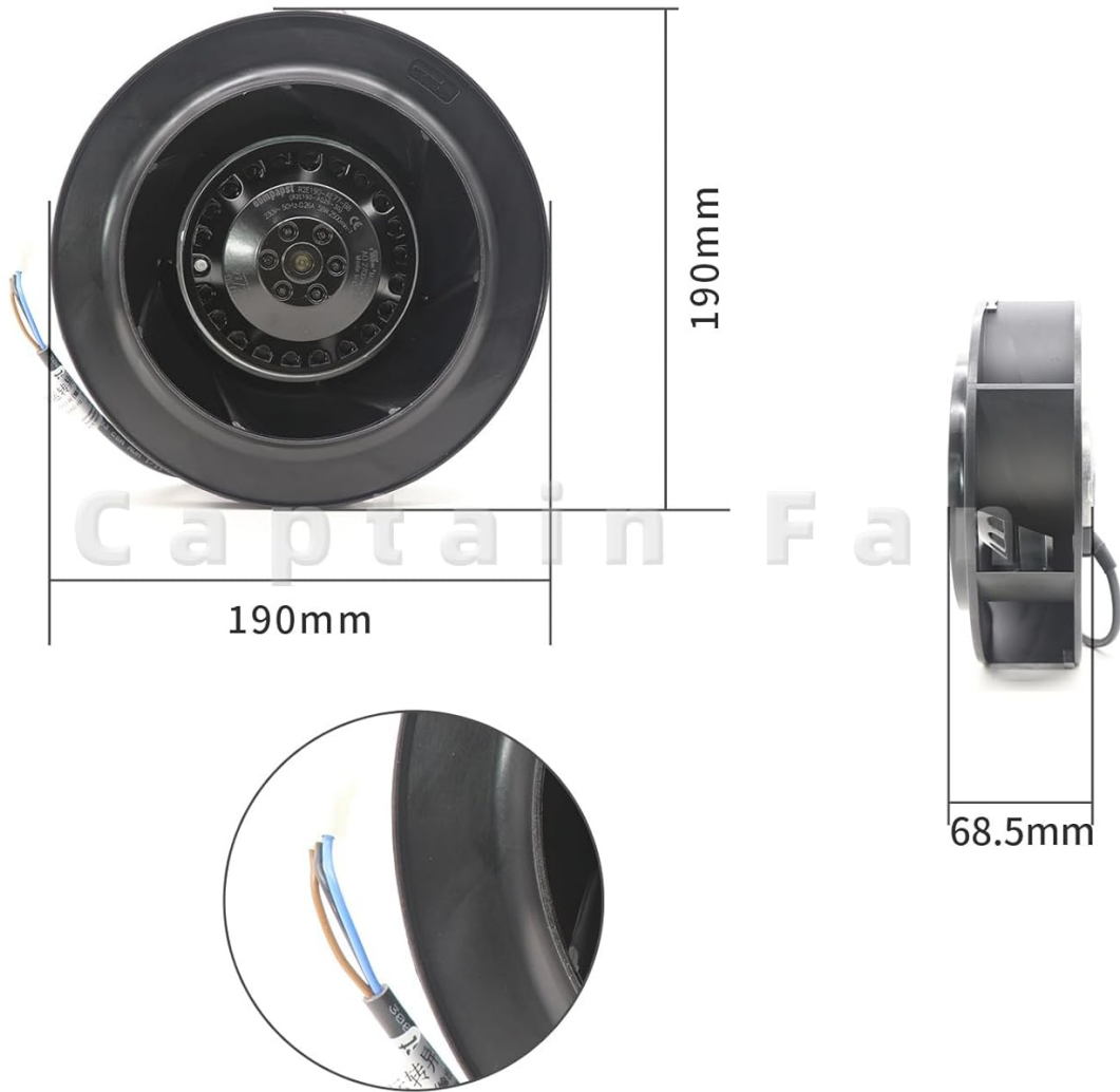
Figure 3.3: Dimensions of the R2E190-AO26-30 centrifugal fan, showing a diameter of 190mm and a depth of 68.5mm.