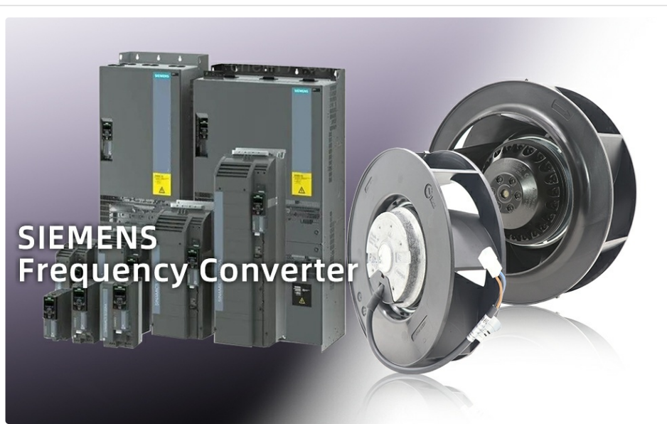
Figure 9.1: The R2E190-AO26-30 fan integrated with Siemens frequency converters, demonstrating its use in inverter-driven systems.