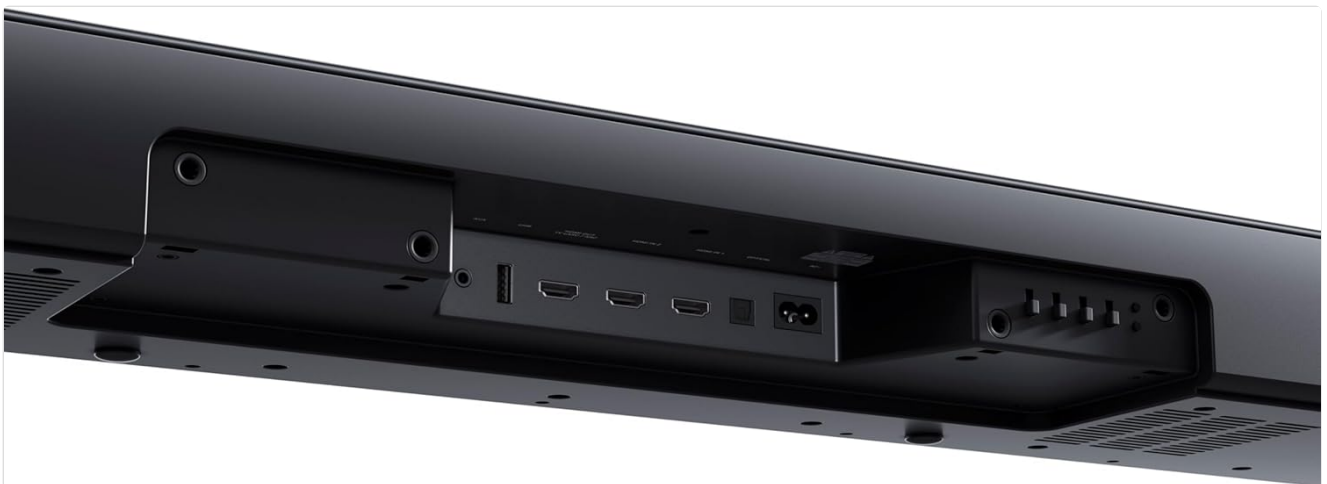
Image: Close-up of the rear panel of the soundbar, detailing the available connection ports.