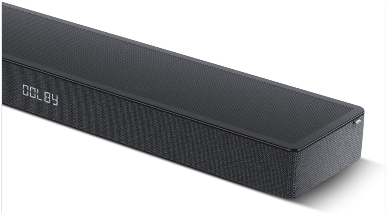
Image: The soundbar display showing "DOLBY", indicating active Dolby audio processing.