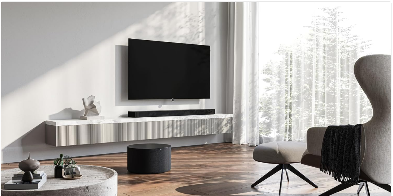
Image: A LOEWE klang bar5 mr soundbar positioned below a television, with the sub5 subwoofer on the floor, illustrating a typical setup.