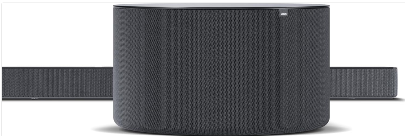
Image: The LOEWE klang bar5 mr soundbar and sub5 subwoofer, showcasing the complete set.