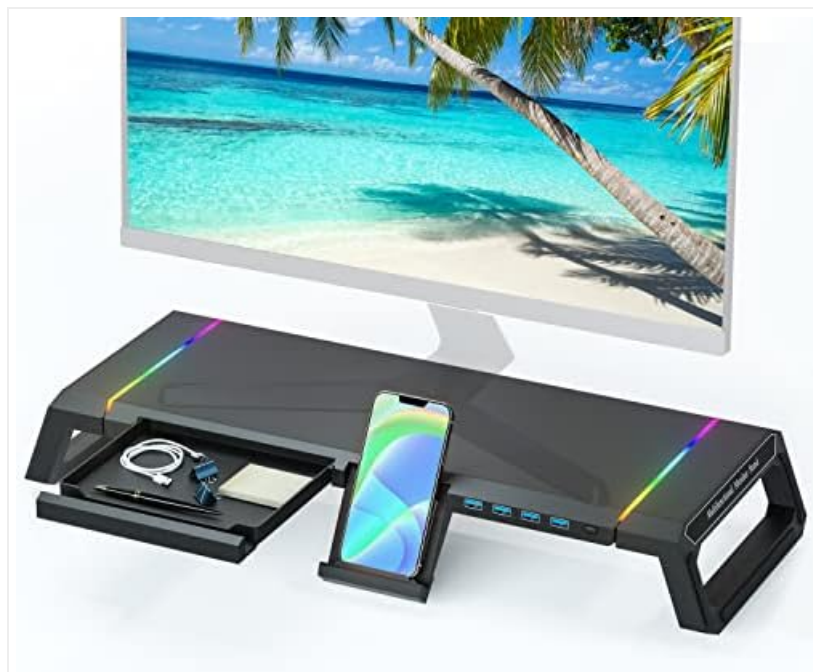
Image: The monitor stand showcasing its integrated phone stand and storage drawer.