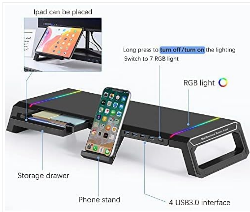
Image: A smartphone charging via one of the USB 3.0 ports on the monitor stand.