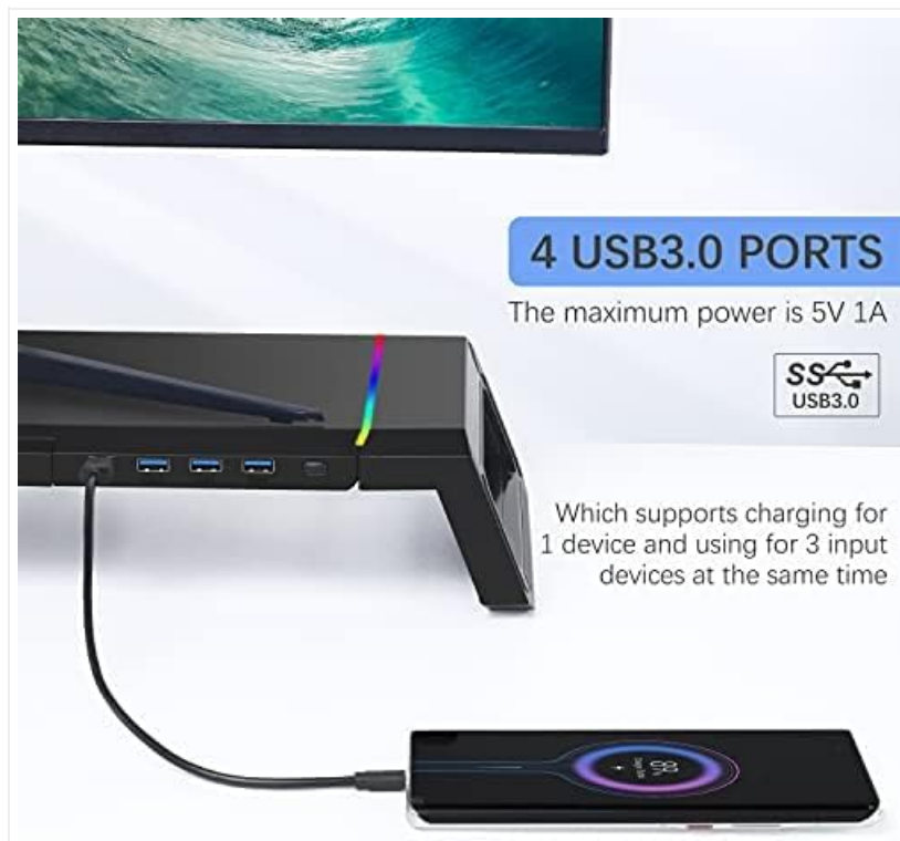
Image: Connecting the USB 3.0 cable to the monitor stand to enable the hub and lighting features.