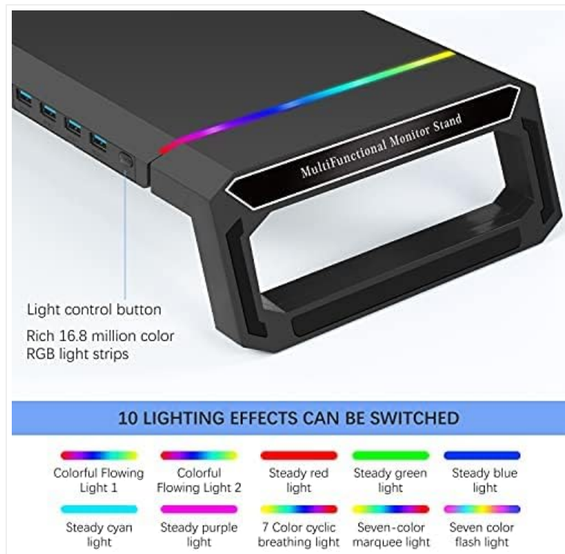
Image: The RGB lighting control button and examples of the 7 available lighting effects.