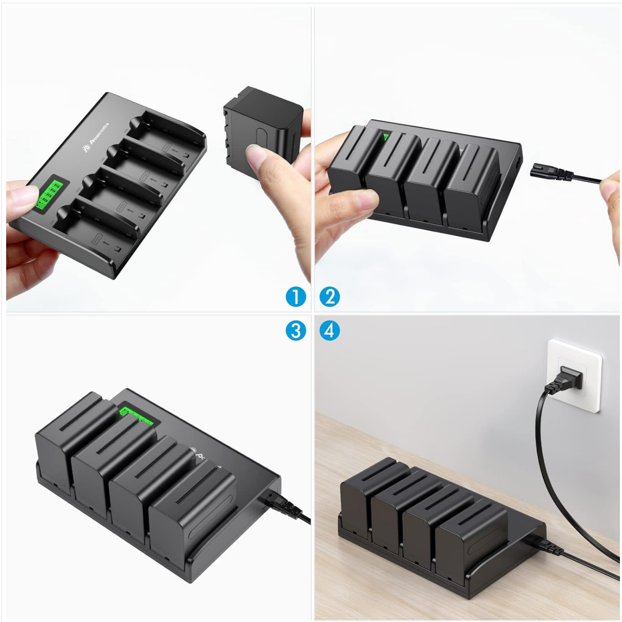
Image: Visual steps showing how to insert batteries and connect the charger to a power source.