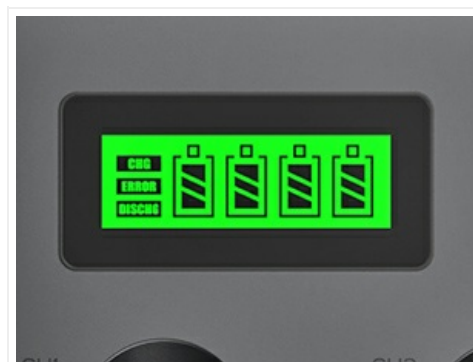
Image: An animated GIF demonstrating the real-time battery power display on the LCD screen.