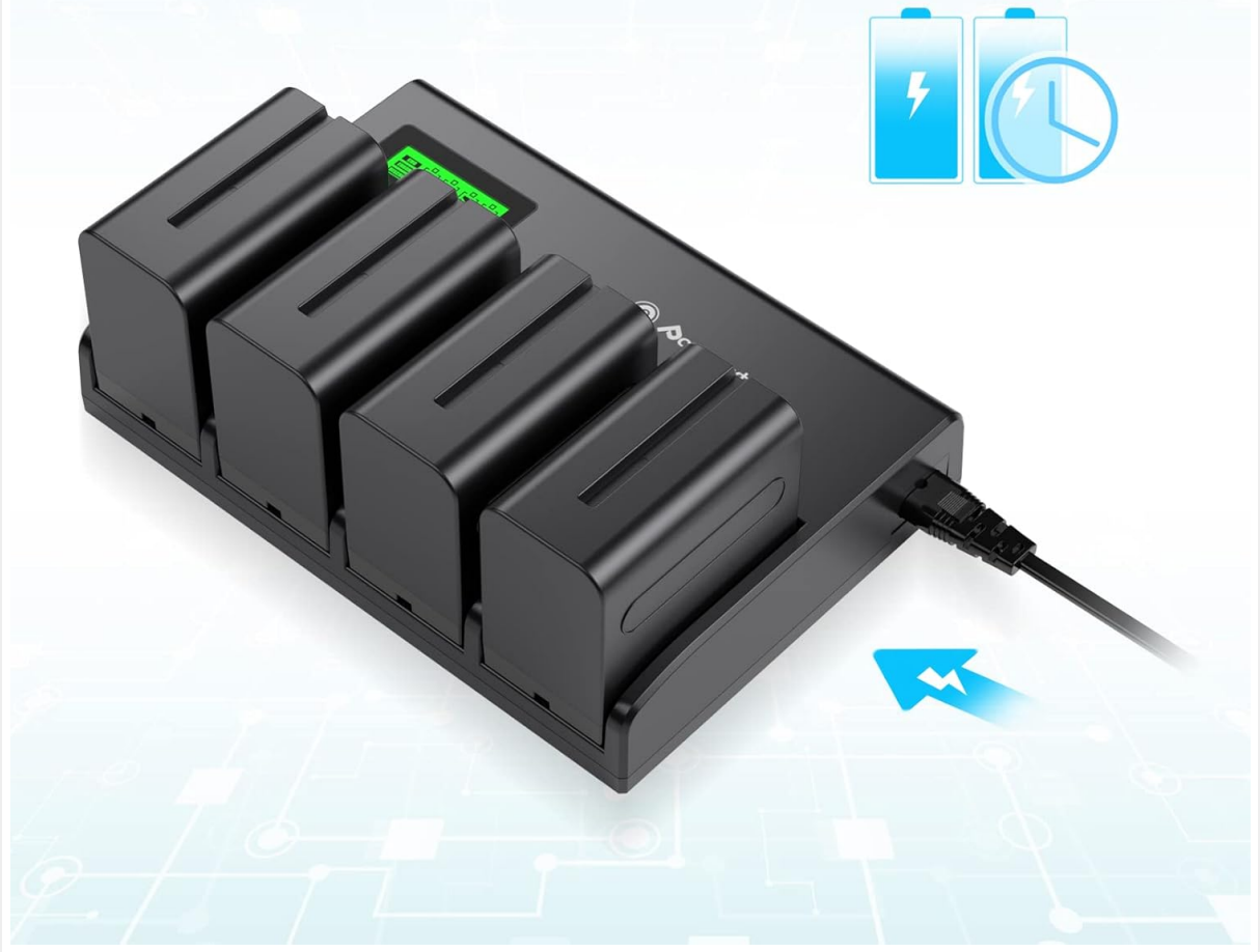
Image: The charger with four batteries inserted, highlighting its innovative design for simultaneous charging.

Allowing for charging 4 batteries at the same time