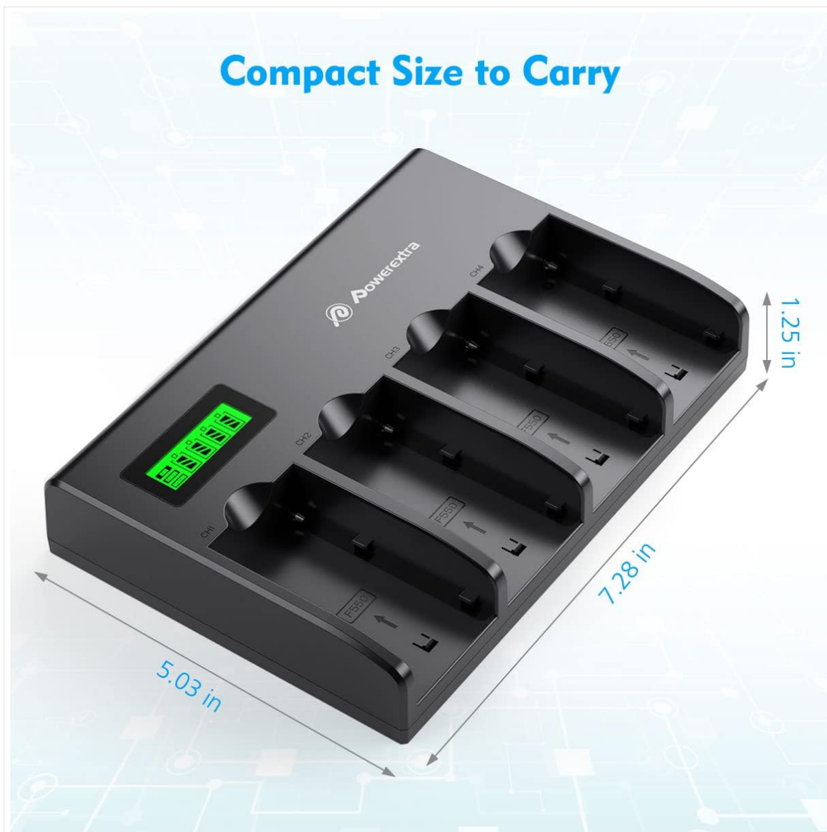
Image: The charger with its dimensions (5.03 in, 7.28 in, 1.25 in) highlighted, showing its compact size.