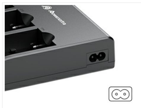
Image: Close-up of the charger's power input port.