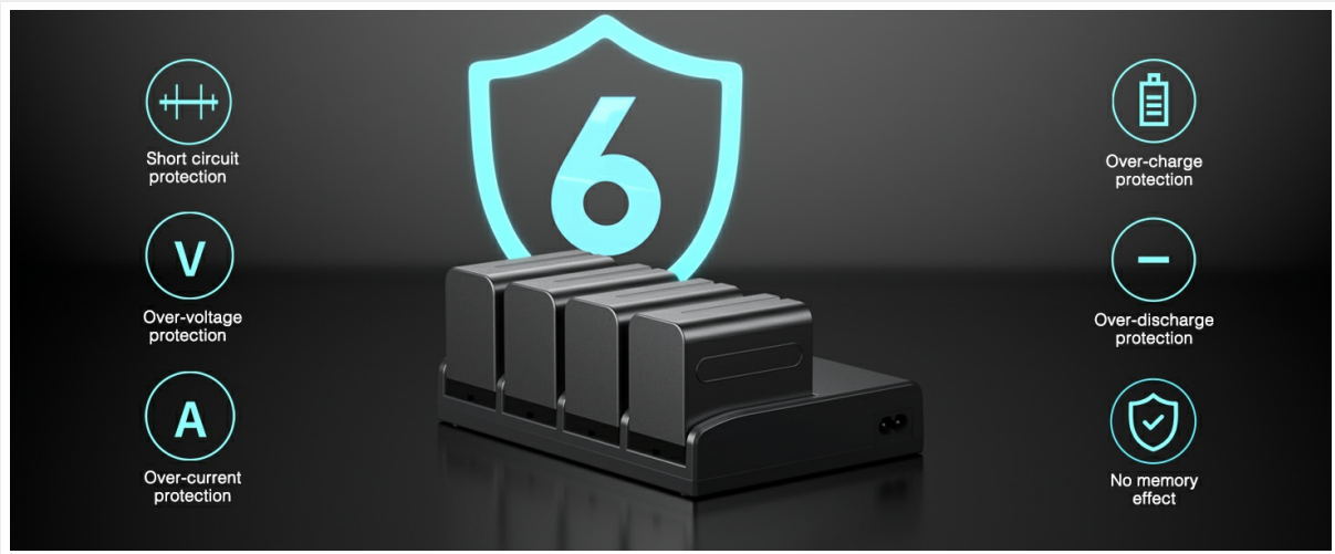
Image: Visual representation of the charger's six protection features: short circuit, over-charge, over-voltage, over-discharge, over-current, and no memory effect.