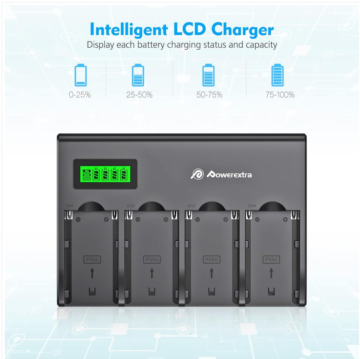
Image: The charger's LCD screen displaying the charge status of four batteries.