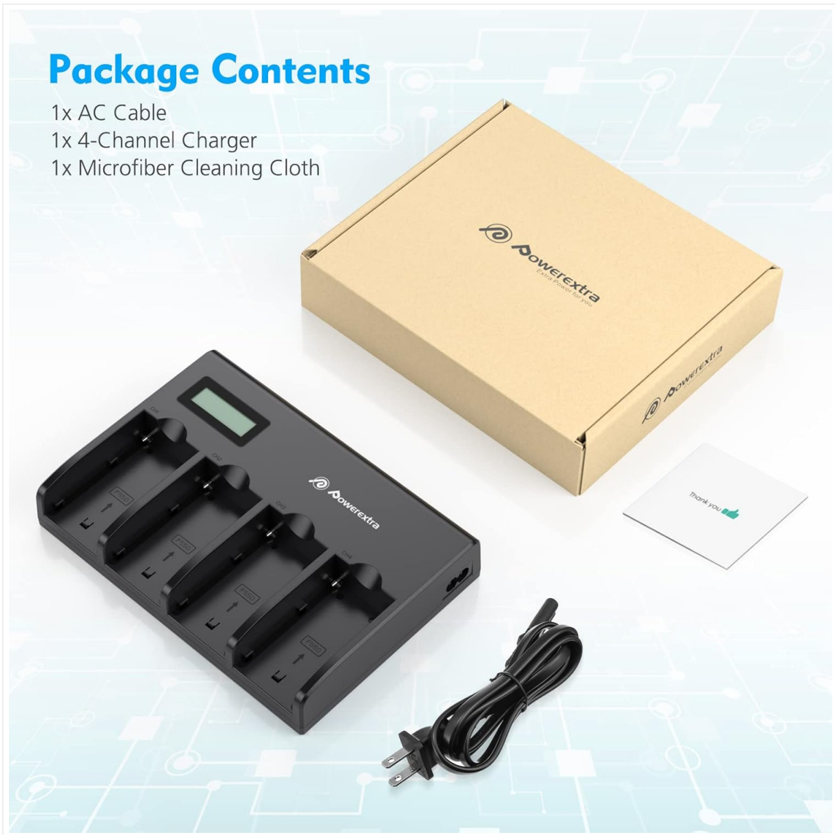
Image: The charger, AC cable, and cleaning cloth neatly arranged next to the product box.