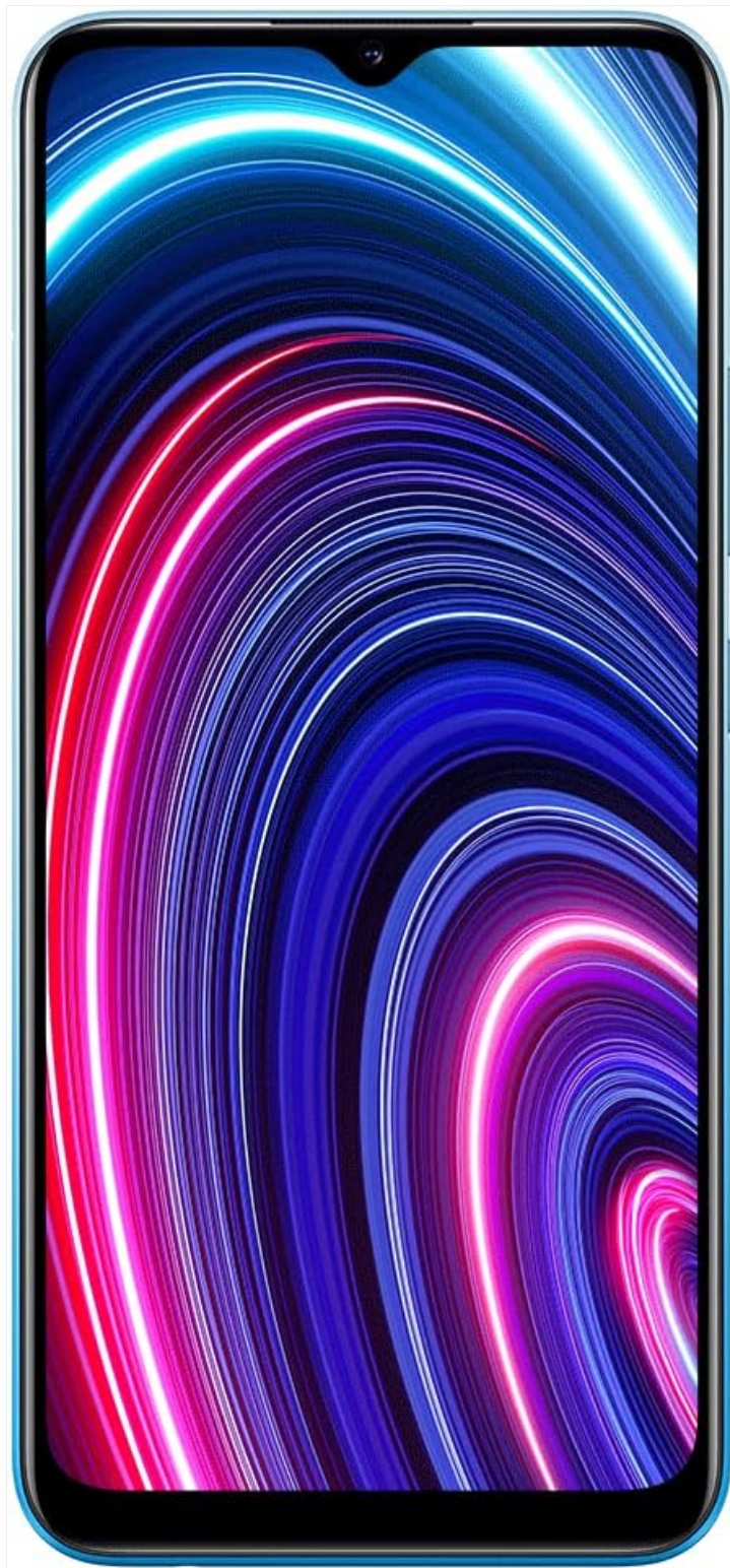
Image 1.1: Front view of the realme C25Y smartphone, showcasing its 6.5-inch display with a vibrant wallpaper.