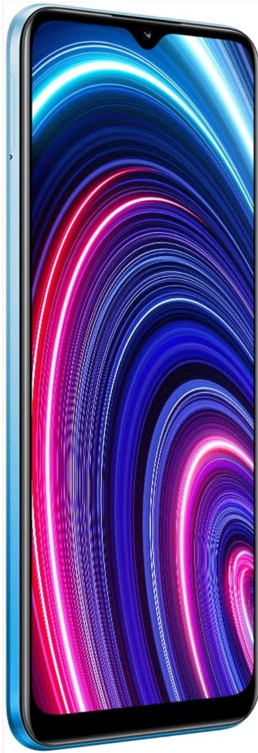
Image 3.1: Side view of the realme C25Y, highlighting the power button and volume rocker.