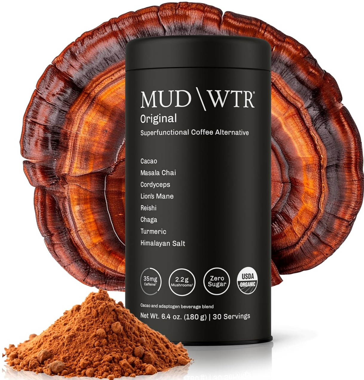
Image: MUD\WTR Original product packaging, showcasing the black canister, a pile of the mushroom coffee alternative powder, and a large mushroom slice in the background. This image represents the core product.