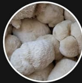
Lion's Mane Focus