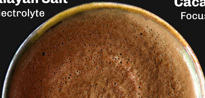
Image: A visual representation of the high-end ingredients used in MUD\WTR Original, detailing each component and its primary benefit for focus and natural energy.