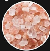
Himalayan Salt Electrolyte