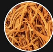
Cordyceps Natural energy