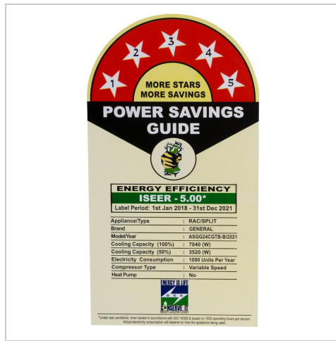
Image 7.1: Energy Savings Guide for the AC, indicating 5-star rating and energy consumption.