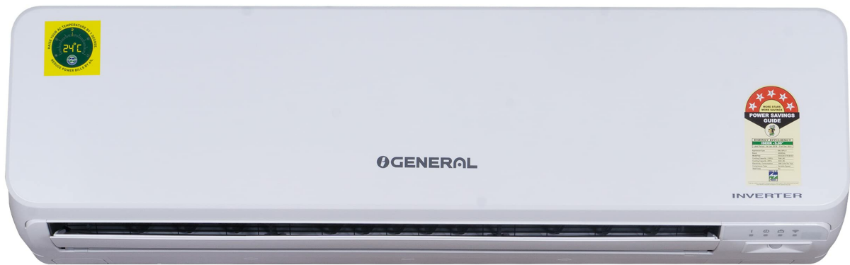
Image 1.1: Front view of the O General 2 Ton 5 Star Inverter Split AC indoor unit.