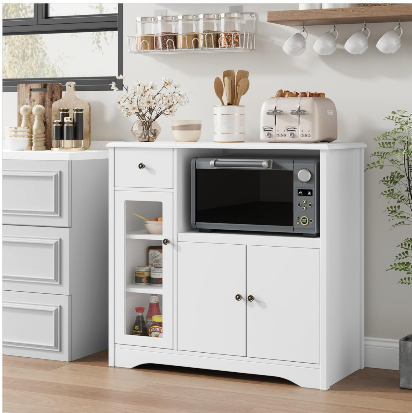
Figure 5.1: Cabinet in Kitchen Setting

This image demonstrates the cabinet's functionality within a kitchen, serving as a microwave stand and providing additional storage.