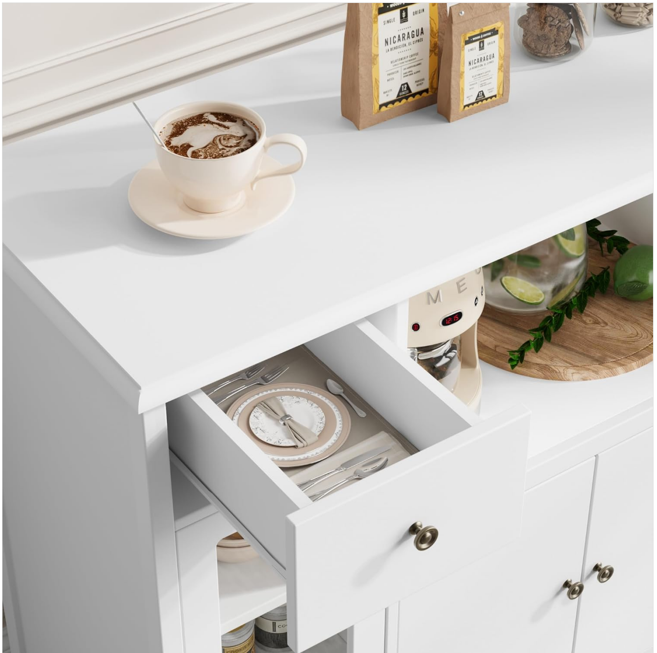
Figure 5.3: Drawer Storage

A close-up of the drawer, illustrating its capacity for storing small items like cutlery or kitchen tools.