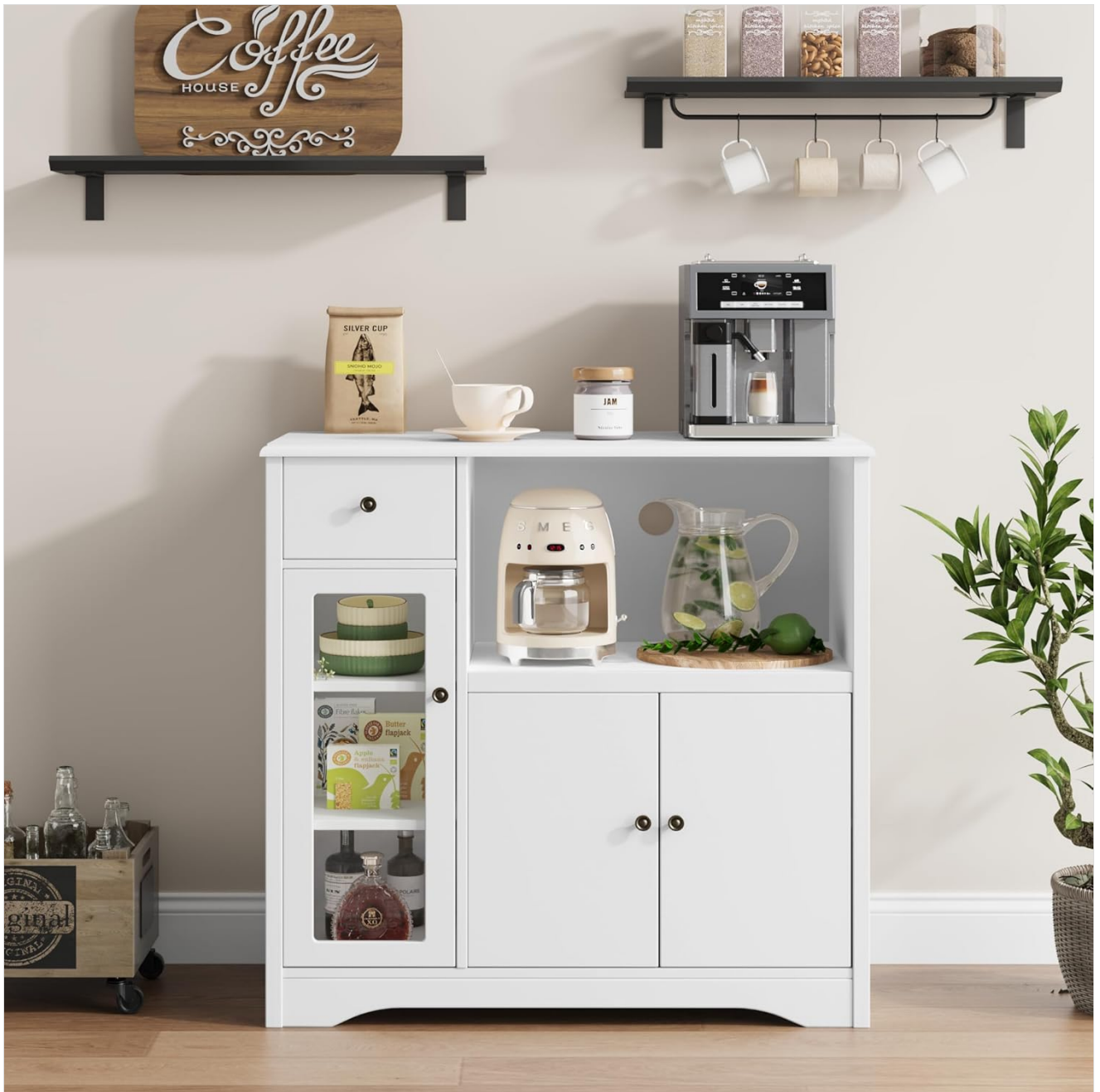
Figure 5.2: Cabinet as a Coffee Bar

The cabinet can also be utilized as a dedicated coffee bar, providing space for a coffee machine, mugs, and related accessories.