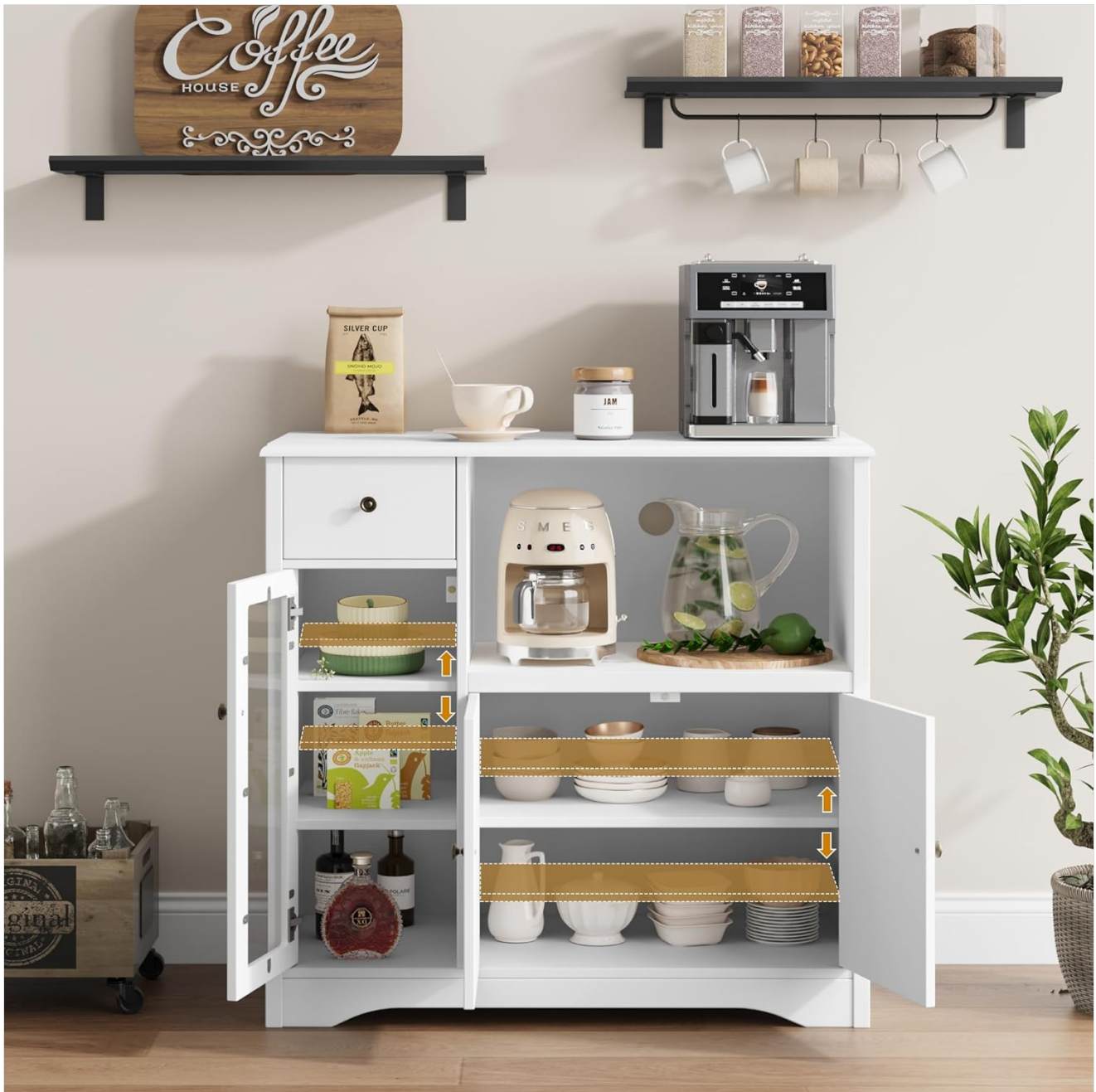
Figure 5.4: Adjustable Shelves

This image visually demonstrates the adjustable nature of the interior shelves, allowing for customized storage configurations.