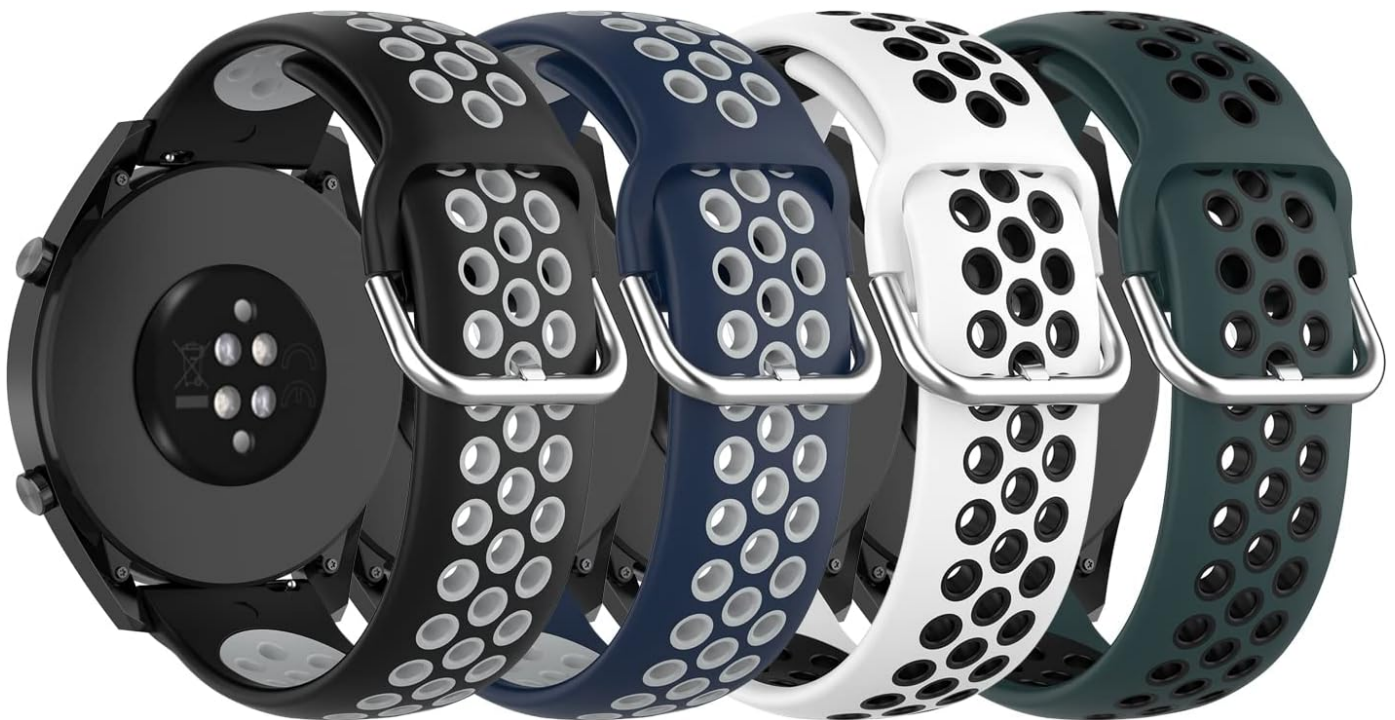
Image: A collection of E ECSEM silicone watch bands in different colors (black, blue, white, green) attached to a smartwatch, illustrating the product's aesthetic and variety.

These E ECSEM replacement watch straps are designed for compatibility with various SENBONO smartwatch models, including S09, S09 Plus, S80, S82, S30, and Z08S. Crafted from high-performance silicone, these bands offer a comfortable, breathable, and lightweight wearing experience. They feature a quick-fit design for easy installation and removal, and are available in multiple colors to suit individual preferences.