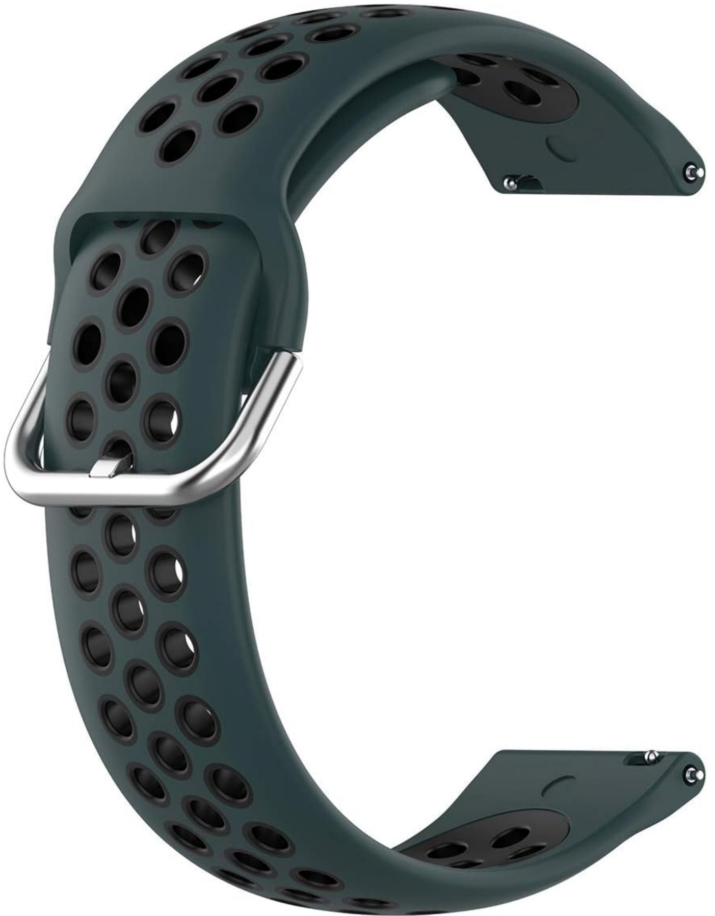
Image: A detailed view of the quick-release pin on the watch band, highlighting the mechanism used for installation and removal.