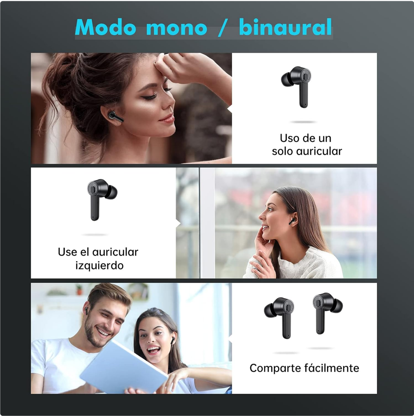
Image: A collage showing different usage scenarios: a person using a single earbud, a person using the left earbud, and two people sharing the earbuds while looking at a tablet.

The earbuds support both mono and binaural modes, allowing you to use one earbud independently or both together for a stereo experience.