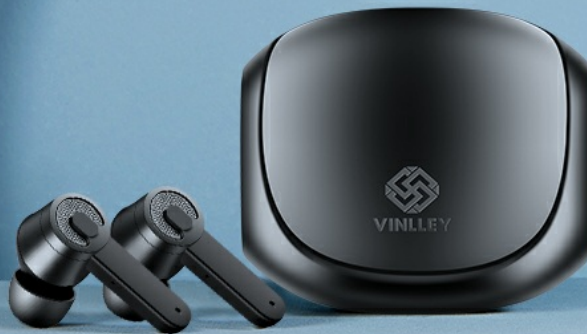
Image: An overview of the ES06 True Wireless Earbuds features, including one-step connection, IPX7 waterproof, Hi-Fi sound, volume control, 42 hours playtime, and Bluetooth 5.1.