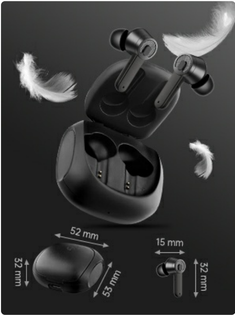
Image: Diagram showing the dimensions of the earbuds and the charging case in millimeters.