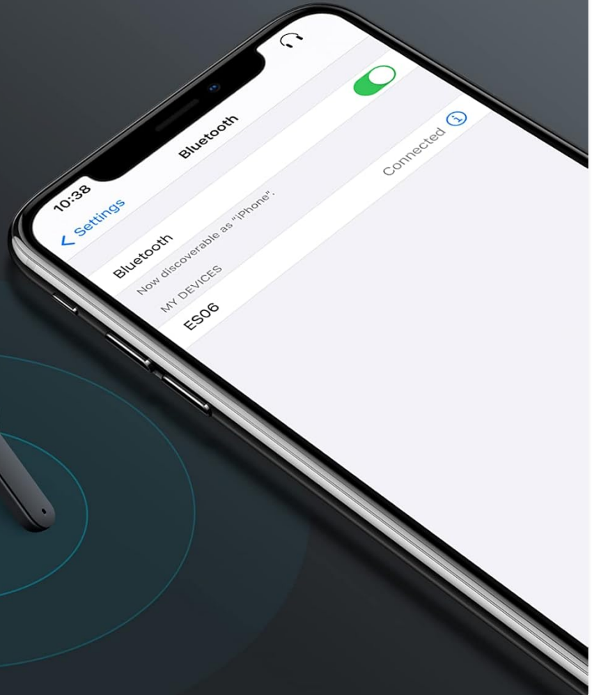
Image: A smartphone screen showing Bluetooth settings with the earbuds listed as 'ES06' and connected, illustrating direct connection, strong signal, and no latency.