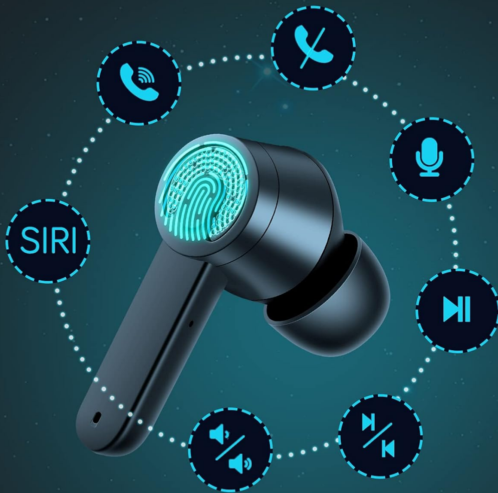
Image: Diagram illustrating the smart touch controls for music, calls, volume, and voice assistant (Siri).

Fácil control de música, volumen y teléfono, etc.