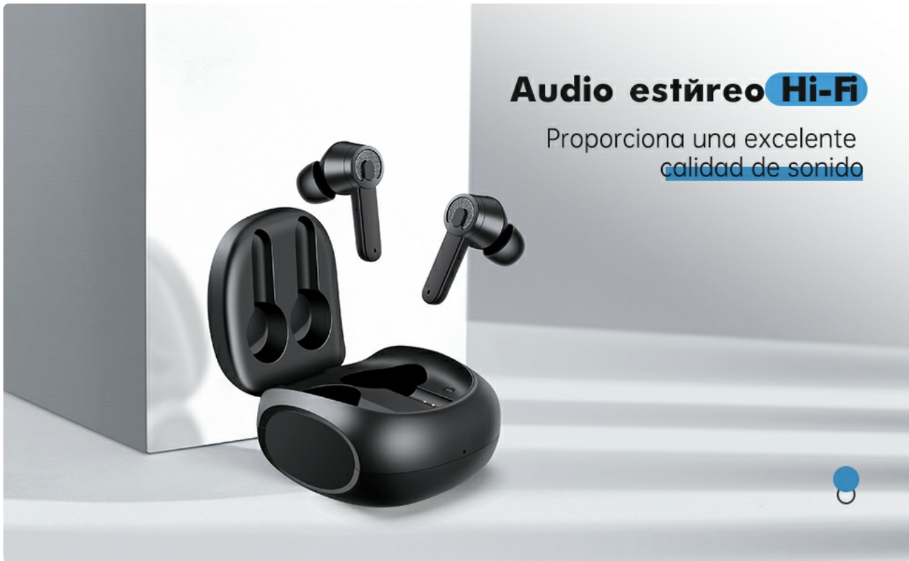
Image: An illustration highlighting the stereo Hi-Fi audio capability, providing excellent sound quality.