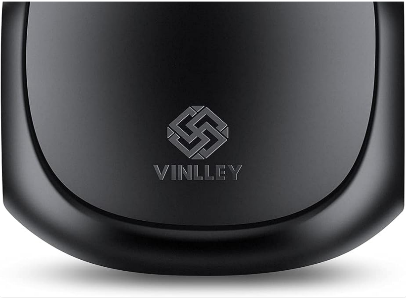
Image: The Vinley Wireless Earbuds, showing both earbuds and their compact charging case.