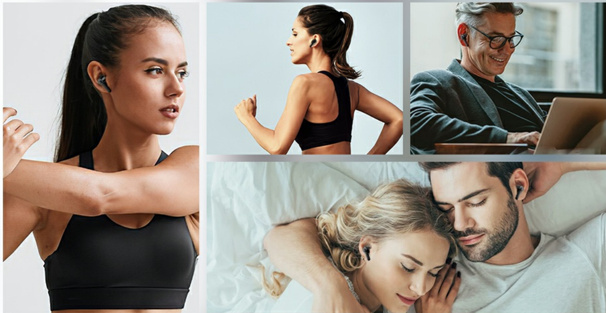
Image: A collage of people using the earbuds in various lifestyle settings, including exercising, working, and relaxing.