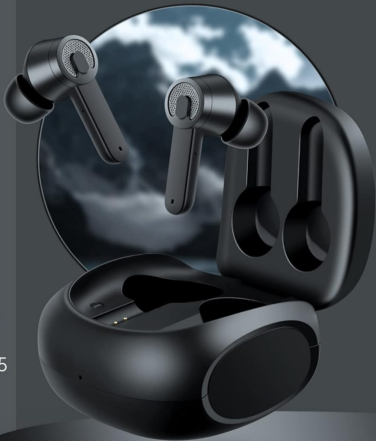
Image: Visual representation of 7 hours single charge and 35 hours from the charging case, totaling 42 hours of playtime.