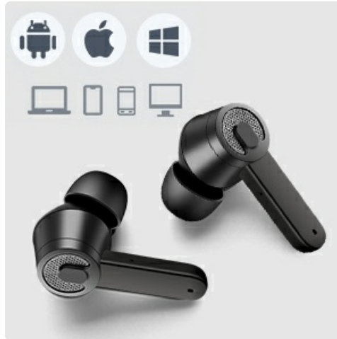
Image: Icons representing compatibility with Android, Apple, and Windows devices, including laptops, smartphones, and desktops.