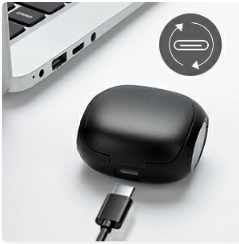
Image: The charging case connected via a USB-C cable to a laptop, indicating the charging port.