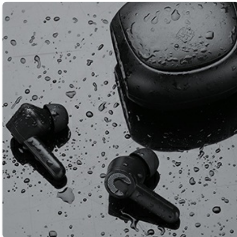
Image: The earbuds and charging case covered in water droplets, illustrating their IPX7 water resistance.