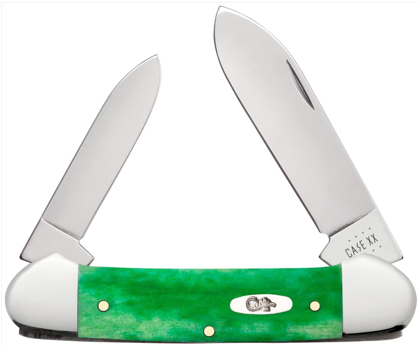
Figure 1: The Case XX 52826 Canoe knife with both blades extended, highlighting its brilliant green smooth bone handle and polished stainless steel blades.

This manual provides comprehensive instructions for the safe and effective use, maintenance, and care of your Case XX 52826 Brilliant Green Smooth Bone Handle 2 Blade Canoe folding knife. Crafted with precision and designed for durability, this knife is suitable for various outdoor activities including hunting, camping, and general utility tasks. Please read this manual thoroughly before using your knife to ensure proper handling and longevity.