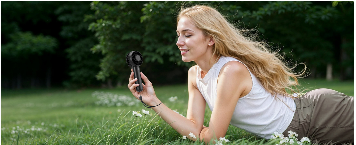
Figure 4: One-touch operation for power and speed control.