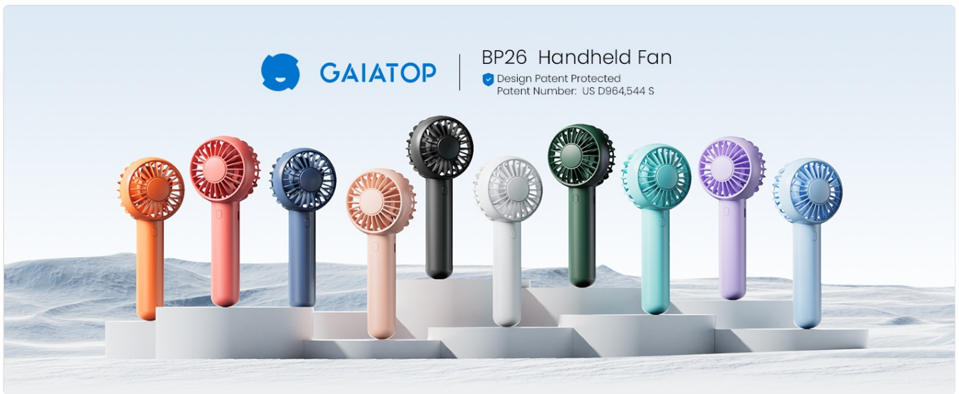
Figure 3: The Gaiatop BP26 fan with its base and lanyard for versatile use.