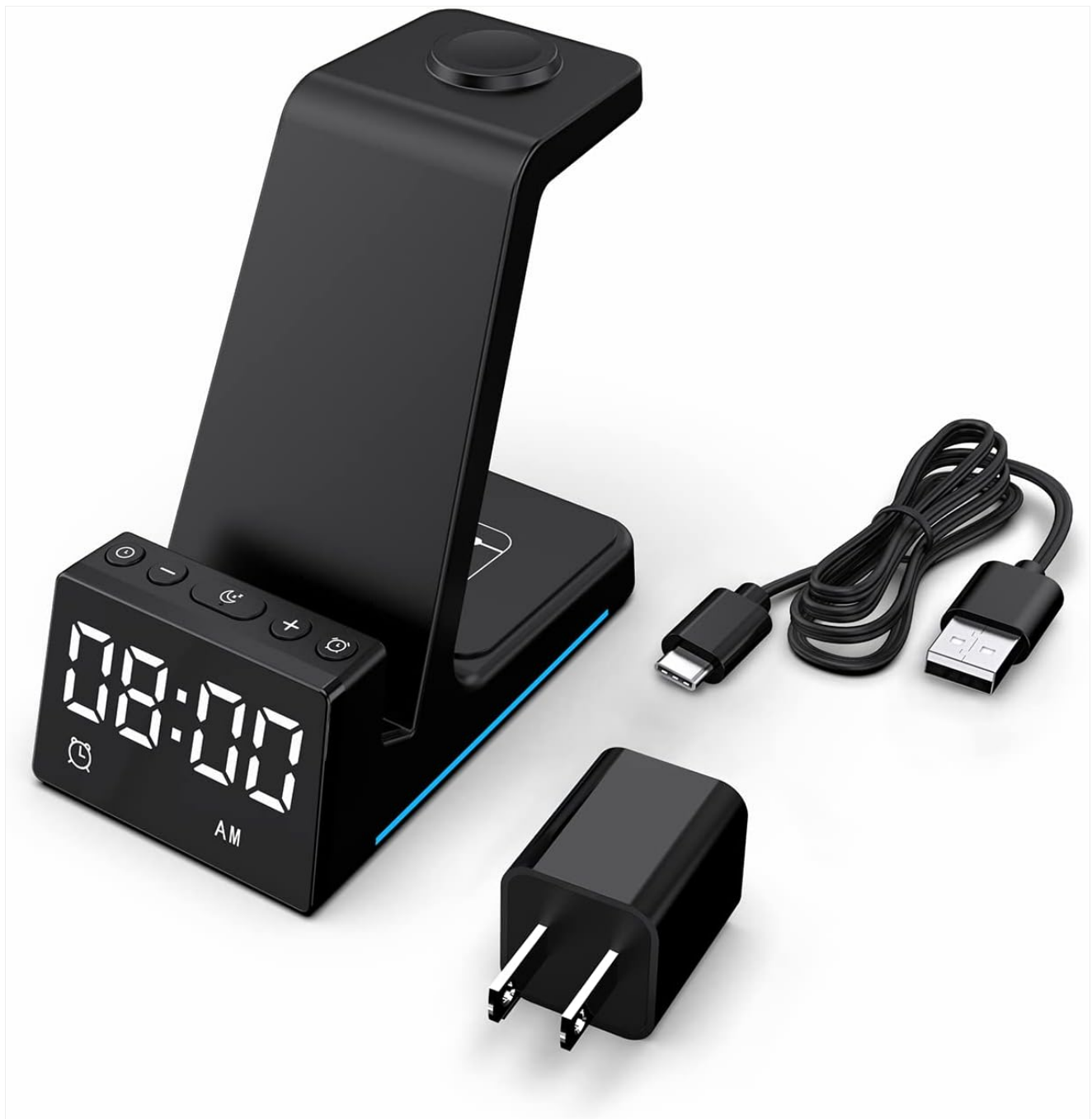
Image: All components included in the product packaging.