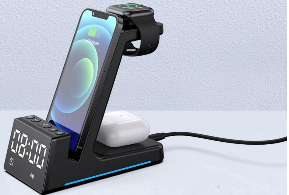
Image: The charging station with devices in place, highlighting its multi-device capability.

AirPods 2 (with the Wireless Charging Case), AirPods 3, AirPods Pro and more