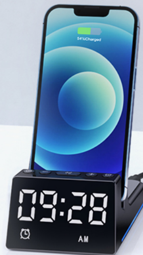
Image: Overview of the digital alarm clock features.