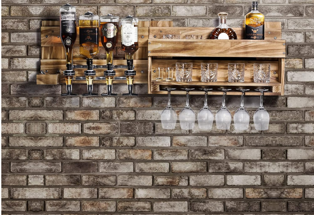
Figure 3: Illustration of the maximum load-bearing capacity: 22 lbs for the left dispensing area and 33 lbs for the right shelf.

The wooden design makes your living room or kitchen more rustic and impressive. Unlike standardized industrial products, the knots on the wood, it is spread by wood, so there's normal, and each knot is unique.