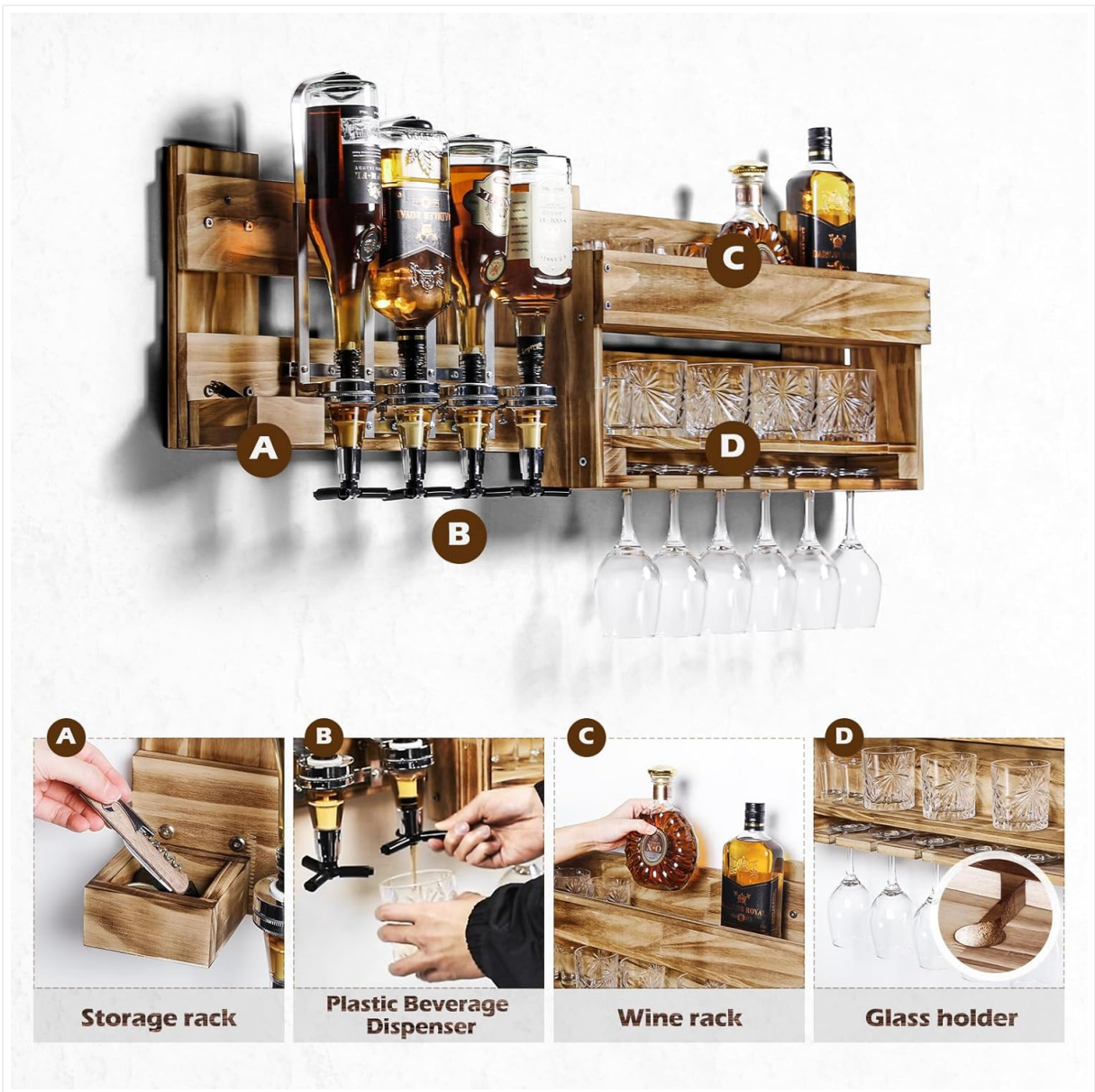
Figure 2: Breakdown of the wine rack's features: (A) Storage area, (B) Plastic Beverage Dispenser, (C) Wine bottle shelf, (D) Glass holder.