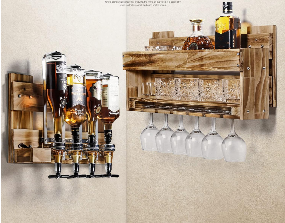
Figure 6: The wine rack can be used as a single unit or separated into two parts for flexible arrangement.

Its wooden design makes your living room or kitchen more rustic and impressive. Unlike standardized industrial products, the knots on the wood, it is spliced by wood, so that's normal, and each knot is unique.