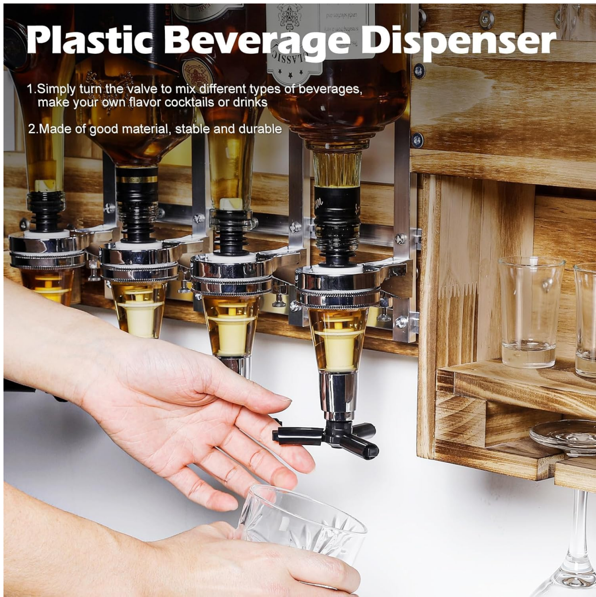
Figure 5: Close-up view of the plastic beverage dispenser, showing the mechanism for pouring drinks.

2. Made of good material, stable and durable