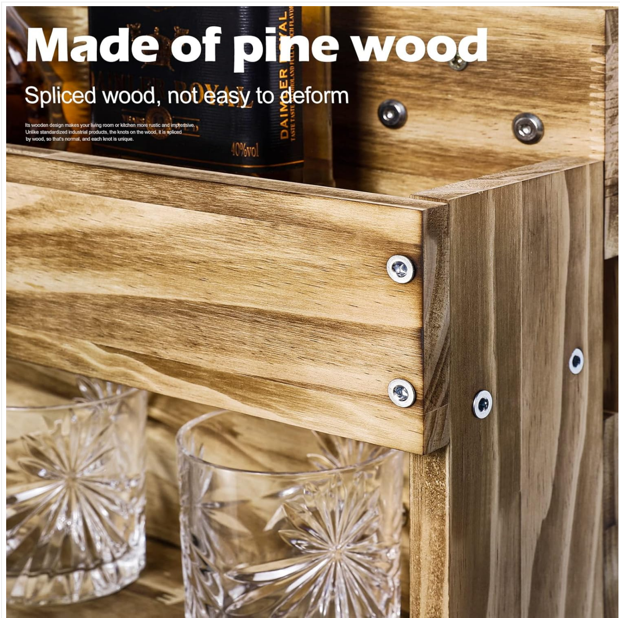
Figure 1: Fully assembled Homde Wall Mounted Wine Rack with liquor bottles, glasses, and dispensers.