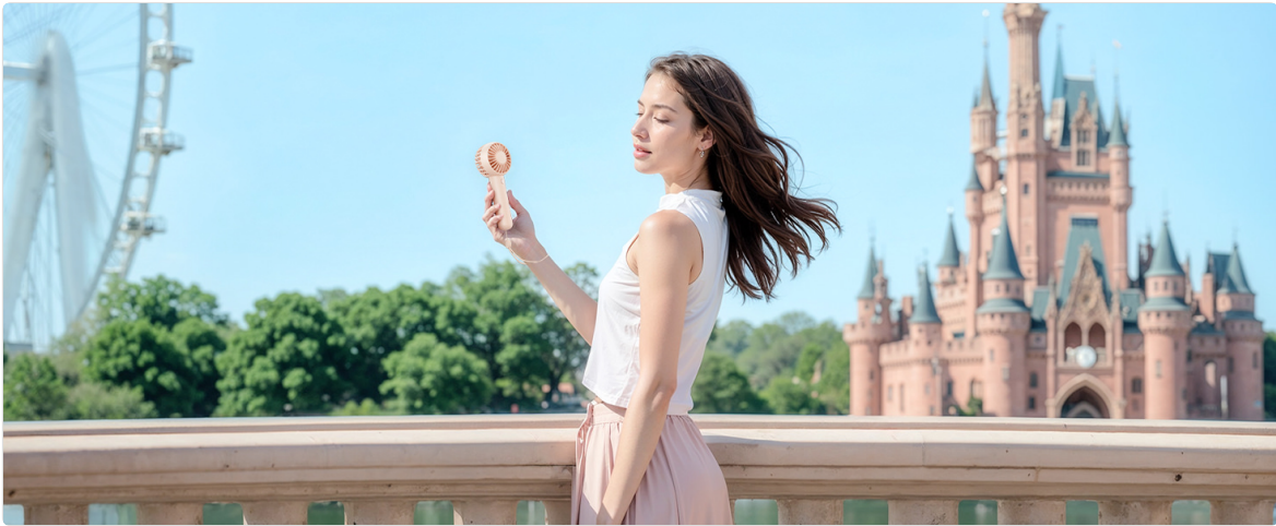
Figure 4: One-Touch Operation

4. To Power Off: Press the power button a fourth time to turn the fan off.