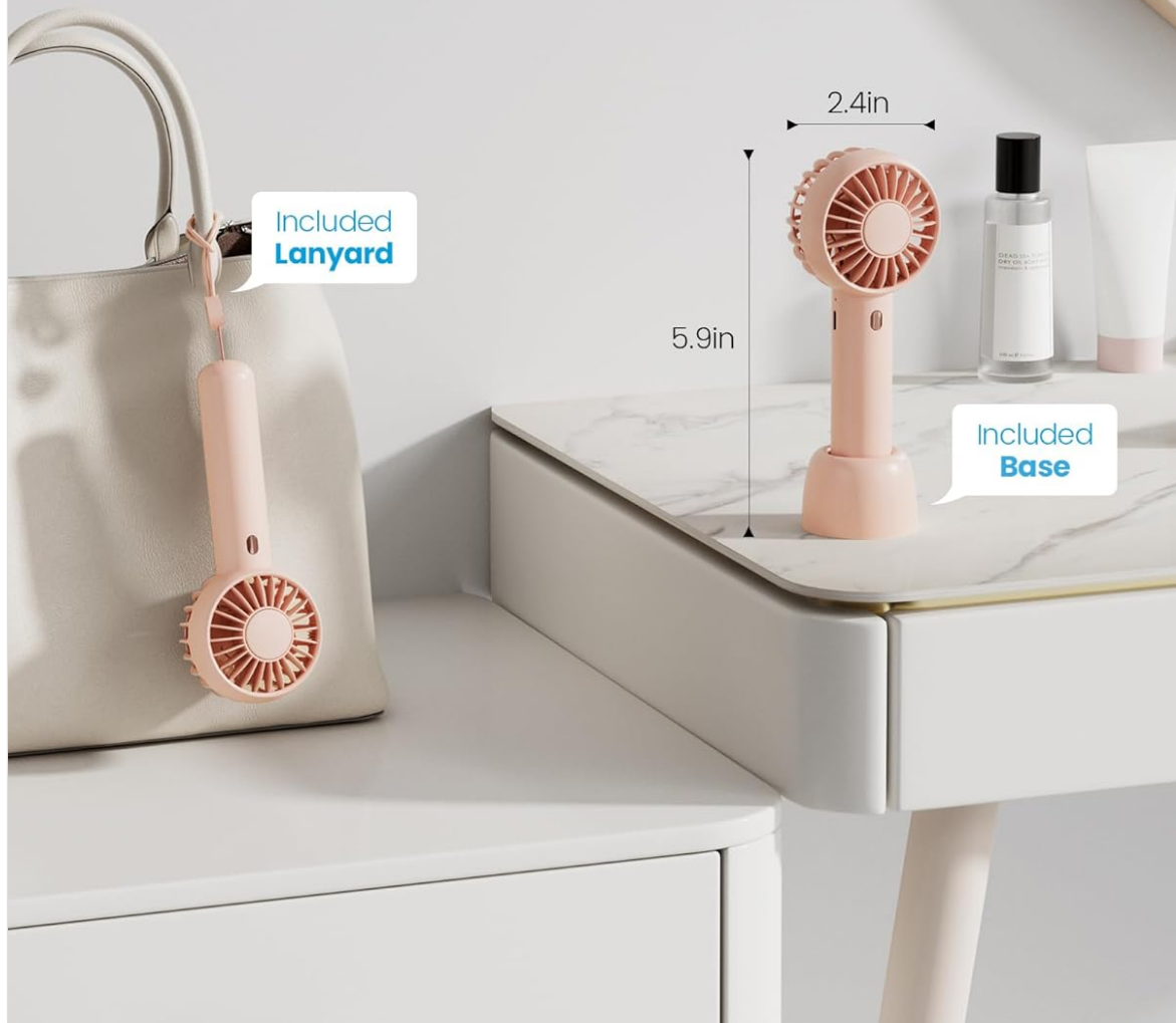
Figure 5: Handheld and Desktop Configurations