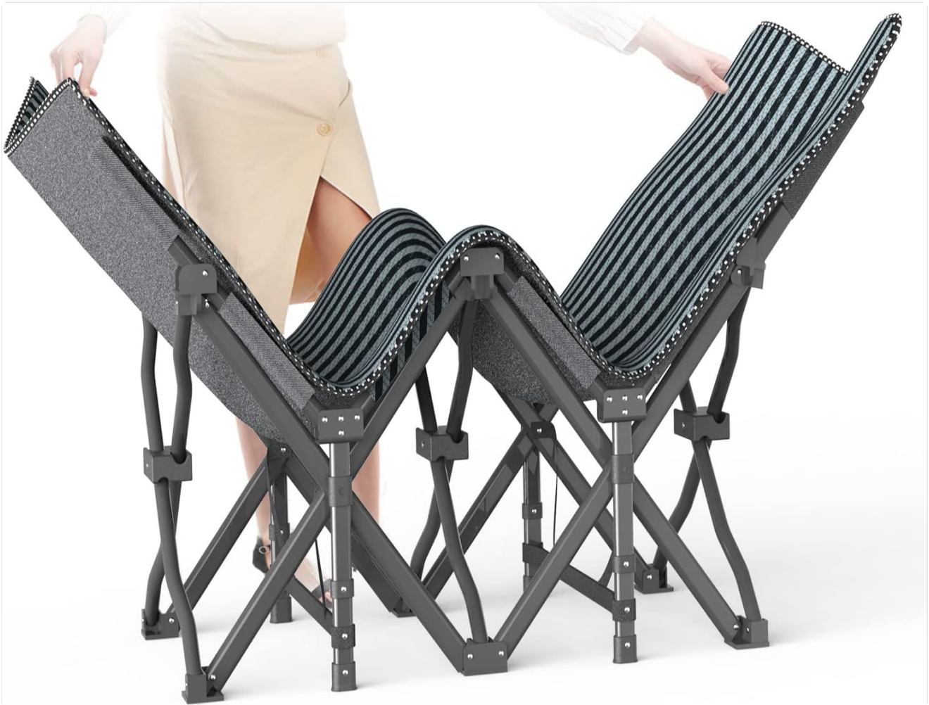
Figure 3.2: Unfolding the cot for immediate use.