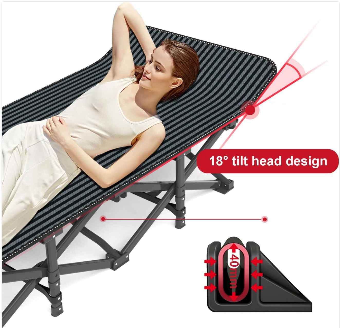
Figure 4.2: The cot's fabric is designed for breathability, enhancing comfort in various conditions.