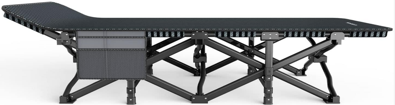
Figure 4.1: The removable cot pad provides additional comfort and support.