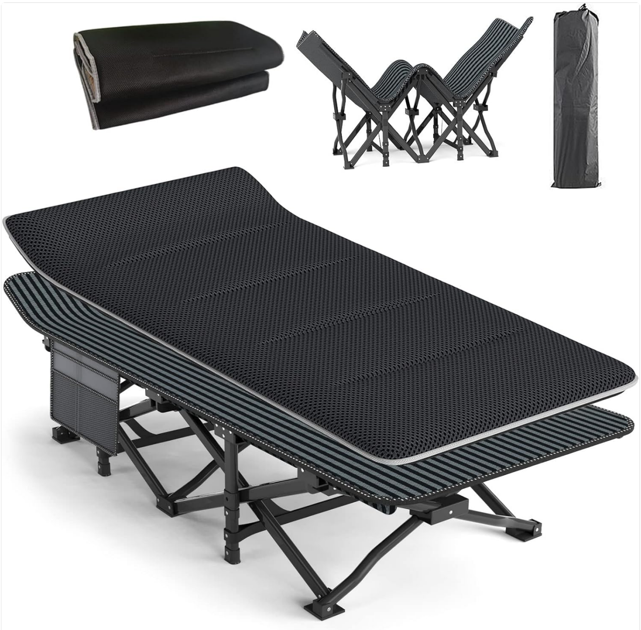
Figure 7.1: The ATORPOK Camping Cot with its cushion and carry bag.