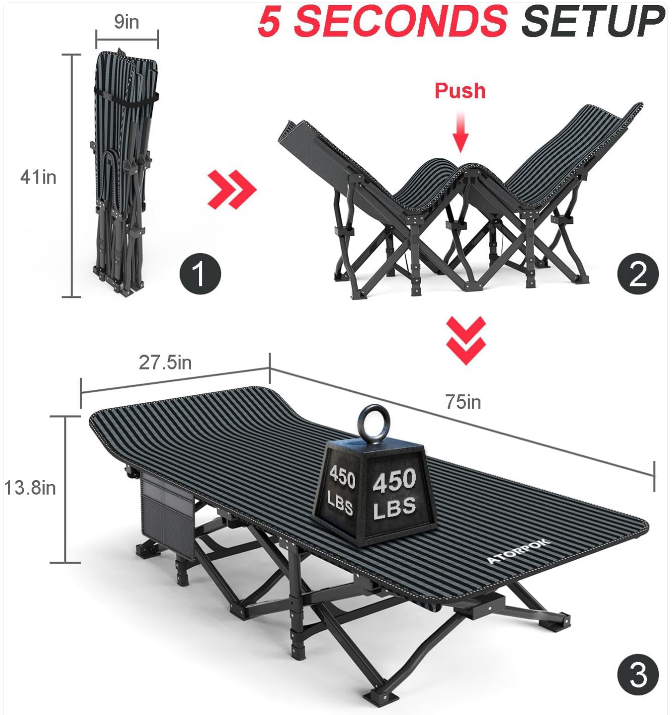
Figure 3.1: Visual guide for the 5-second cot setup process.