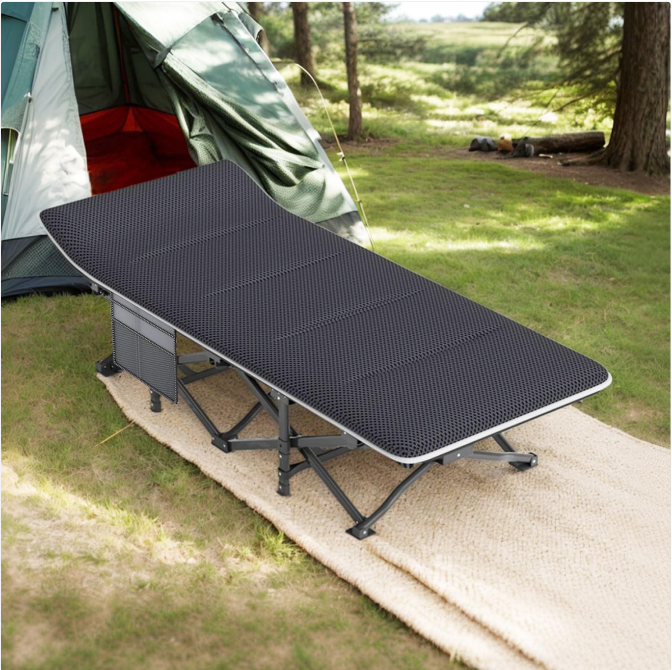
Figure 4.4: The 18-degree tilted head design for improved comfort.