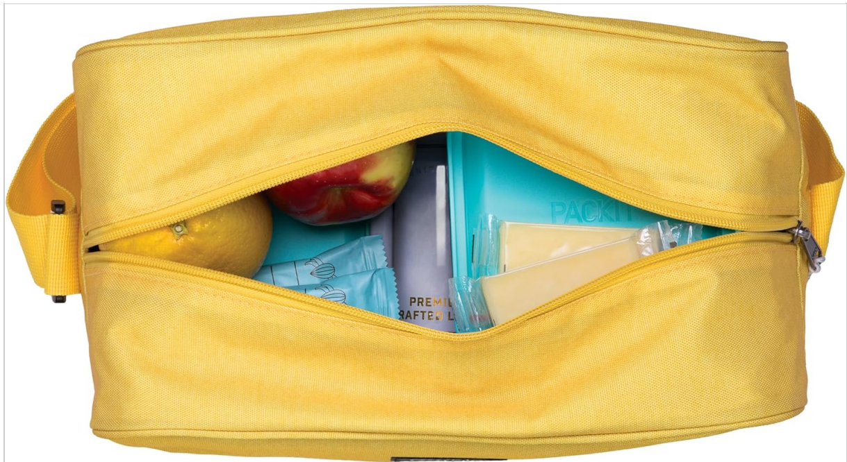
Figure 4: Cooler interior packed with items