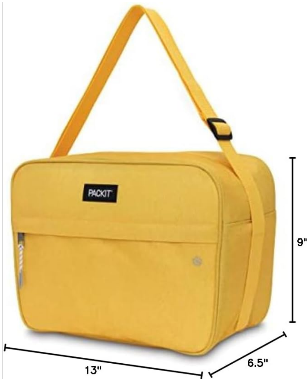
Figure 6: Product dimensions