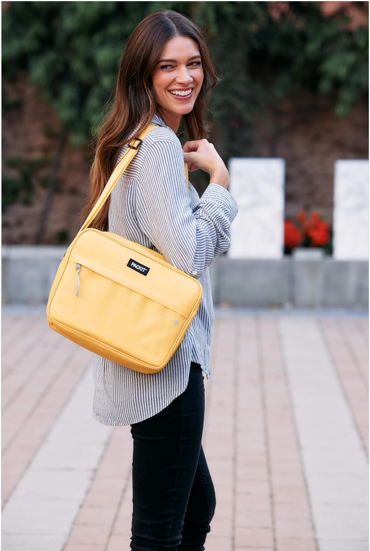
Figure 5: Cooler being carried with shoulder strap