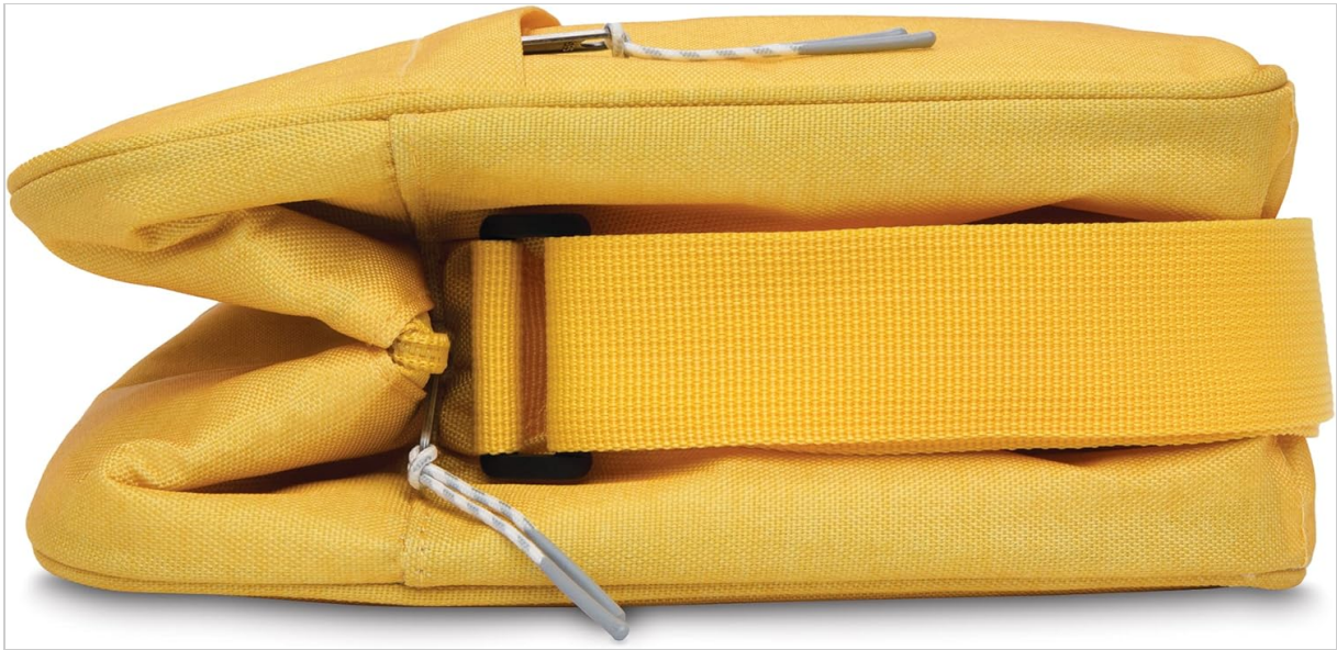
Figure 2: Collapsed cooler ready for freezing