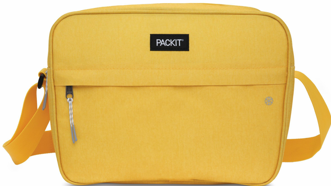
Figure 1: PackIt Freezable Zuma Can Cooler (Lemonade)