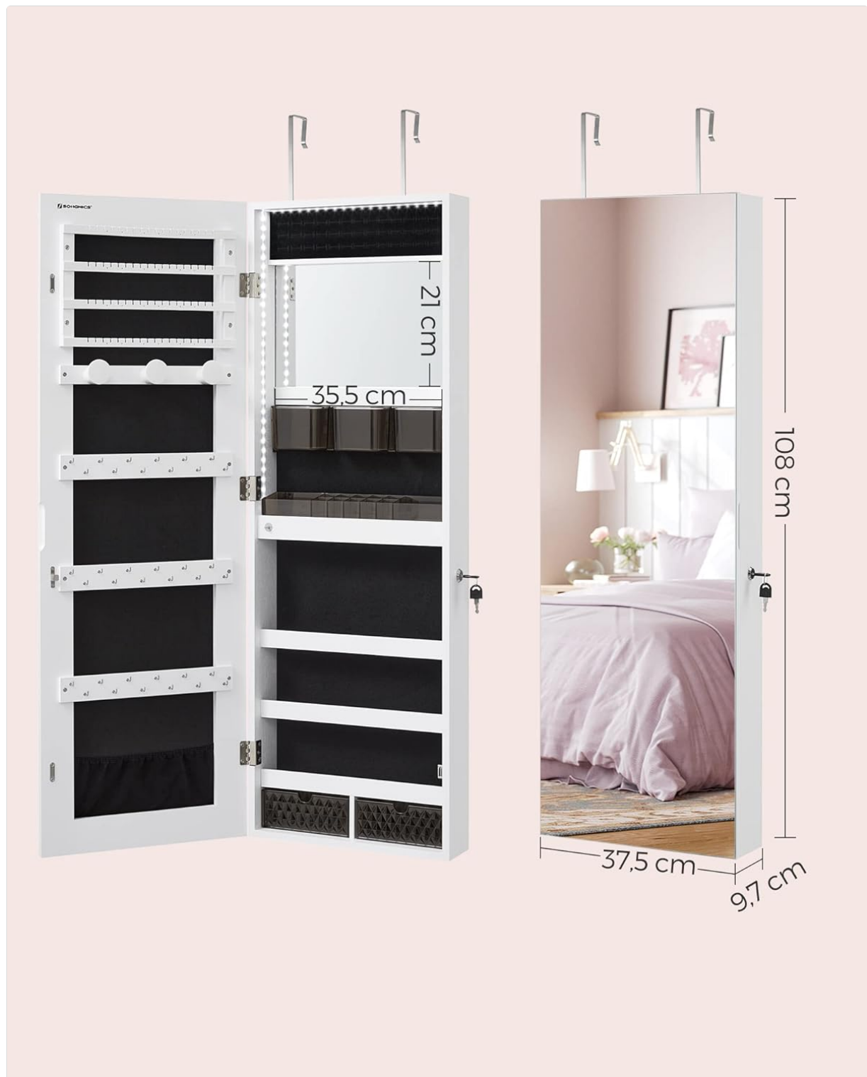
Image: Diagram illustrating the key dimensions of the jewelry cabinet, including its height (108 cm), width (37.5 cm), and depth (9.7 cm).