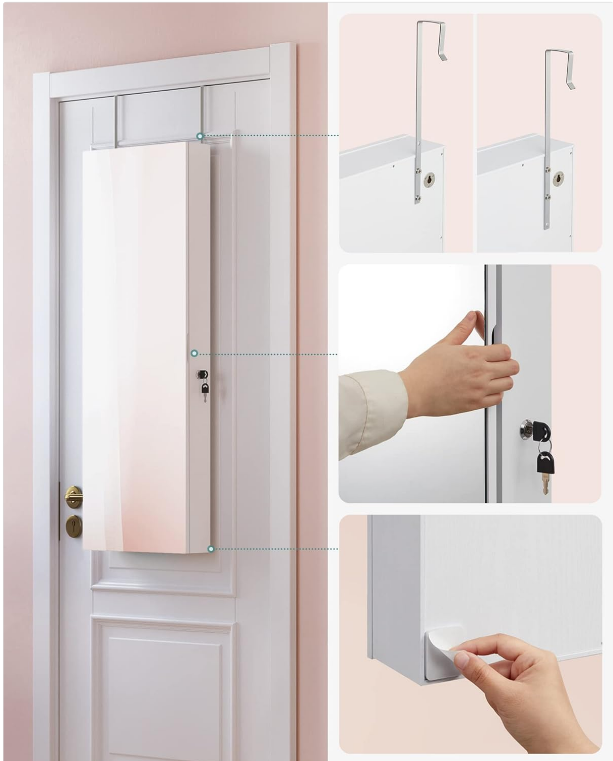
Image: Visual guide illustrating the steps for attaching over-door hooks, securing the cabinet, and using protective pads.