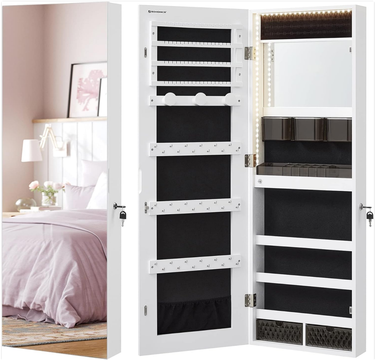
Image: The SONGMICS Wall-Mounted Jewelry Cabinet, showing its full-length frameless mirror when closed and its organized interior with LED lights when open.