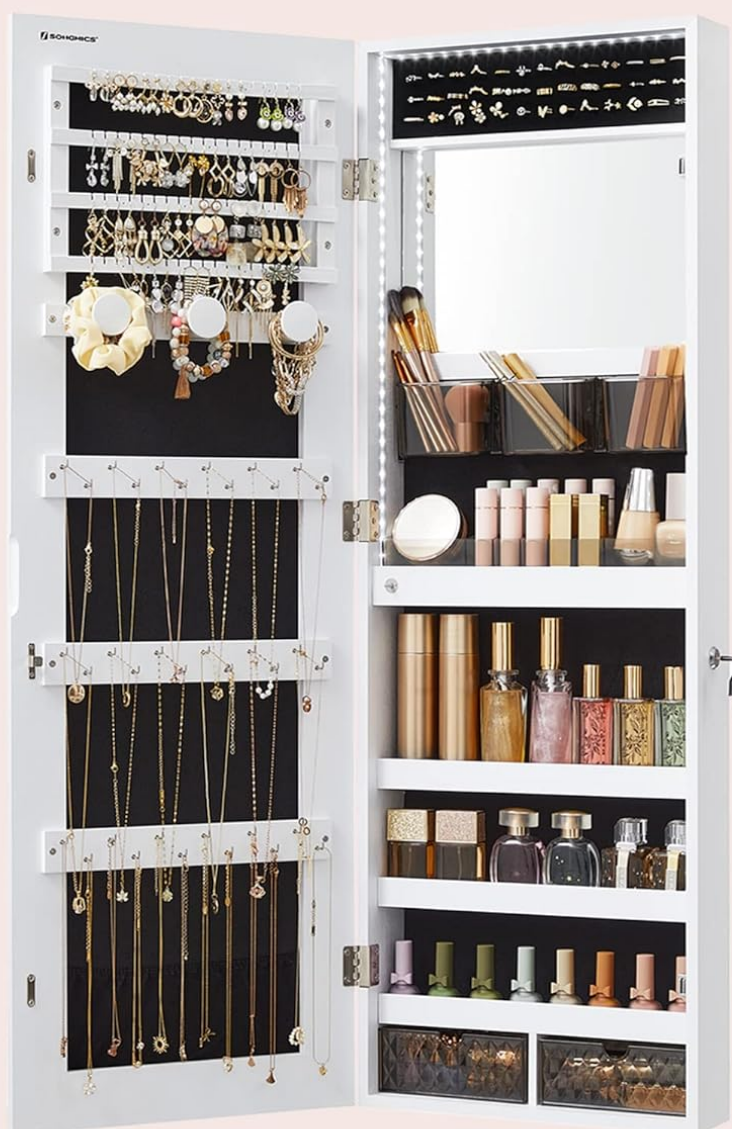
Image: Detailed view of the cabinet's interior, highlighting the dedicated storage for earrings (72 slots), ear studs (24 slots), rings (39 slots), and necklaces (36 hooks).