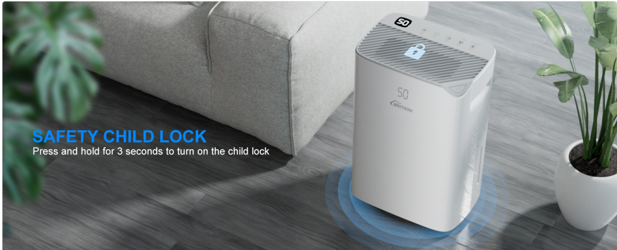
Figure 4.5: The safety child lock feature prevents unintended operation by locking the control panel.