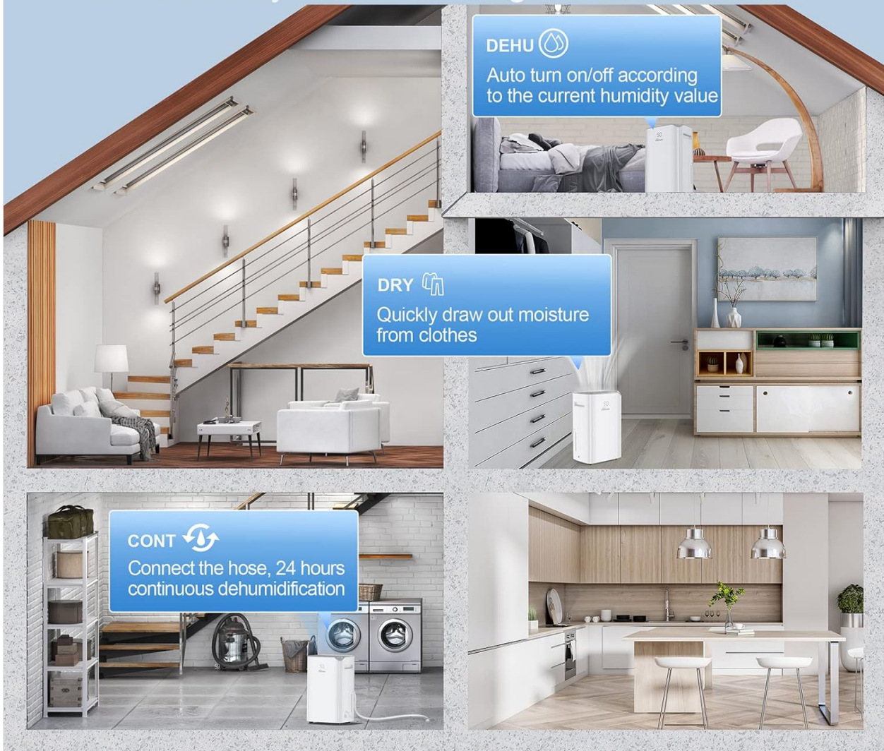
Figure 4.2: The three working modes: DEHU for automatic humidity control, DRY for quick clothes drying, and CONT for 24-hour continuous dehumidification.

Switch at any time according to different needs