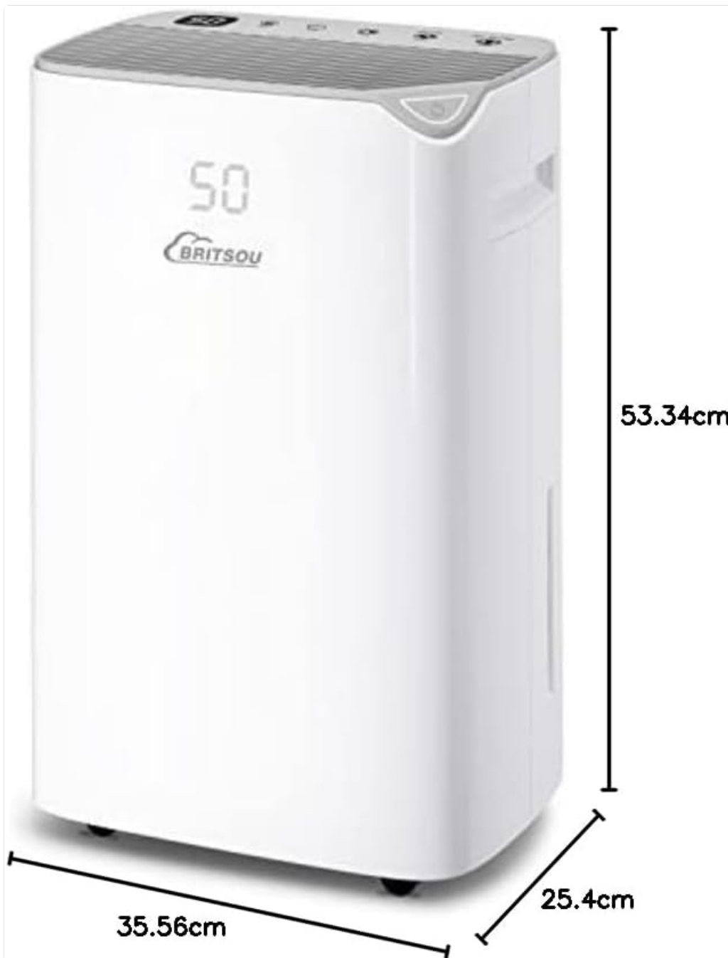
Figure 7.1: Dimensions of the Britsou PD08D Dehumidifier.