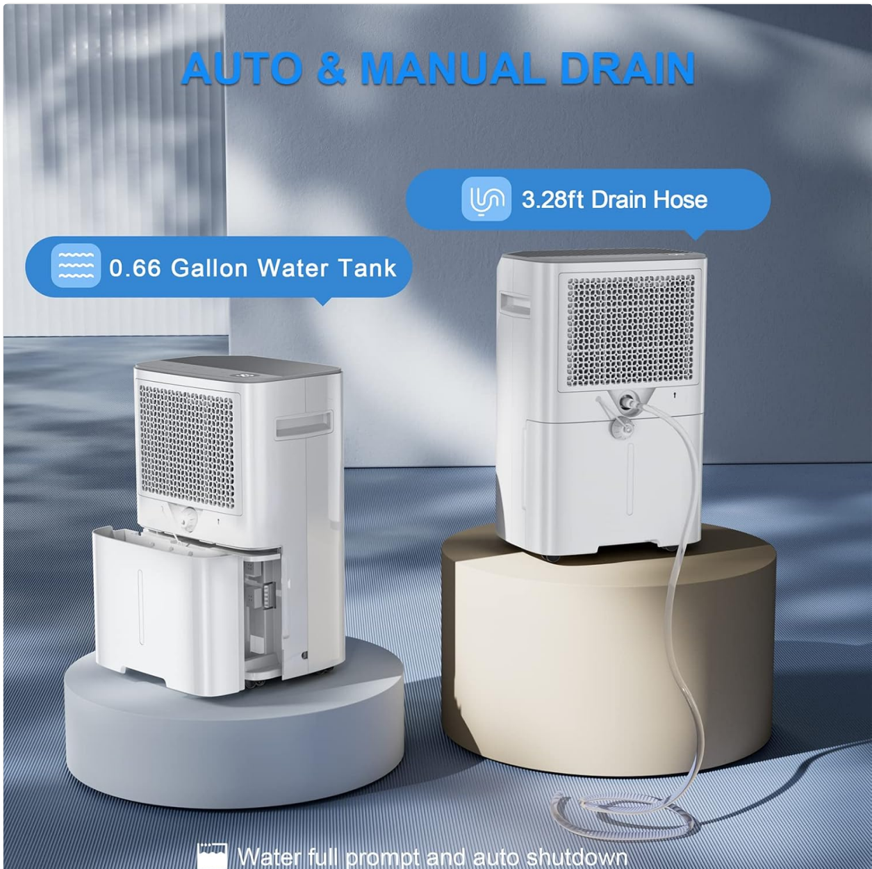
Figure 3.2: Illustration of the dehumidifier's 0.66 gallon water tank for manual drainage and the 3.28ft drain hose for continuous drainage.