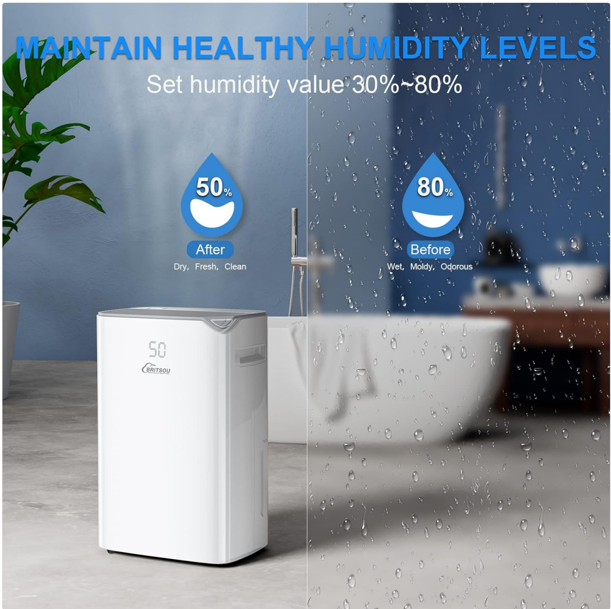
Figure 4.3: The dehumidifier helps maintain healthy humidity levels, transforming a wet, moldy, odorous environment (80% RH) into a dry, fresh, clean one (50% RH).