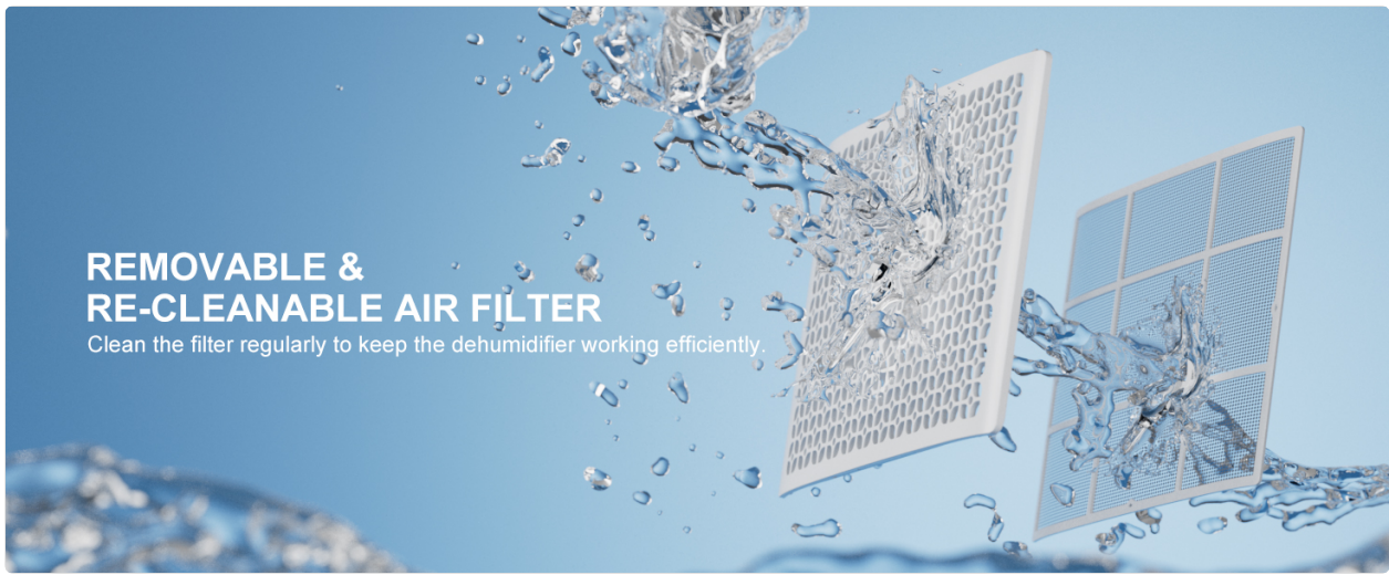
Figure 5.1: The removable and re-cleanable air filter helps maintain the dehumidifier's efficiency.