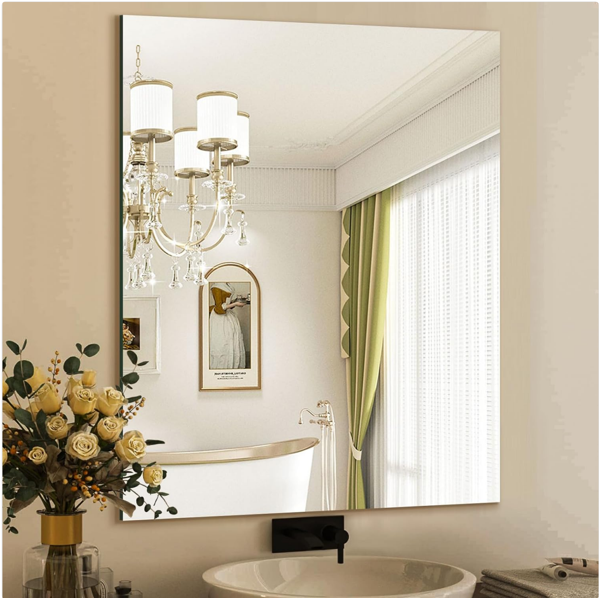
Figure 1: Mirrorons Frameless Bathroom Mirror (28"x36")