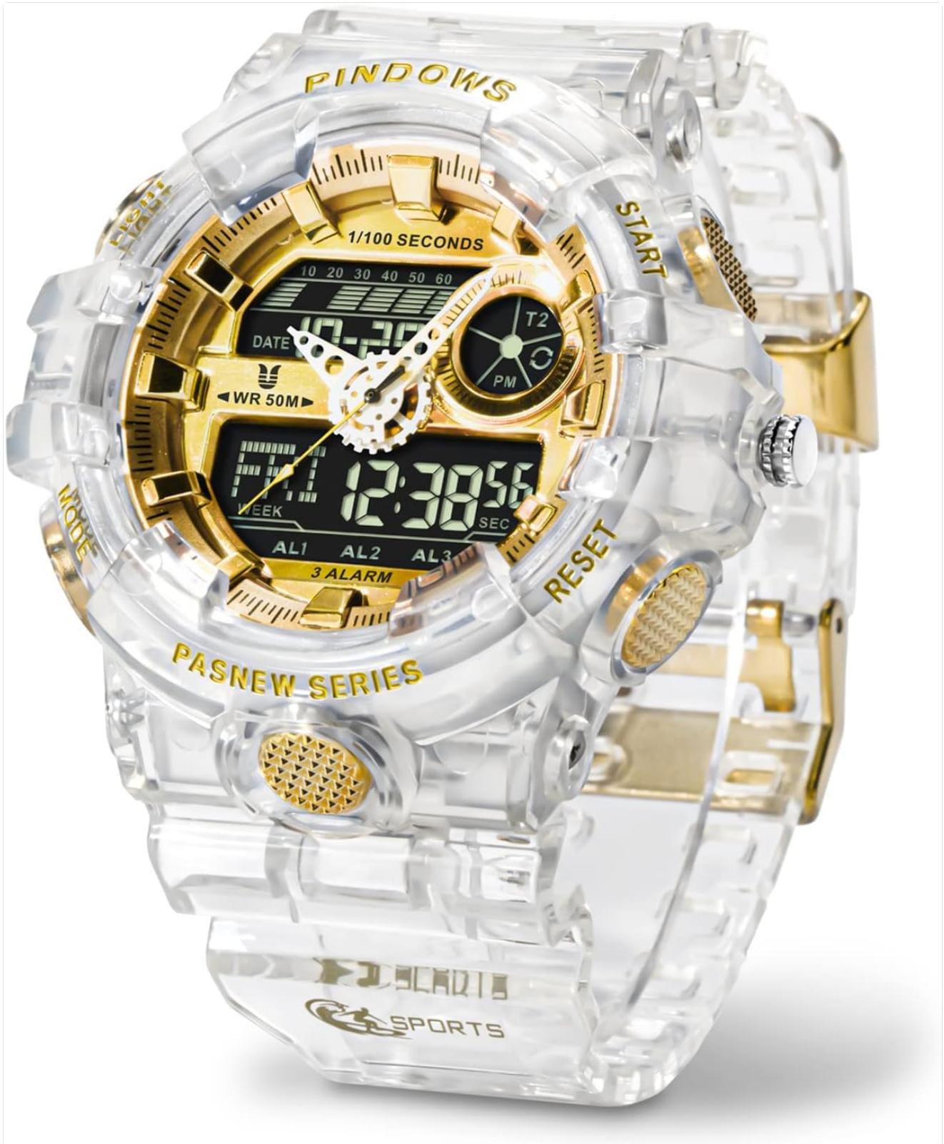
Figure 6.1: The watch is designed for 50M precision waterproofing.

Your PINDOWS PDS-603 watch is designed with 50-meter (5ATM) water resistance. This means it is suitable for: