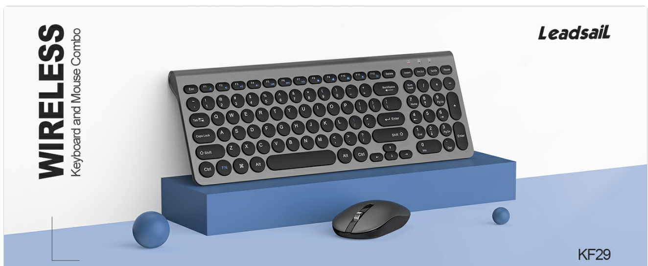
Image: LeadsaiL KF29 Wireless Keyboard and Mouse Combo showing the keyboard, mouse, and USB receiver.

Note: 1 AA battery for the mouse and 2 AA batteries for the keyboard are not included in the package.