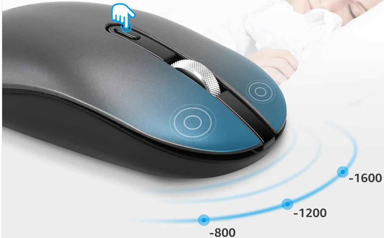
Image: Diagram illustrating the adjustable DPI settings of the Leadsail wireless mouse.