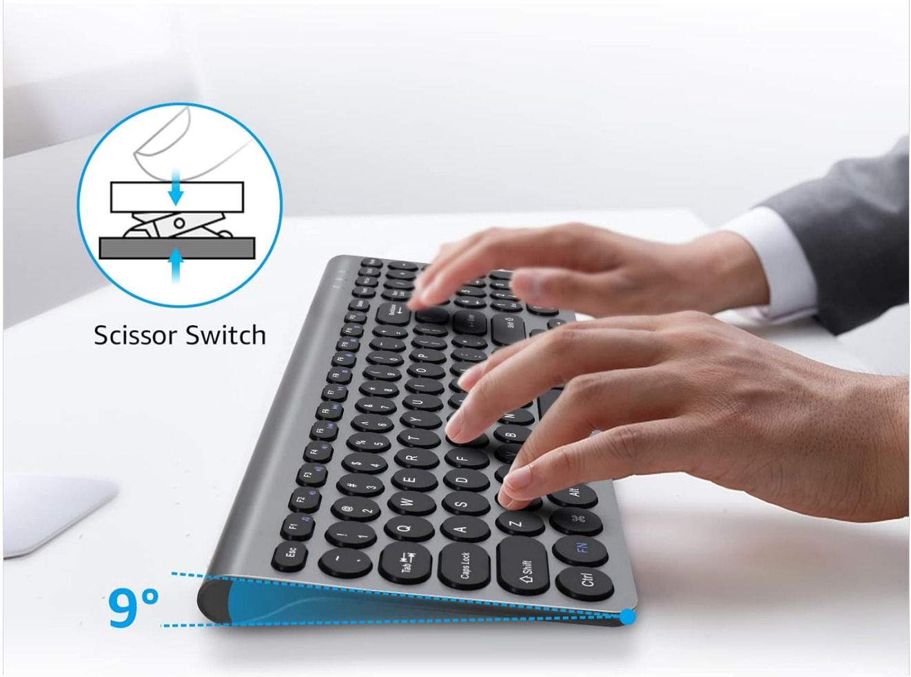
Image: Close-up of the keyboard demonstrating its ergonomic 9° angle and scissor-switch design for comfortable, quiet typing.

Comfortable quiet typing with under keyboard forms 9° angle , low profile and scissor-switch design, these keys guarantee quiet