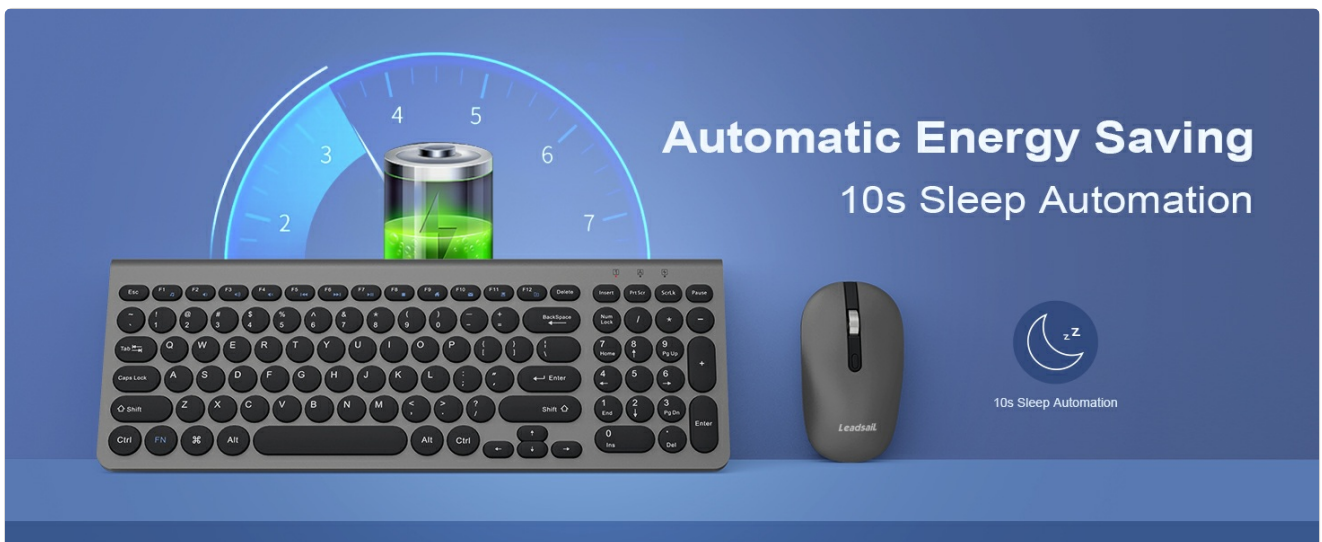
Image: Illustration showing the automatic energy-saving feature of the keyboard and mouse, with a battery icon and sleep automation.