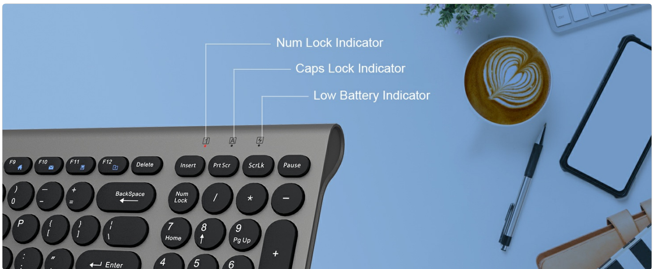
Image: Close-up of the keyboard's top right corner, showing the Num Lock, Caps Lock, and low battery indicator lights.