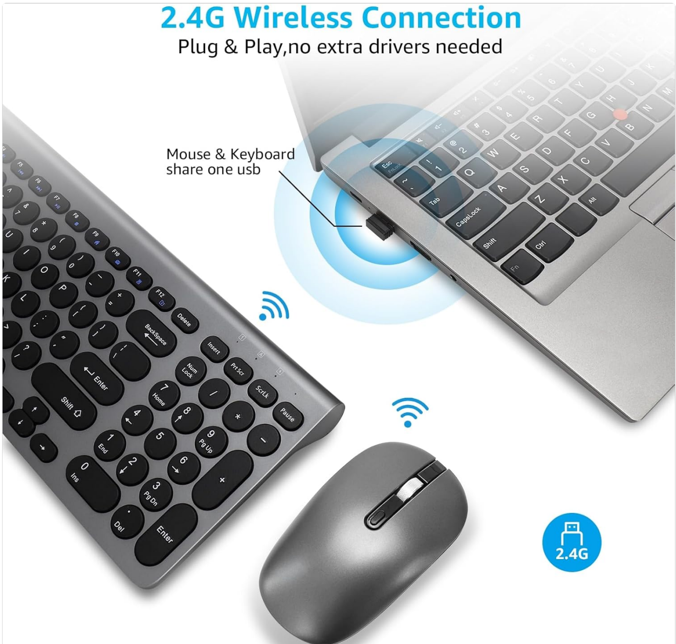
Image: Illustration showing the USB receiver being plugged into a laptop, establishing a 2.4G wireless connection for the keyboard and mouse.

5. Automatic Connection: The keyboard and mouse will automatically connect to your computer. No additional drivers are typically required for installation.