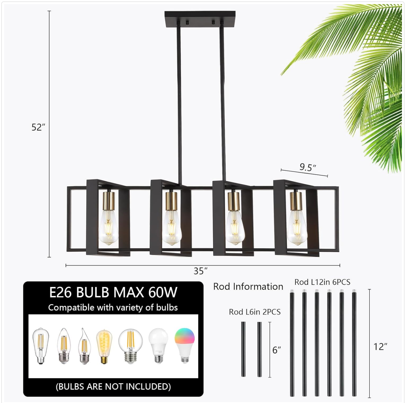
Figure 1: Exploded view of the lighting fixture components and dimensions.