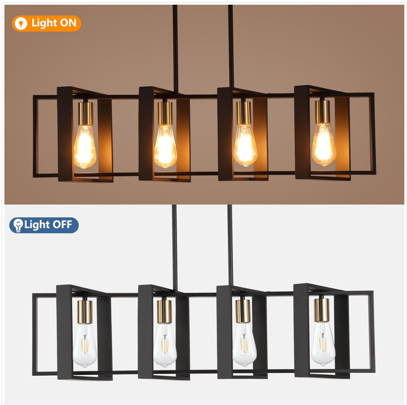
Figure 4: Light fixture with bulbs on and off.