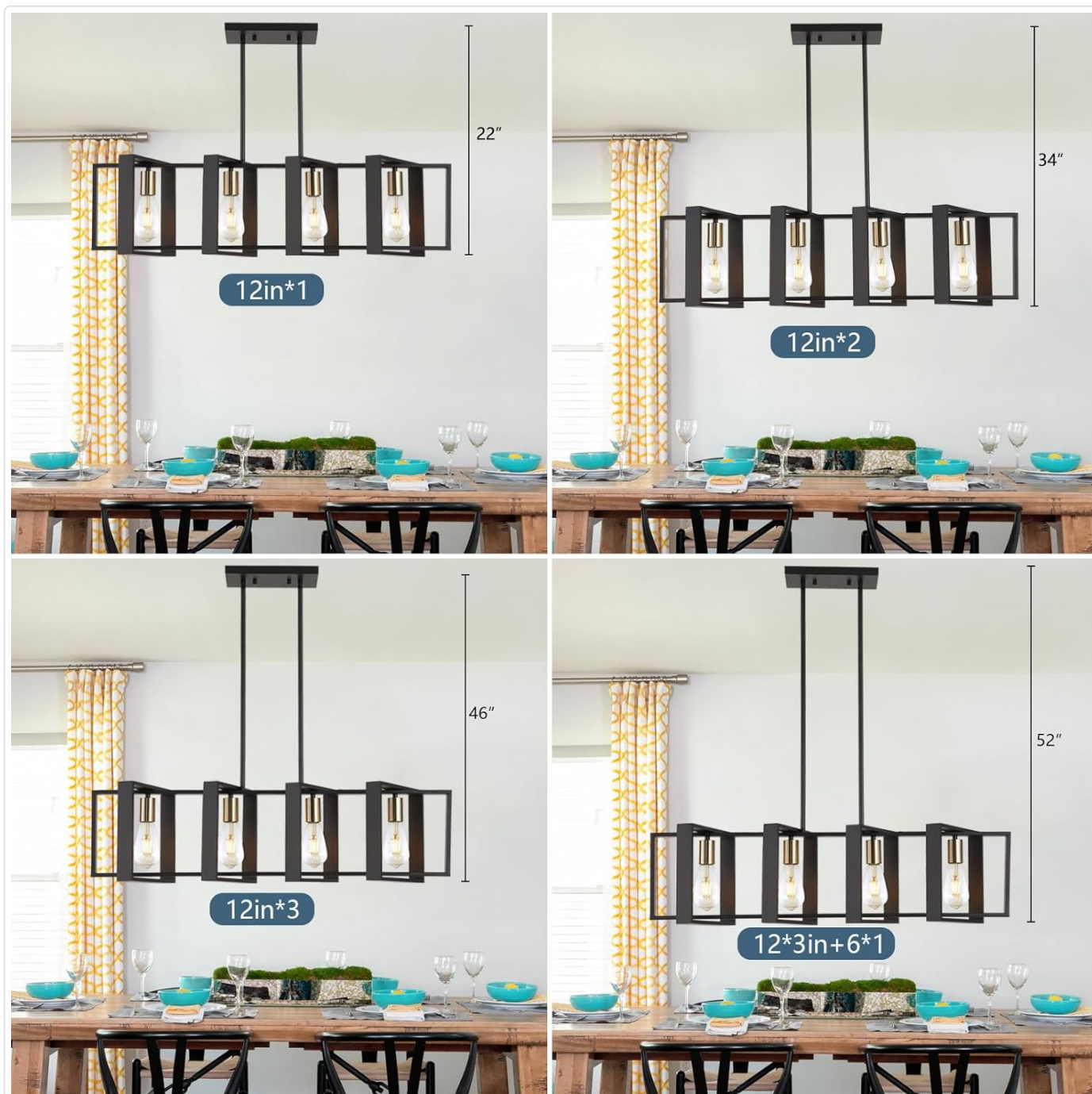
Figure 3: Examples of adjustable heights for the fixture.