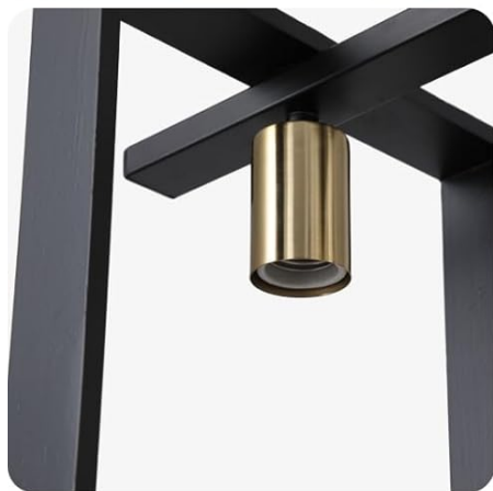
E26 Bulb Base