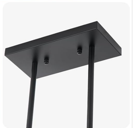
Solid Metal Chassis