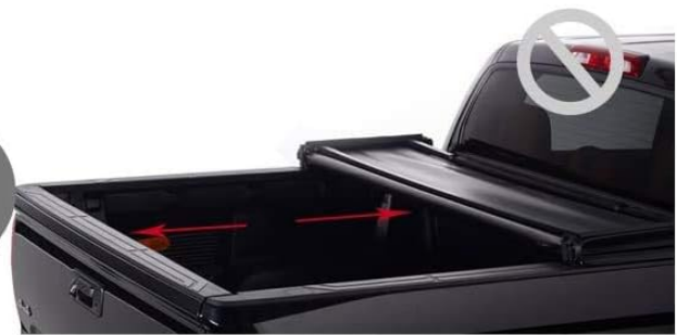
3/2 - 4/3 Space