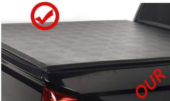
Smooth And Flat Look

Provides A Smooth And Flat Look When Closed