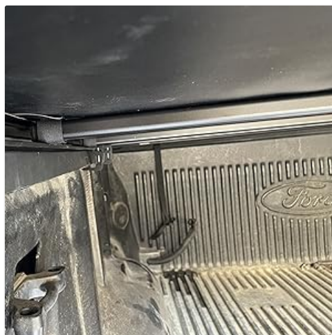
Image: A close-up view showing the side rail being attached to the main cover assembly, highlighting the connection point.

Align the left and right side rails with the connection parts of the cover assembly. Fasten the set screws tightly to secure the rails to the cover assembly. Ensure the rails are parallel and extend evenly along the truck bed.