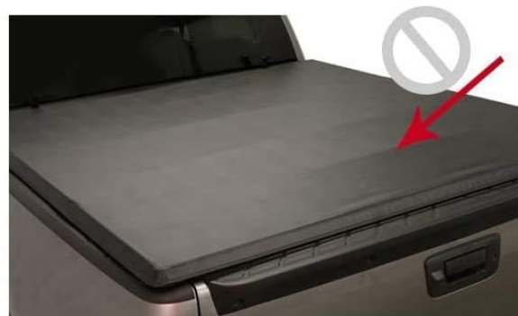
The Bars Are Visible

Image: A visual comparison highlighting the full space provided by this tonneau cover when open versus other designs, and its smooth, flat appearance when closed.