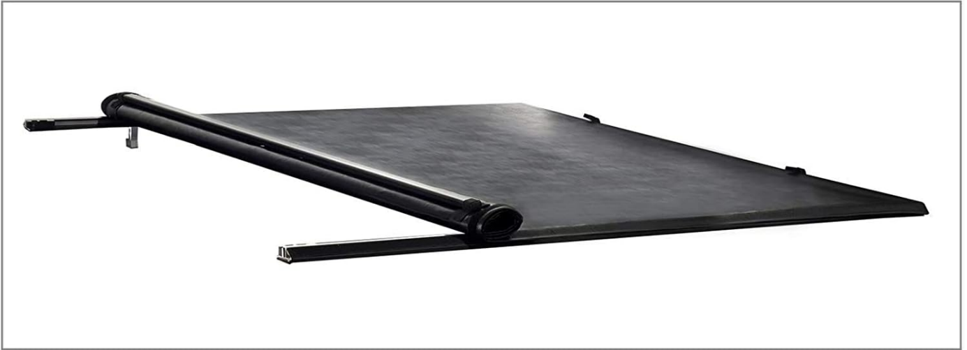
Image: The tonneau cover assembly, in its rolled-up state, positioned at the front of the truck bed, ready for rail attachment.