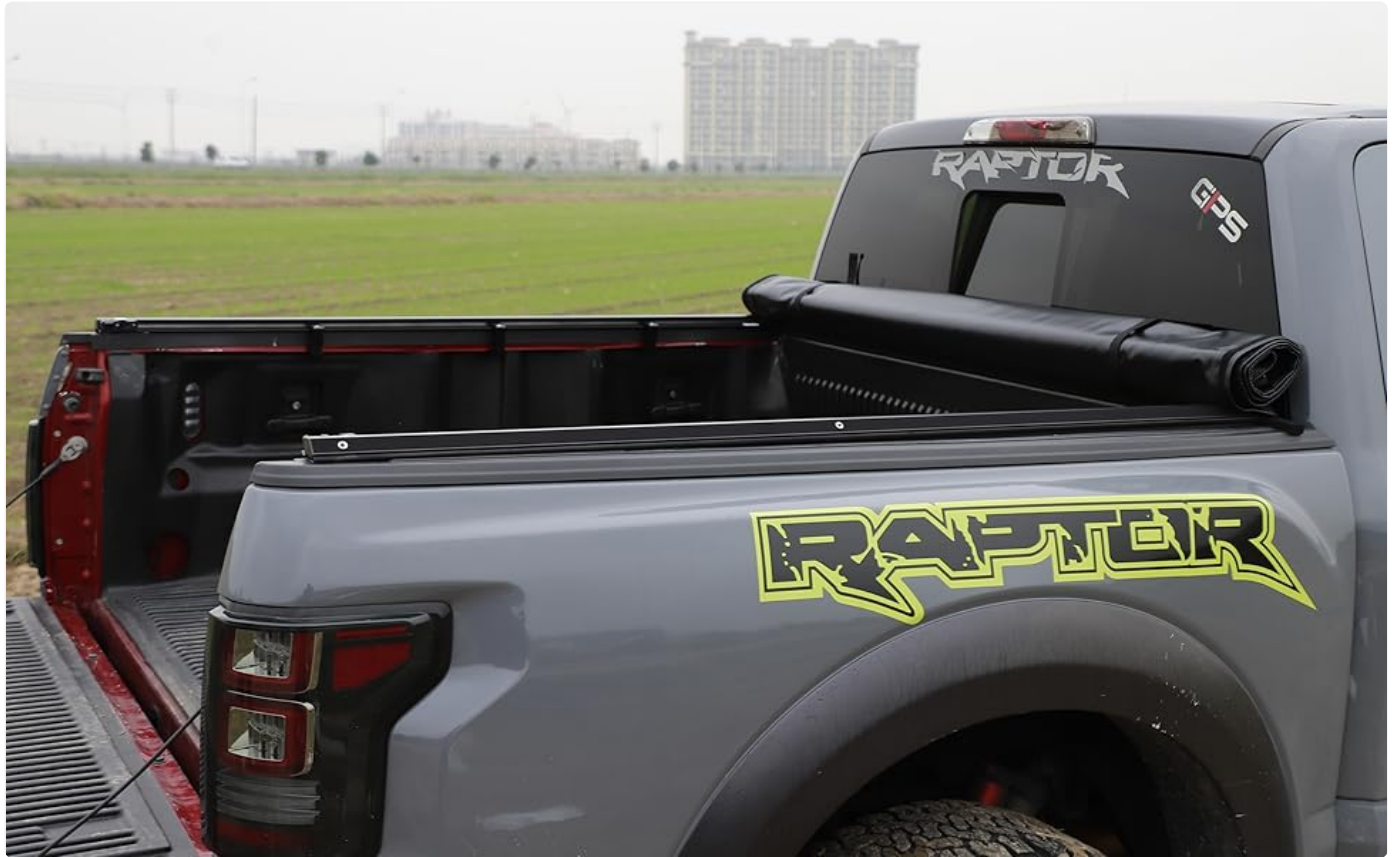
Image: The truck bed with the tonneau cover fully rolled up and secured at the front, providing full access to the bed.

The design allows for full access to the truck bed, unlike some covers that may obstruct space with crossbars.