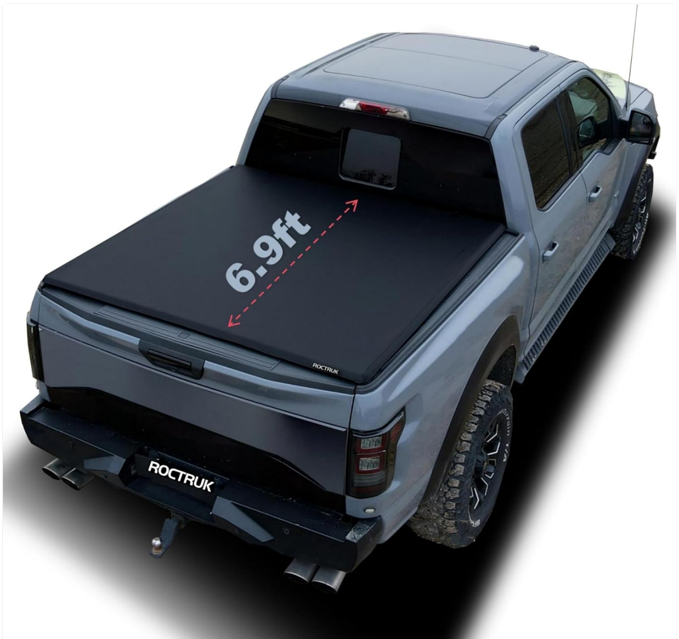
Image: The ROCTRUK Soft Roll Up Vinyl Tonneau Cover fully installed on a truck bed, showing its sleek, low-profile design.