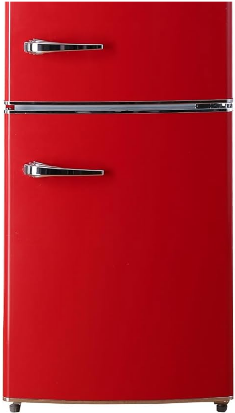
Image: The Conserv 24in Retro Bottom Mount Refrigerator in a vibrant red finish, showcasing its sleek design and two-door configuration.

Video: An official product video from Conserv, titled "Conserv 24in RETRO BOTTOM MOUNT Refrigerator Fast Freeze." This video highlights the key features and benefits of the refrigerator, including its design, storage options, cooling capabilities, and safety features.