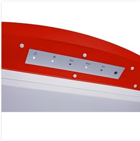
Image: A close-up view of the electronic temperature control panel, showing the buttons for activating Fast Cool and Flash Freeze modes.