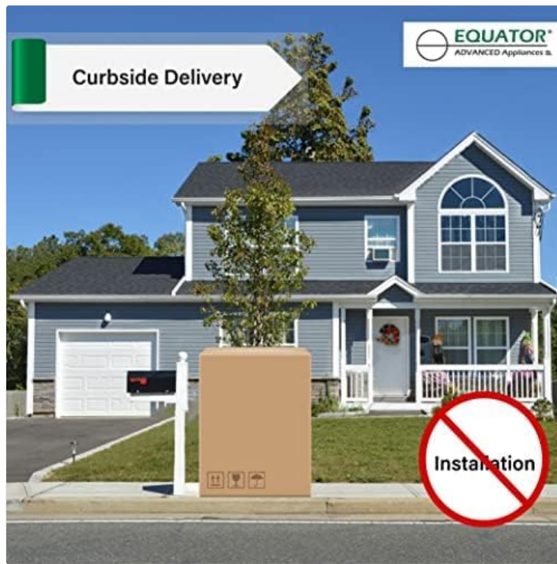
Image: This image illustrates that the refrigerator is delivered curbside and does not require professional installation, emphasizing its freestanding nature.