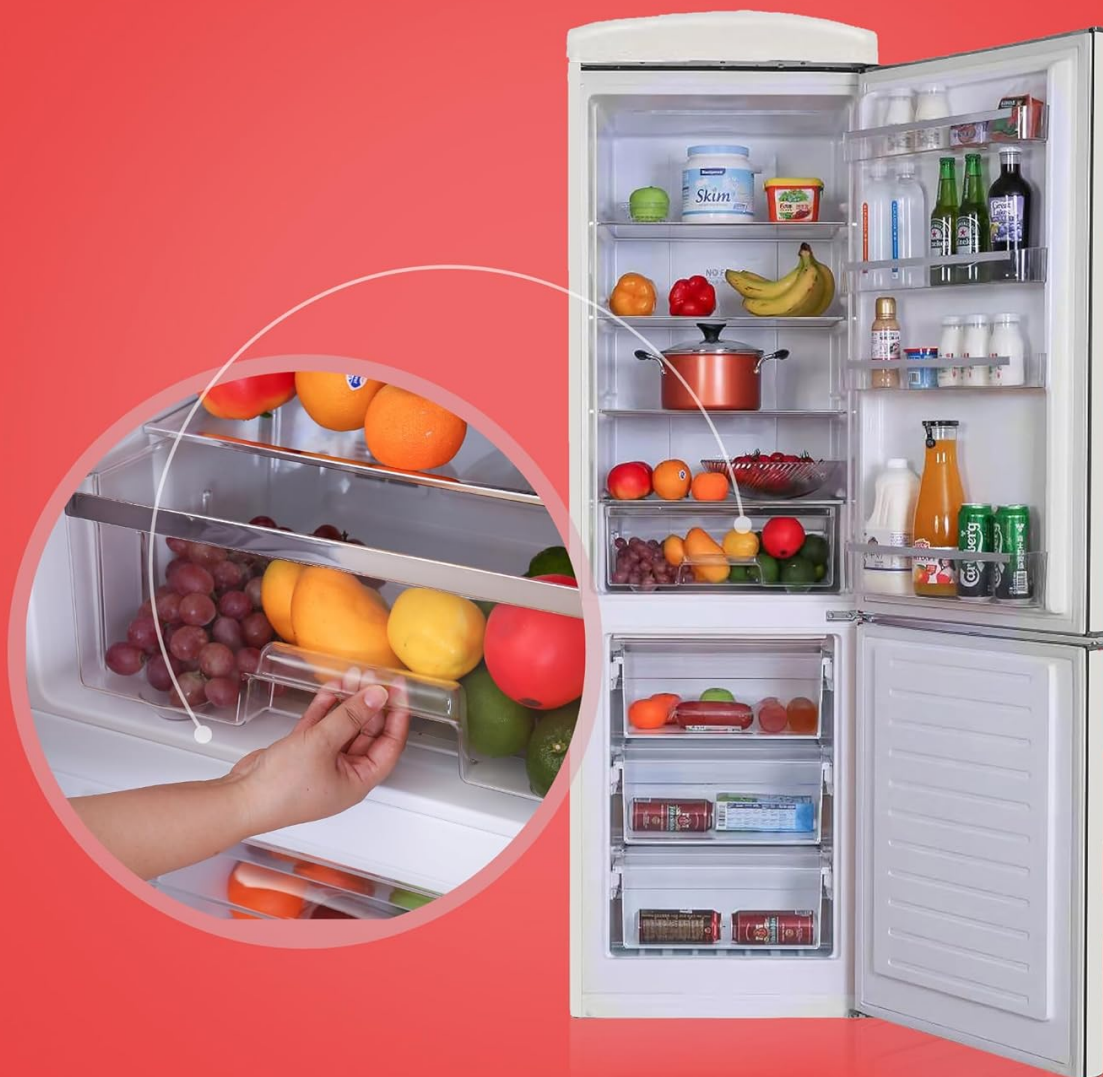
Image: A hand demonstrating the ease of access to the crisper drawers, designed for optimal storage of fruits and vegetables.