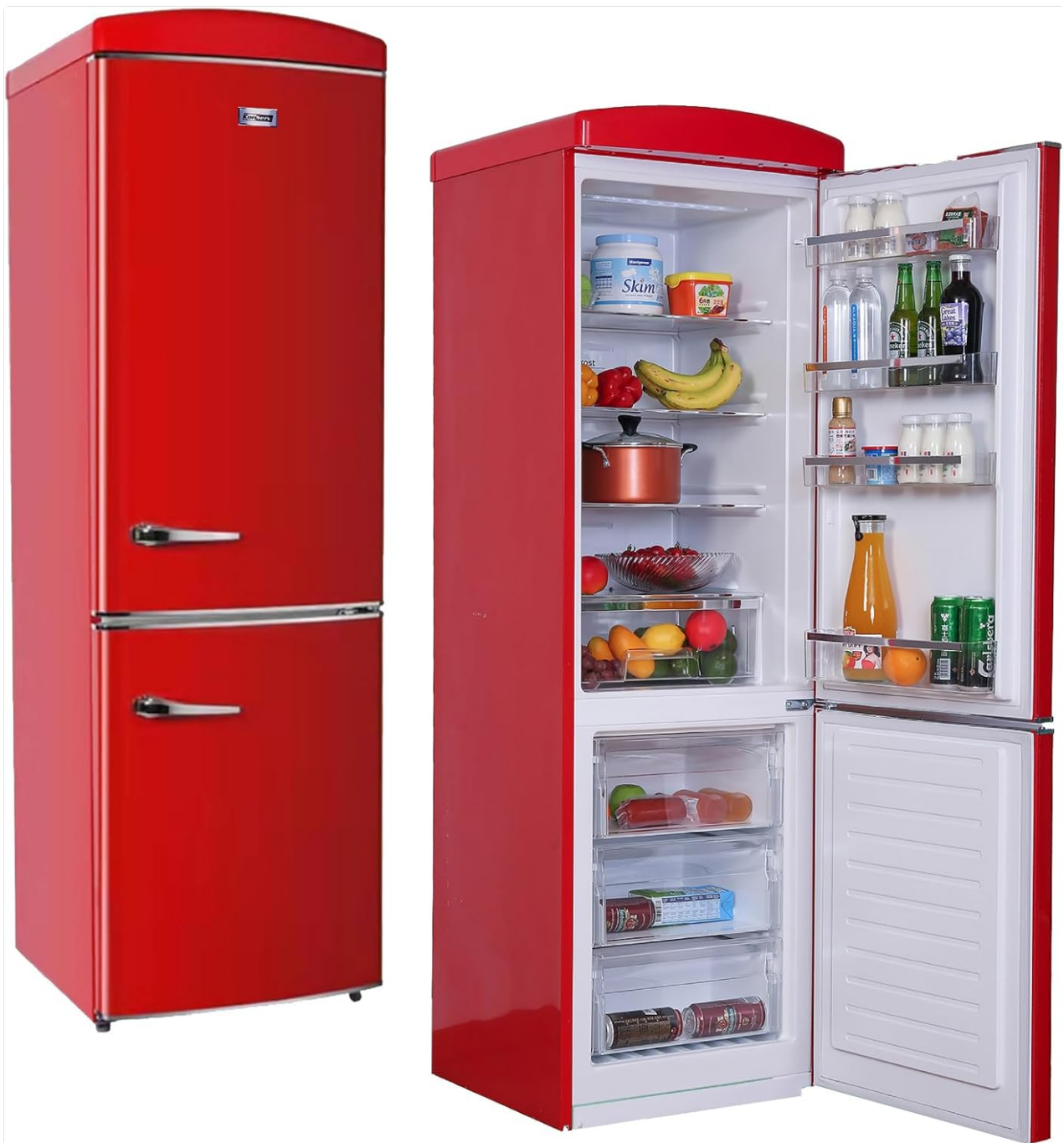
Image: The interior of the refrigerator, showing various food items organized on glass shelves and in door bins, highlighting its spacious design.