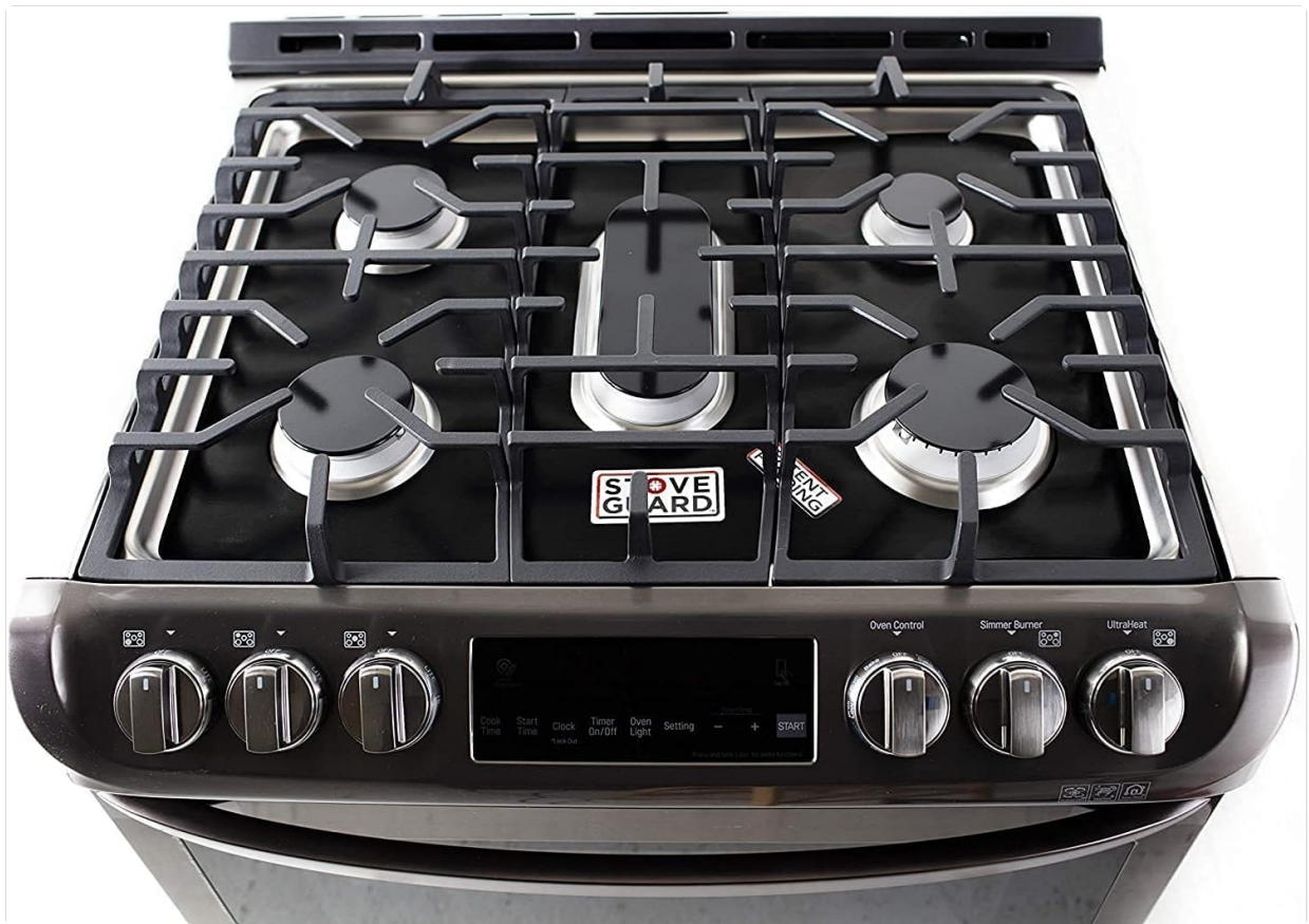
Image: StoveGuard protector fully installed on a GE gas range. The protector covers the stovetop surface around the burners, providing a clean and protected appearance.