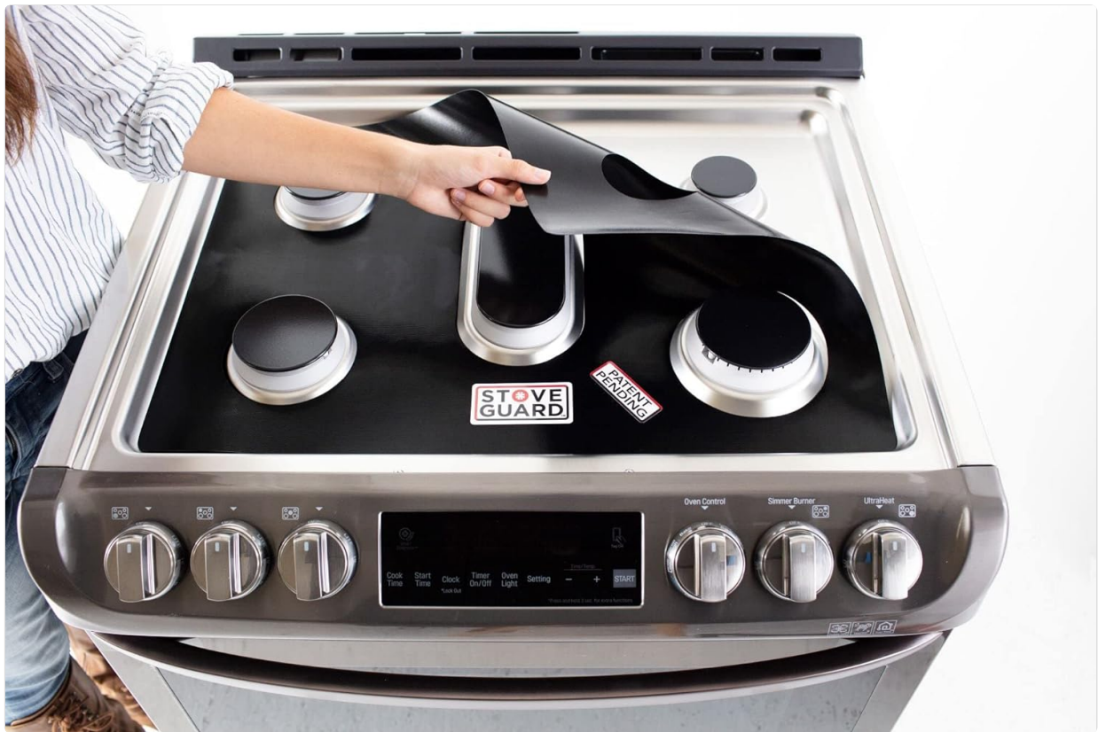
Image: Person carefully placing the StoveGuard protector onto a gas stove. A person is shown carefully positioning the custom-fit StoveGuard protector onto a gas range, aligning the cutouts with the stove's burners and grates.