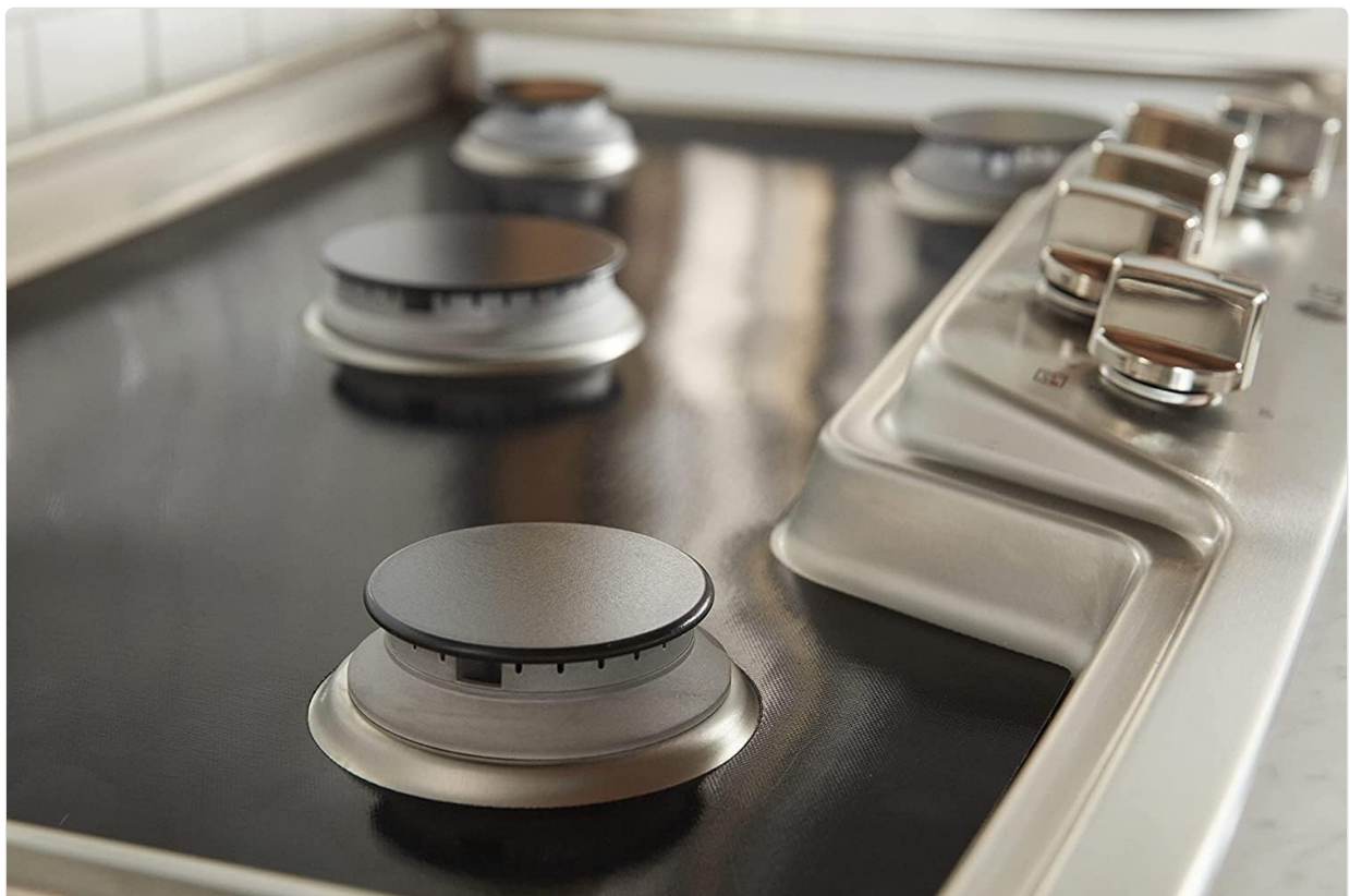
Image: Close-up view of a gas burner with the StoveGuard protector fitted around it. A detailed view of a gas burner with the StoveGuard protector precisely fitted around it, demonstrating the custom design and close fit.

Image: StoveGuard features: Simple and Safe, Heat Resistant, Precision Design. This graphic highlights key features of the StoveGuard protector: it is simple and safe to use, easily washable under a faucet; it is heat resistant, made from durable, flame-retardant materials; and it features a precision design for maximum surface protection.