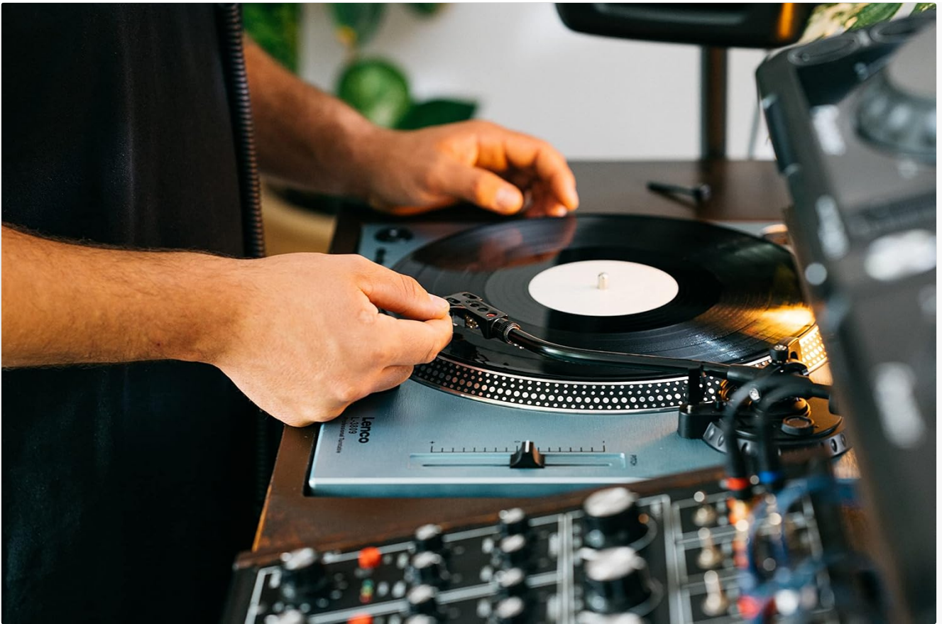
Image: Operating the turntable, placing the stylus on a record.