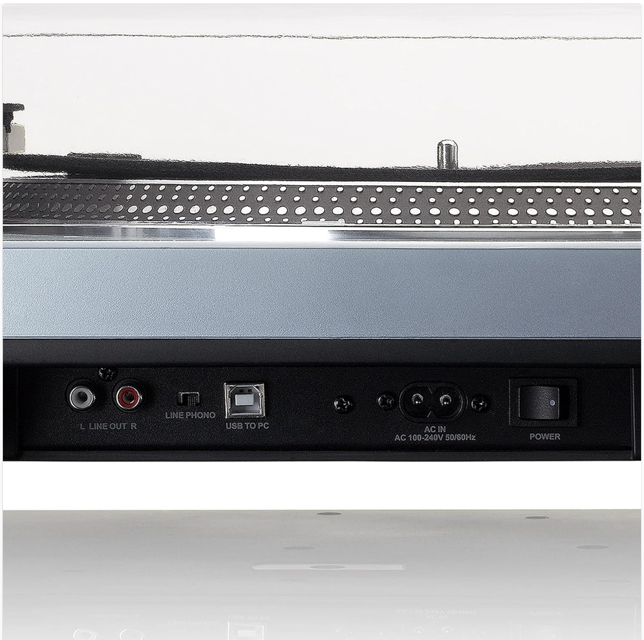
Image: Rear panel connections including RCA, USB, and power input.