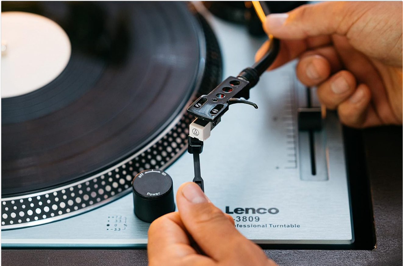
Image: Adjusting the stylus and tonearm.