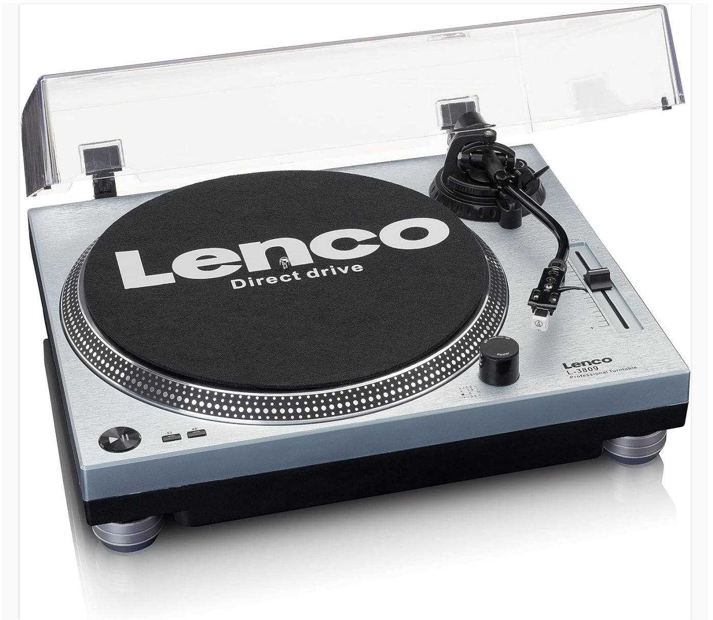
Image: Top view of the Lenco L-3809 turntable, highlighting the main components.