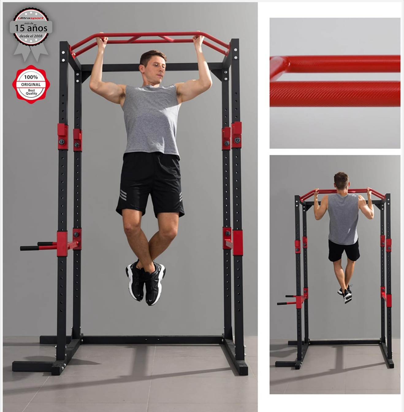
Figure 4.1: A user demonstrating pull-ups on the integrated pull-up bar of the Ultrasport Power Rack.

The integrated pull-up bar supports various grips (wide, narrow, neutral). Ensure a secure grip before performing pull-ups. Maximum user weight: 130 kg.