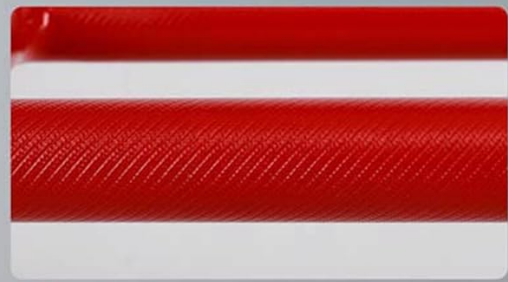
1 BARRA DE TIRO Peso máximo del usuario 130kg