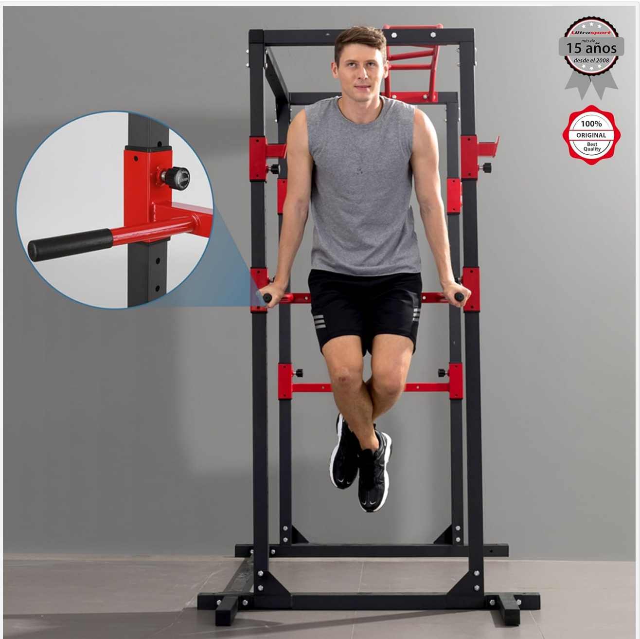
Figure 4.2: A user demonstrating dips using the adjustable dip handles on the Ultrasport Power Rack.