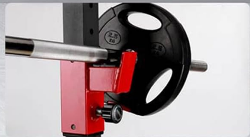
3 2 PUNTEROS AJUSTABLES EN ALTURA Peso máximo del usuario 200kg