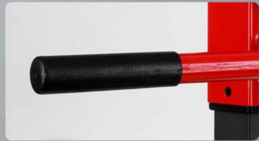
2 PIE DE PISTA Peso máximo del usuario 100kg