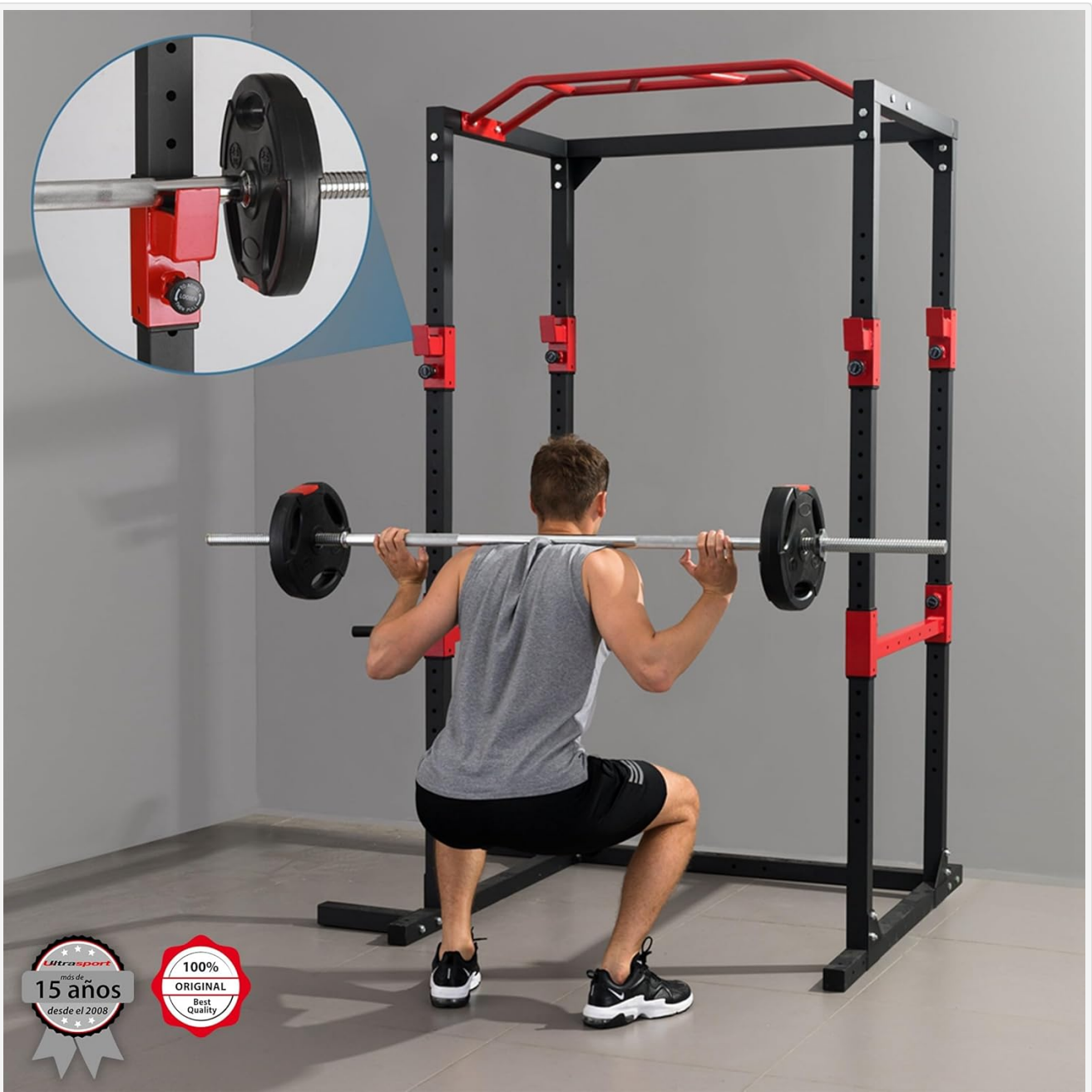
Figure 4.3: A user performing squats with a barbell, utilizing the adjustable J-hooks and safety features of the Ultrasport Power Rack.