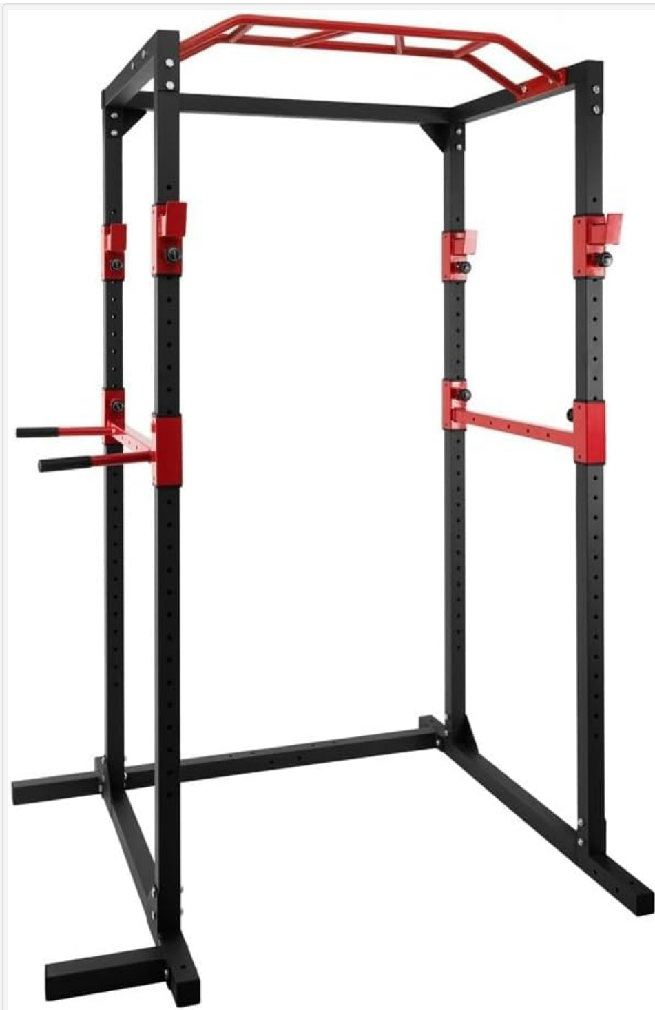
Figure 2.1: Ultrasport Multifunctional Power Rack, showing its robust black and red steel frame.