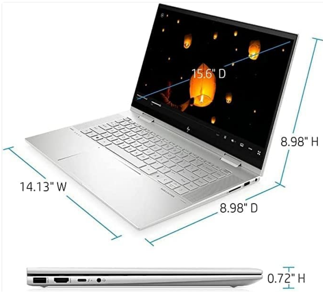
Figure 6.1: Product Dimensions.