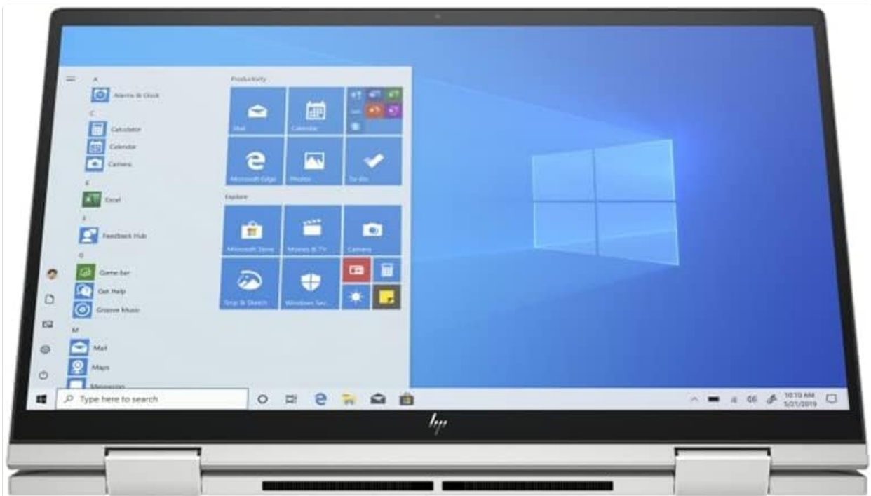
Figure 3.2: Laptop in Tablet Mode.