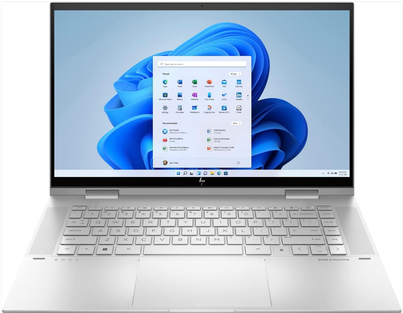
Figure 1.1: HP Envy x360 laptop with Windows desktop displayed.