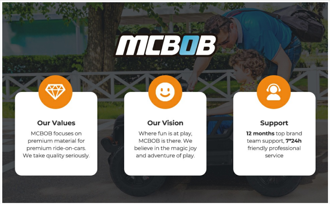
Image: MCBOB Support. Highlighting commitment to quality and customer service.