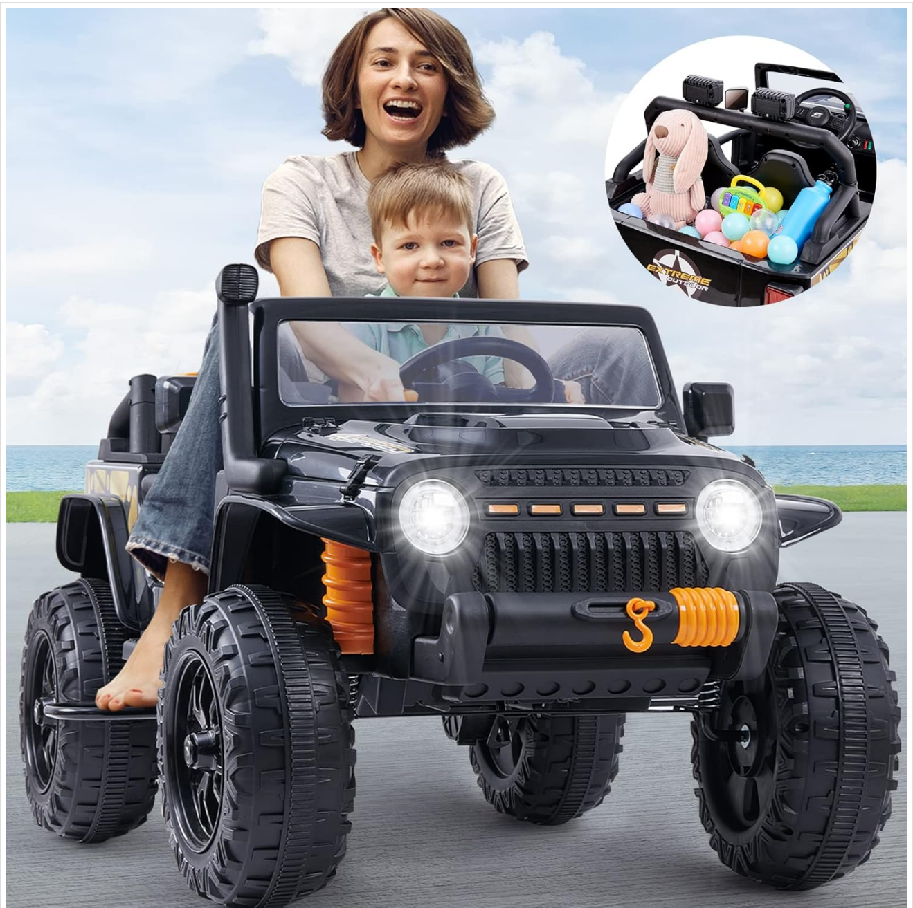
Image: MCBOB XB1118 Electric Ride-On Car. A full view of the product in use.