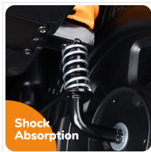
Image: Shock Absorption. The vehicle features four shock absorption springs for a smoother ride.