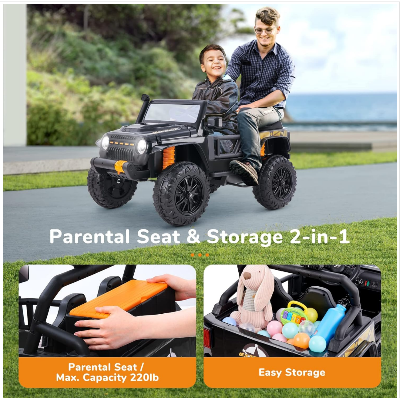
Image: Parental Seat & Storage 2-in-1. The rear seat offers versatility for parent-child driving or convenient storage.