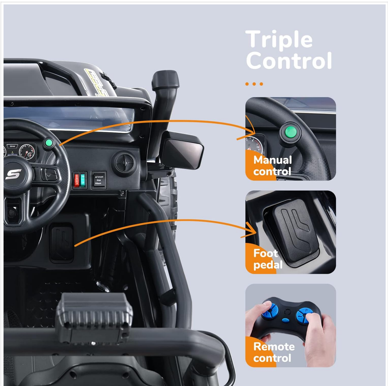
Image: Triple Control. The MCBOB XB1118 offers three distinct ways to operate the vehicle.