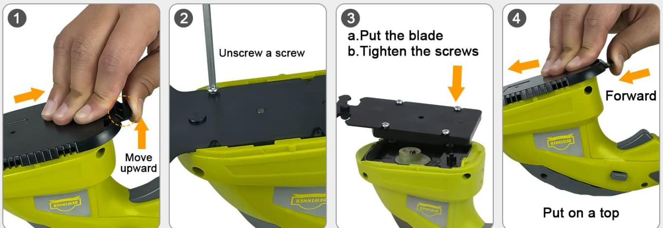
Image: Step-by-step guide for quickly changing blades: 1. Move upward to release, 2. Unscrew a screw, 3. Put the blade and tighten screws, 4. Push forward to secure the top cover.