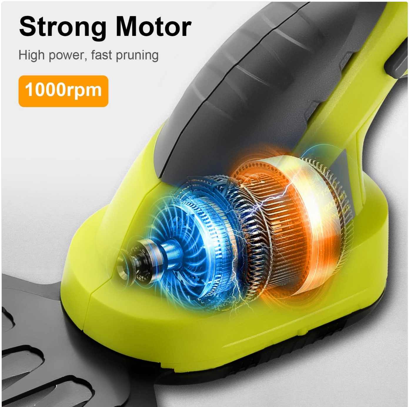
Image: Illustration of the tool's strong motor, indicating high power for fast pruning.