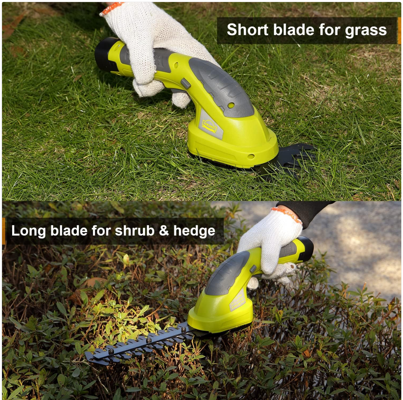
Image: Demonstrates the short blade specifically designed for grass trimming and the longer blade for shrub and hedge maintenance.

Use the shorter grass cutter blade (8) for precise trimming of lawn edges and small grass areas. The integrated roller (4) assists in smooth, even cutting when used with the extension rod.