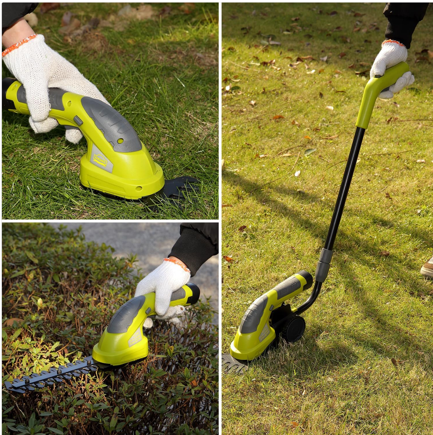
Image: Shows the DEWINNER tool in action: trimming grass edges, shaping a small hedge, and using the extension rod for ground-level grass cutting.