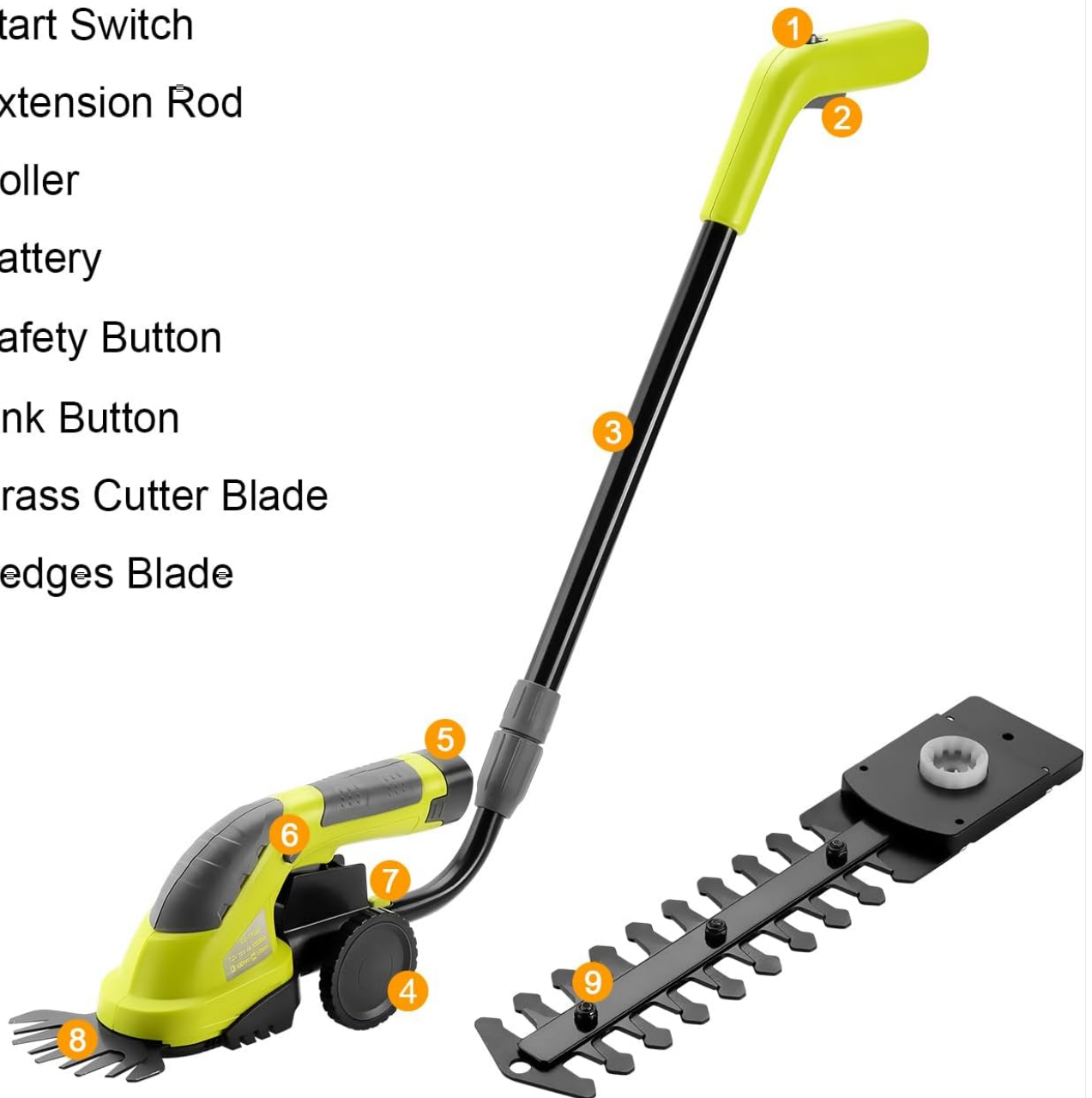
Image: Labeled components of the DEWINNER 2-in-1 tool, including the main unit, extension rod, grass shear blade, and hedge trimmer blade.