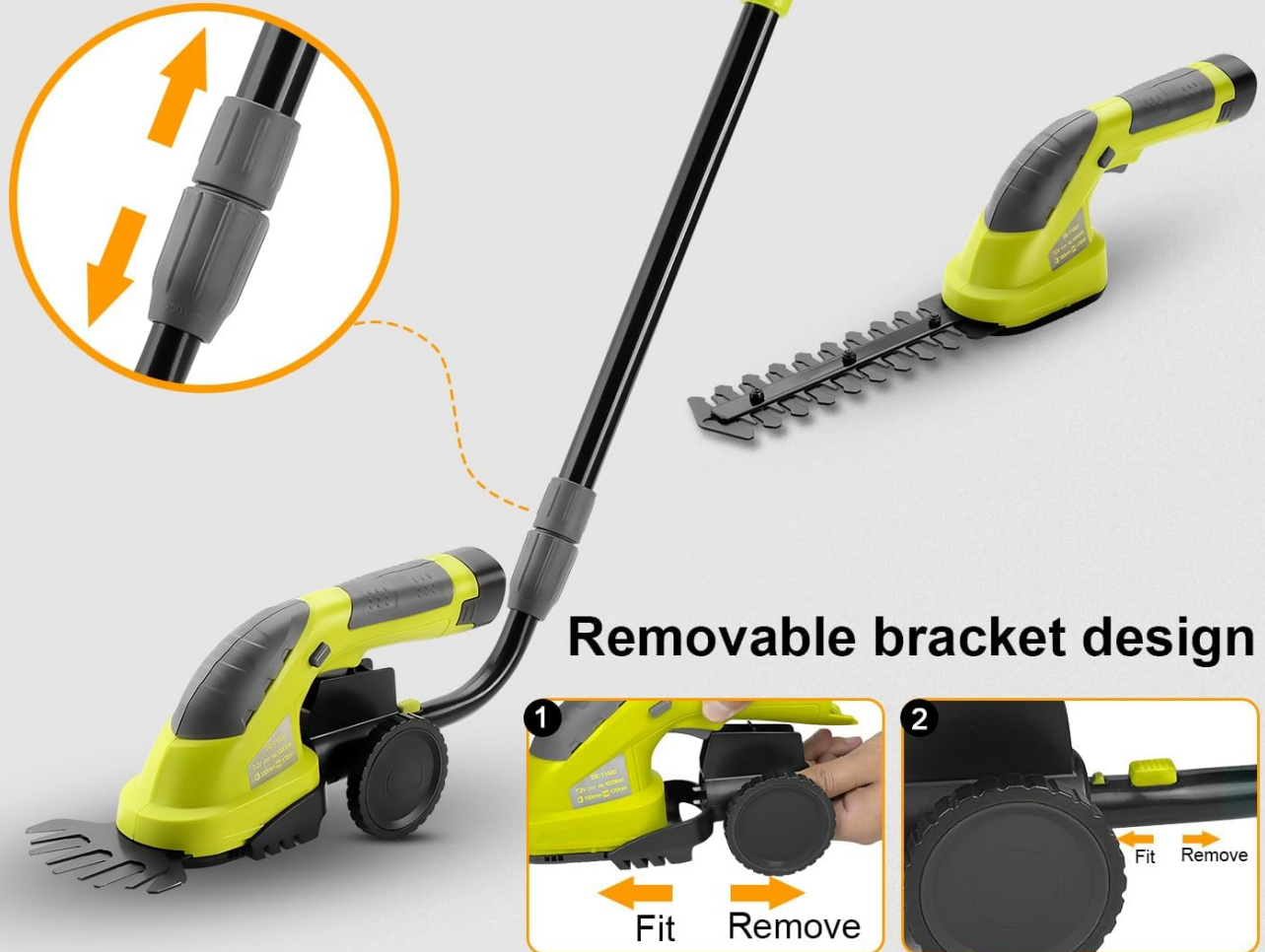
Image: Illustration demonstrating how to attach and adjust the retractable extension rod, allowing trimming up to 90cm without bending. It also shows the removable bracket design for easy attachment and removal.

Telescopic design can be trimmed without bending over [MAX 90CM]