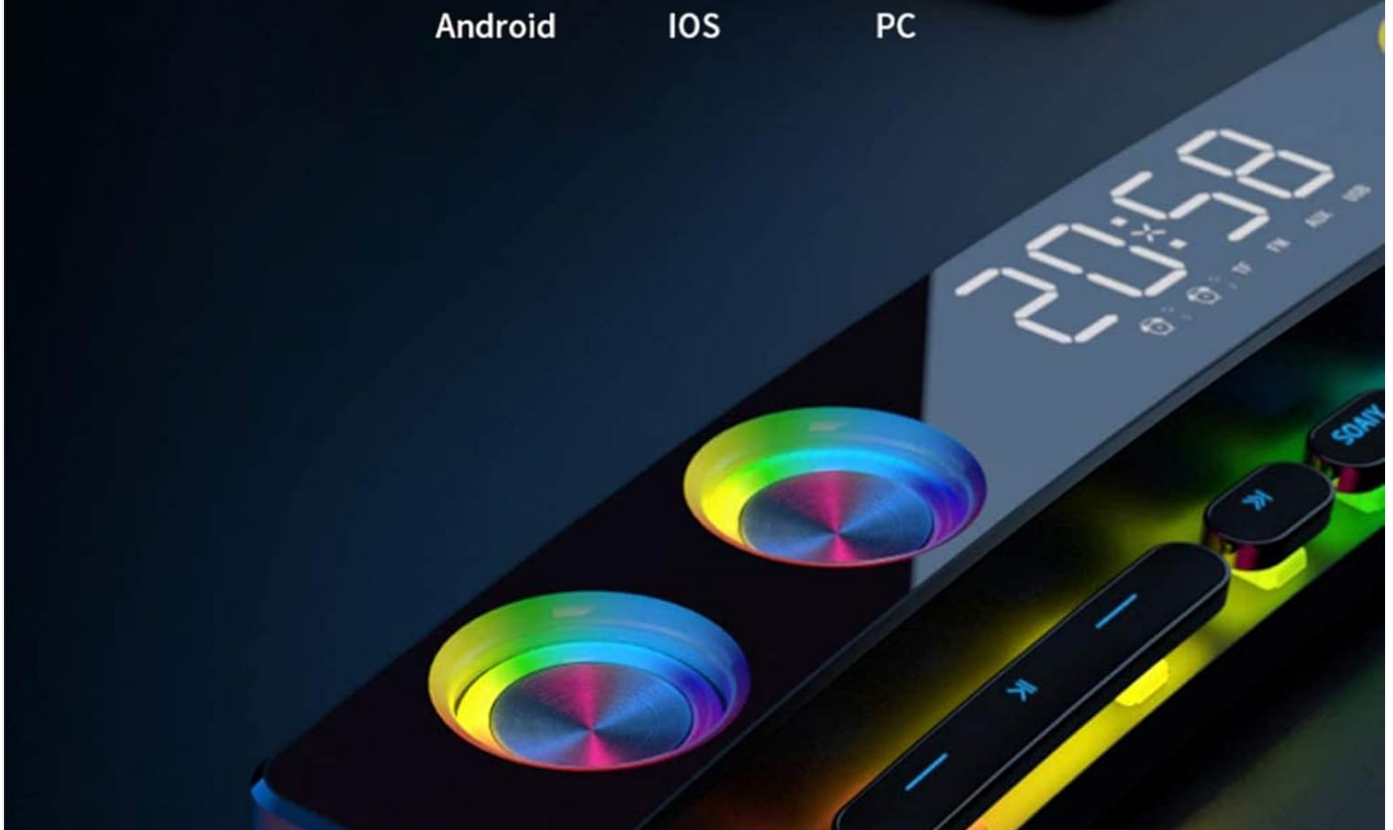
Figure 5: The SH39 speaker is compatible with various Bluetooth devices including Android, iOS, and PC.