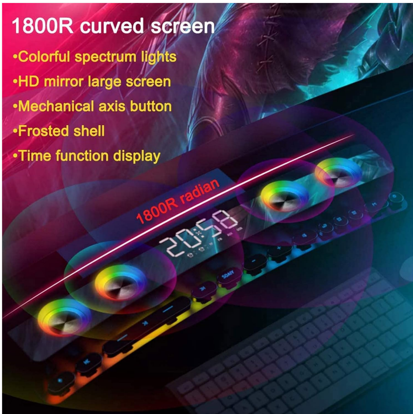
Figure 2: Close-up view of the Nahamo SH39 speaker's 1800R curved screen and colorful spectrum lights.