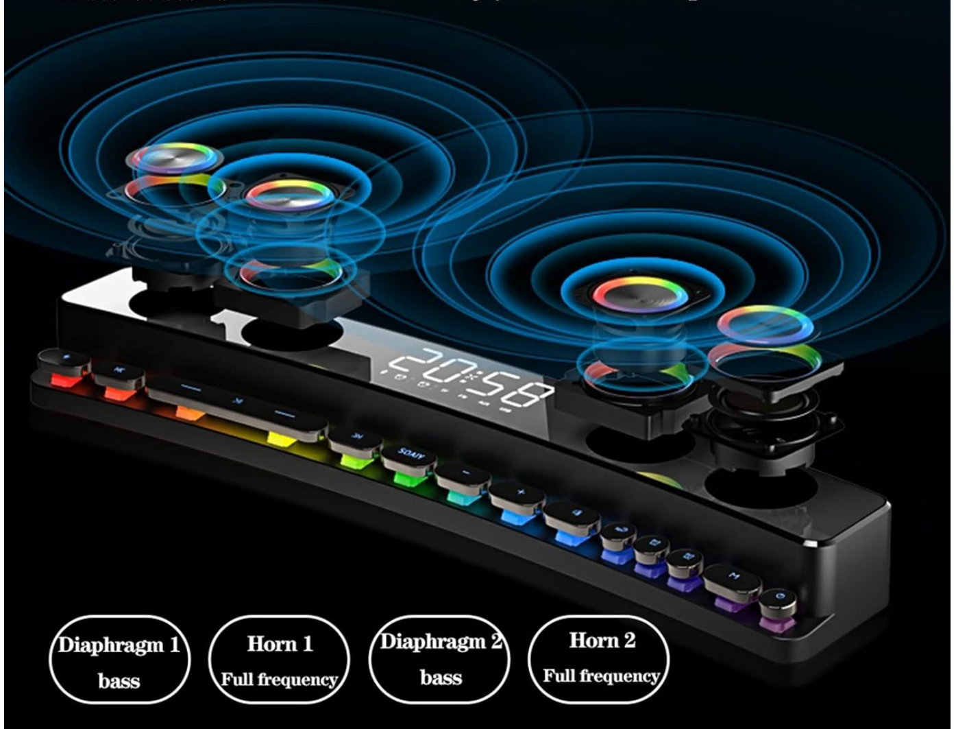
Figure 7: Illustration of the speaker's dual 6W high-power speakers and dual diaphragms for enhanced bass and full-frequency audio.