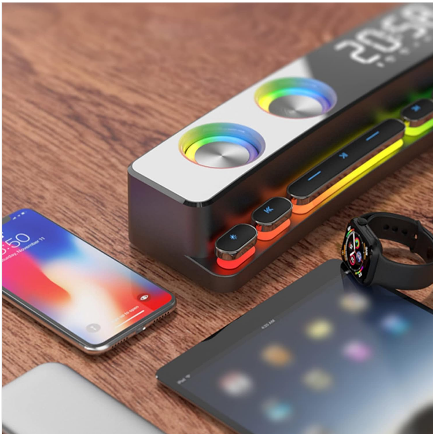
Figure 4: The SH39 speaker offers versatile connectivity, shown here with a smartphone, tablet, and smartwatch.