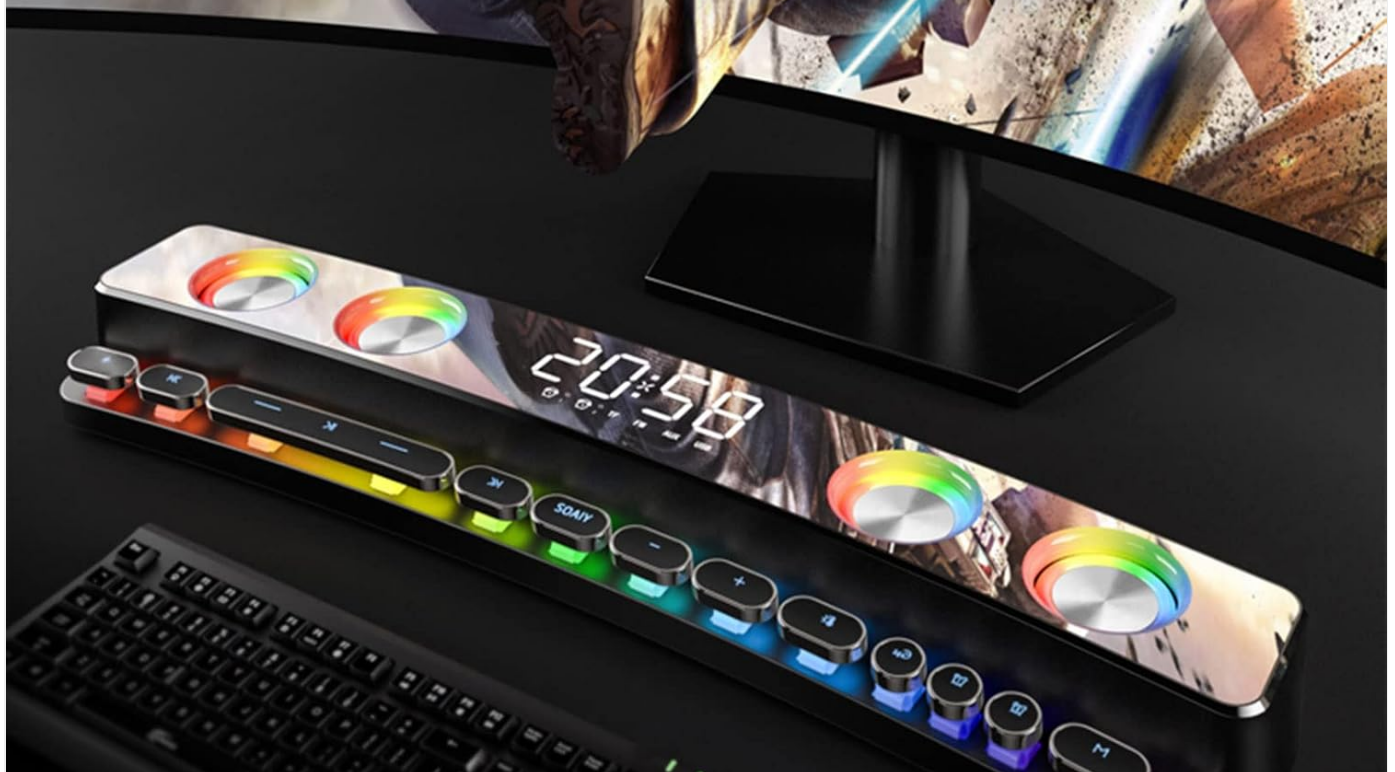
Figure 3: The SH39 speaker delivers Hi-Fi sound quality with clear, melodious, and surround sound.

Freely adjust the bass and open the way to super god