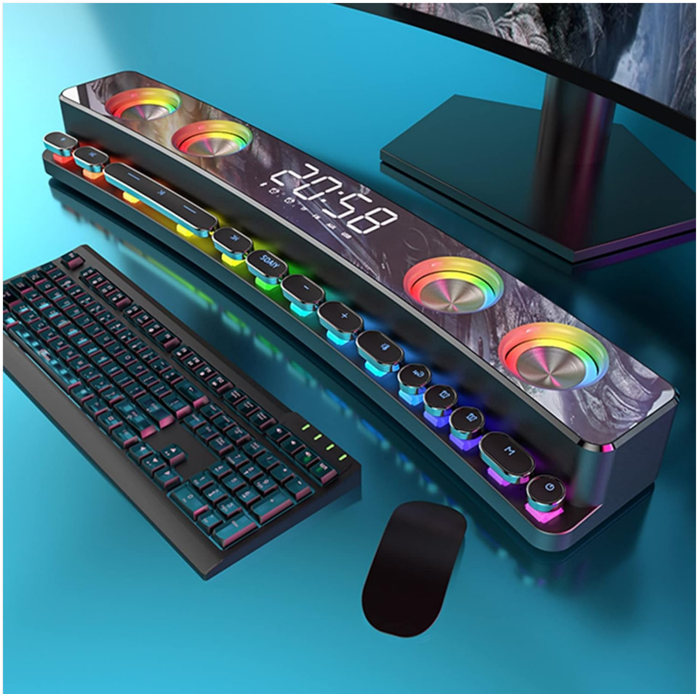
Figure 1: Nahamo SH39 speaker setup on a desk with peripherals.