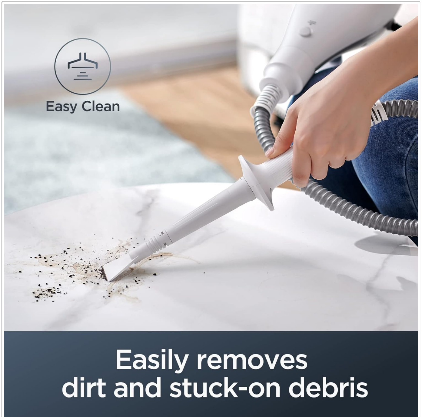
Image: The detachable handheld unit of the Eureka Steam Mop being used with a scraper tool to remove dirt and debris from a countertop.