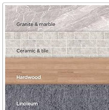
Image: A graphic illustrating the Eureka Steam Mop's compatibility with multiple flooring types including granite, marble, ceramic, tile, hardwood, and linoleum.